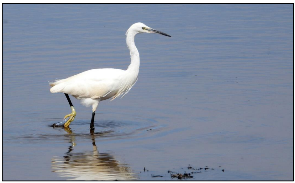
Little Egret Mid-Argyll Apr 2020 Jim Dickson

Autumn/winter Reports from all areas except ( Coll/Colonsay/Jura/Mull ). Again, total numbers uncertain, however a min of 14 and a max of 18 birds probably involved. Reported from 'sites', with 1-8 birds in; Cowal (5), Islay (2), Kintyre (6), Mid-Argyll (7), North Argyll (3) and Tiree (1). Many sites had 1-2 birds present and an Argyll record count of 8 was at the Holy Loch Cowal on 15-19 Oct after a steady increase from 4 there in late Aug. There were 4 at Kennacraig, West Loch Tarbert Kintyre in late Aug to early Sep, a max of 3 at Loch Gilp Mid-Argyll in Oct-Dec and a max of 3 at Carnain, Loch Indaal Islay on 10 Nov. As elsewhere in the UK this species continues to increase in Argyll, particularly in the autumn and winter months and we can speculate that they may perhaps breed here within the next few years.