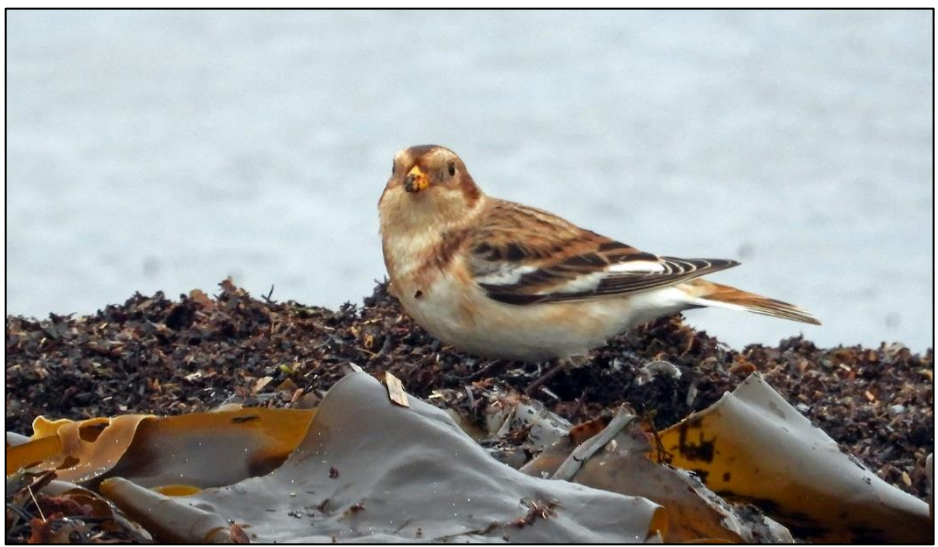
Snow Bunting Kintyre Feb 2020 Jim Dickson

Spring A summer male was with Skylarks on the Coullabus to Loch Indaal track Islay on 9 Mar. Autumn/winter Singles were at Sandaig Tiree on 5 Sep, at Gott Bay Tiree on 6-9 Sep, at Loch Gruinart Islay on 6 Sep, at Crossapol Coll on 18 Sep, at Balnahard Colonsay on 27 Sep, at Loch Kinnabus Islay on 16 Oct, 3 & 7 Dec and at Loch Tarbert Jura on 30 Oct.