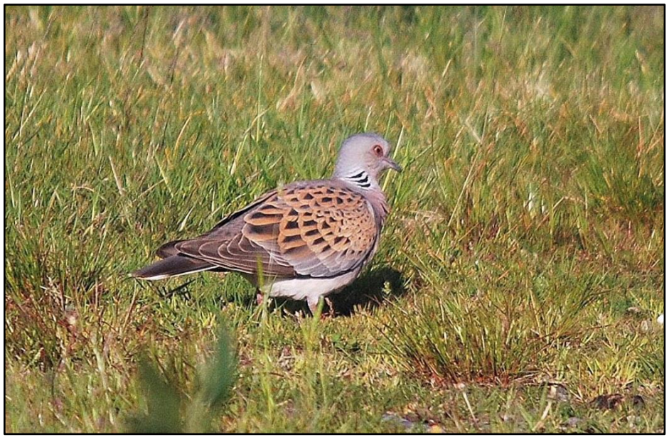
Turtle Dove Mull Jun 2020

Autumn A juv (1cy) was at Caliach Mull on 16 Sep and an adult was at The Lodge, Arinagour Coll on 17 Sep.