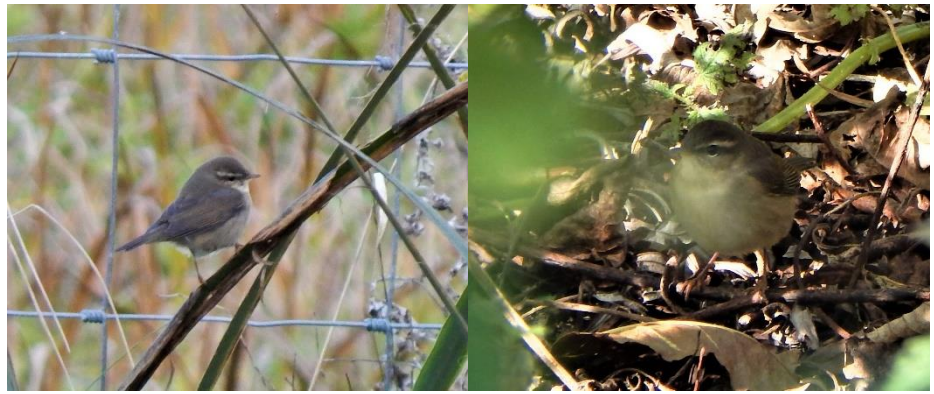
Dusky Warbler Tiree Oct 2020