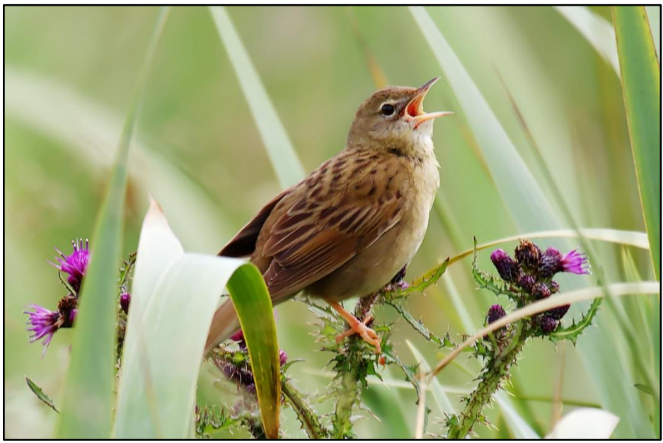
Grasshopper Warbler Mid-Argyll Jul 2020