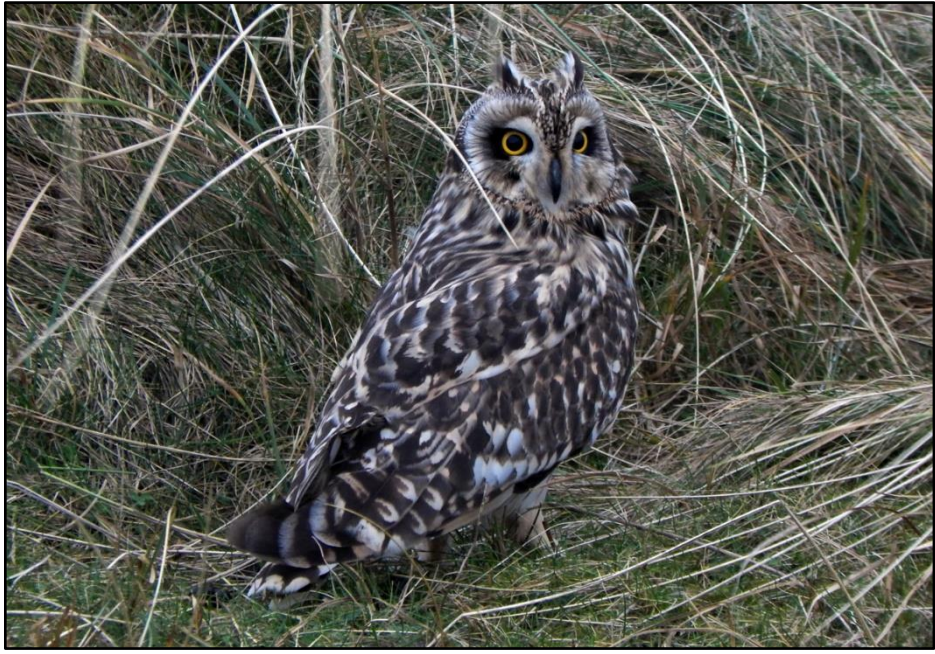
Short-eared Owl Tiree Jan 2020