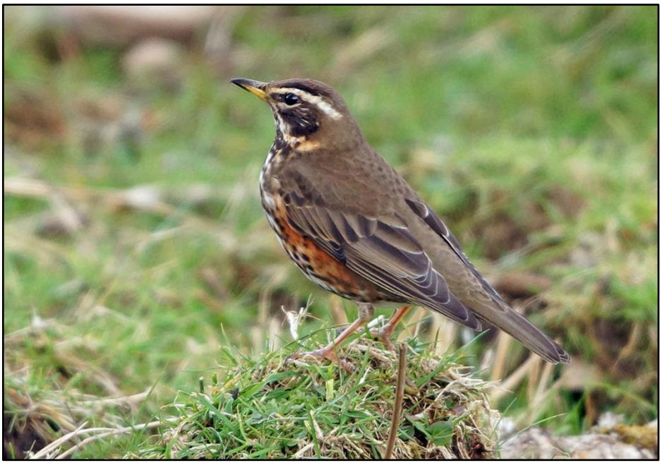
Redwing Mid-Argyll Apr 2020 Jim Dickson

Knapdale Mid-Argyll on 27 Oct, 170+ at Clunach Islay on 1 Nov, 140 at Bleachfield Kintyre on 22 Nov, 120 at Kilmichael Glen Mid-Argyll on 19 Nov and 120 at Balephuil Tiree on 14 Oct. Most birds had moved on by late Nov and only one report in Dec.