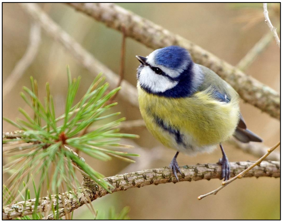
Blue Tit Mid-Argyll Apr 2020 Jim Dickson

2 were at The Glebe, Scarinish on 12 Oct, then an island record of 4 there on 13 Oct and 1 at Heylipol Church on 12 Dec.