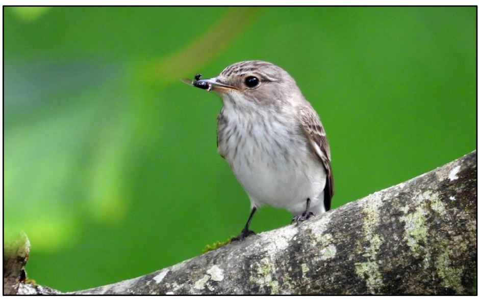
Spotted Flycatcher Mid-Argyll Jun 2020 Jim Dickson

Autumn Local breeding birds had departed by 18 Aug. Only migrant was 1 at An Airidh Tiree on 9 Oct.