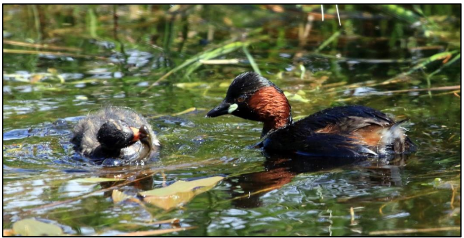
Little Grebe Cowal Jul 2020 Leif Brag

Autumn Only one report. A single passed Hynish Tiree on 20 Aug.