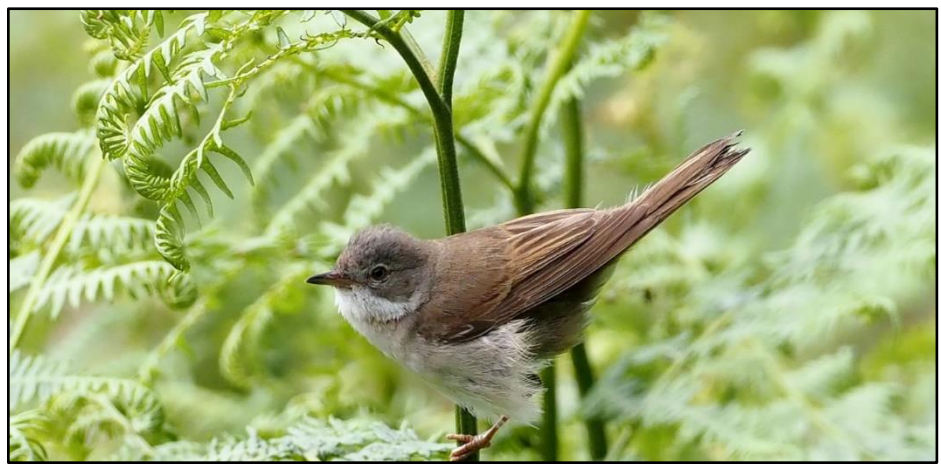
Common Whitethroat Mid-Argyll Jun 2020

Autumn Reports decreased during Aug and most birds had departed by early Sep. Last reports of singles at Balephuil Tiree on 15 Sep, Laphroaig Islay on 29 Sep and a late bird at The Oa Islay on 21 Oct.