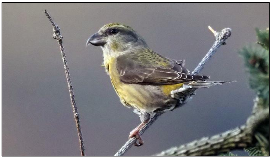
Common Crossbill Mid-Argyll Feb 2020 John Speirs

Autumn/winter Reports from only (Islay/Kintyre/Mid-Argyll/North Argyll). Low counts of only 1-8 birds. No reports in Oct or Dec.