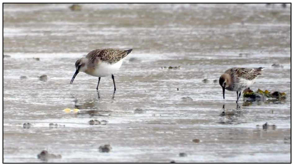
Curlew Sandpiper with Dunlin Islay Sep 2020 Jim Dickson

Summer/breeding Up to 5 males and a female were at one site from 5 May until mid-Jun and up to 5 males were at another site from 20 May until 8 Jun. Breeding was thought to be unsuccessful. Autumn/winter Reports from only ( Islay/Kintyre/Mull/Tiree ). On Tiree first juv was at Vaul on 21 Aug then 1-2 birds across island sites, and a max of 3 on 31 Aug, with last single on 30 Sep. On Islay 1 was at RSPB Loch Gruinart on 22 Aug, 2 at Bridgend merse, Loch Indaal on 3 Sep, 2 at RSPB Loch Gruinart on 3 Oct and last single there on 6 Oct. In Kintyre singles were at Machrihanish SBO on 4 & 15 Sep and 2 at Strath pools, The Laggan on 6 Sep. In Mid-Argyll 1 was at Loch na Cille, Keills on 22 Aug, and on Mull singles were at Ardalanish on 17 Sep, at Calgary on 20 Sep and 5 at Fidden on 23 Sep.