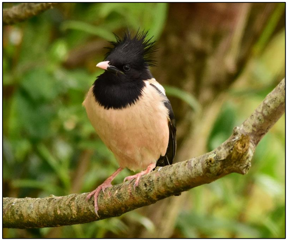
Rosy Starling Mull Jul 2020 Bryan Rains

Autumn/winter Reports of mostly singles from 'sites' in Cowal (4) Islay (2), Mid-Argyll (7) and Mull (6). Max count of 6+ at Laphroaig woods Islay on 6 Nov.