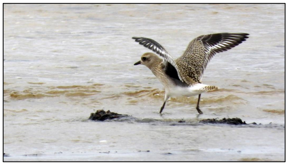
Grey Plover Tiree Sep 2020 Jim Dickson

na Keal on 23 Sep with 1 until 12 Dec. On Tiree single juvs were at 8 sites from 26 Sep to 28 Nov with 4 at Gott Bay on 8 Oct and 4 at Clachan on 28 Nov.