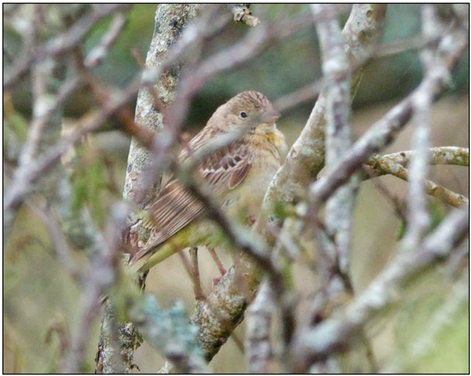
Black-headed Bunting Islay Oct 2020 Dan Brown

Autumn/winter Reports from all areas and generally widespread in small nos of 1-8 birds at sites. Max counts of 45 at Dalvore Mid-Argyll on 7 Nov, 20 at Machrihanish airbase site Kintyre on 28 Nov, 12 at RSPB Kinnabus, The Oa Islay on 2 Oct, 12 at RSPB Loch Gruinart Islay on 1 Dec and 10 at Ard Luing, Luing Mid-Argyll on 29 Dec.