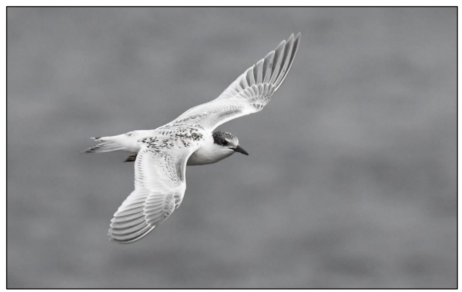
Sandwich Tern Kintyre Jul 2020