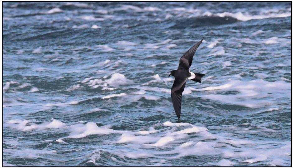
Leach's Storm Petrel Kintyre Oct 2020 Eddie Maguire

Breeding No counts or data from the known breeding colonies on Sanda Kintyre or Treshnish Isles Mull as no visits due to Covid-19 restrictions.