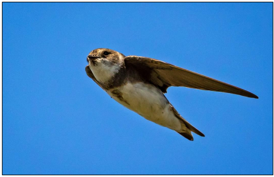
Sand Martin Mid-Argyll May 2020

Autumn Reports from all areas except ( Jura ). Most birds had departed by mid-Sep. Highest counts of 40 at Carnan Mor Tiree on 3 Sep and 30 at RSPB Kinnabus, The Oa Islay on 7 Aug. Last report was of 2 at Castle Sween Mid-Argyll on 2 Oct.