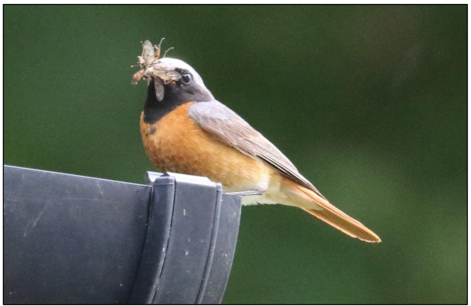
Common Redstart Mull Jun 2020