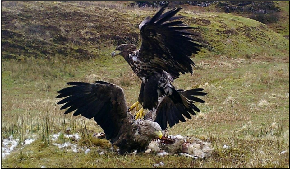
White-tailed Eagles Mid-Argyll Apr 2020 Ann McGregor

Breeding Of the 43 Ters checked, 35 prs laid eggs 29 prs fledged a min of 34 young (ARSG).