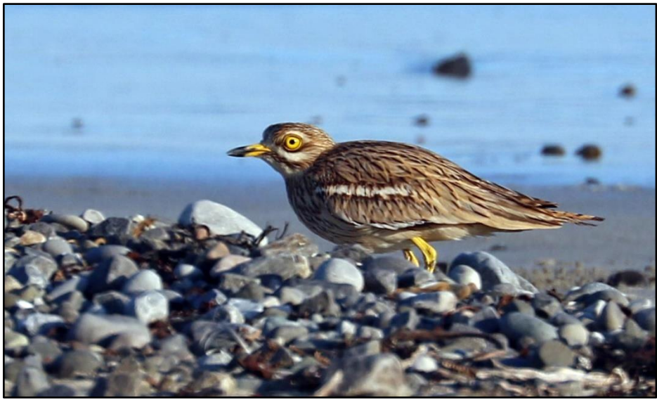
Stone-curlew Mull Apr 2020