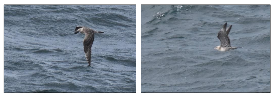
Long-tailed Skua Islay ferry Aug 2018

Autumn/winter Three were at Machrihanish SBO Kintyre on 3 Aug, also 1 on 12 Aug, 3 on 4 Sep and 3 on 12 Sep. One was at Loch Eatherna Coll on 18 Aug, 1 was at The Reef, 2 at Hynish on 20 Aug and 1 at Hynish on 2 Sep, all Tiree , 1 was at Balnahard Bay on 3 Sep and 2 at Port Mor on 5 Sep, both Colonsay , 1 was at Frenchman's Rocks Islay on 3 Sep, also 2 on 5 Sep and 3 on 6 Sep, 1 was at Caliach Point Mull on 9 Sep, 1 seen from the Kennacraig to Islay ferry on 9 Sep, 1 was off Scarba Mid-Argyll on 23 Sep, 1 was at Aird on 9 Oct and 1 at Vaul Bay on 9 Oct, both Tiree and last report of 1 seen from the Kennacraig to Islay Ferry on 9 Nov.