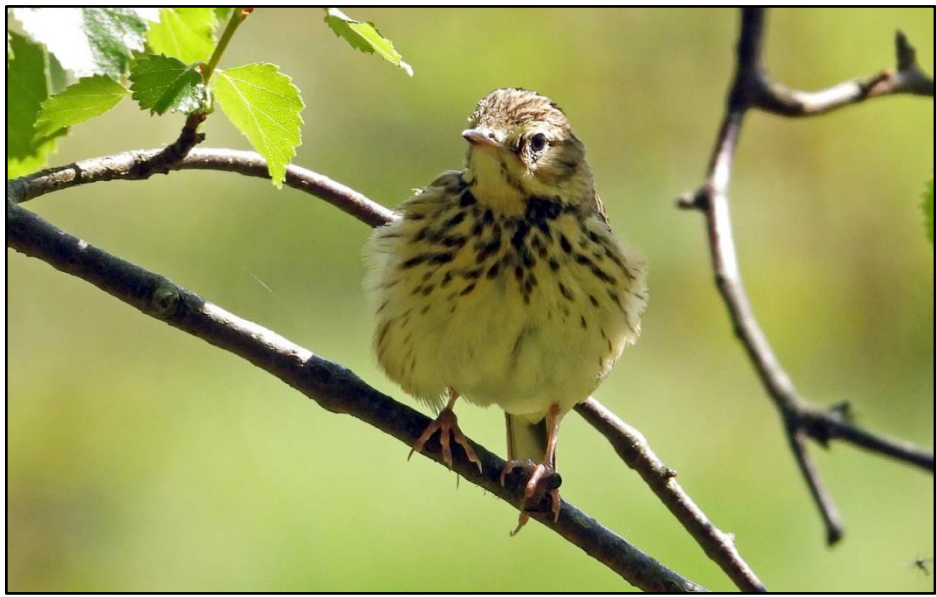
Tree Pipit Mid-Argyll May 2020 Jim Dickson

Spring/summer/breeding Reports from only ( Cowal/Kintyre/Mid-Argyll/Mull ). First reports from Balliscate, Tobermory Mull on 12 Apr, Glen Lean Cowal on 13 Apr and Duntrune Mid-Argyll on 13 Apr. Higher counts of 5 nr Salen Mull on 7 May and 4 at Rhudle BBS transect Mid-Argyll on 7 Jun. Sightings well down across Argyll on previous years presumably due to Covid-19 restrictions in May. Only three reports in Jul and last report was of one killed by a car at Loch Awe Mid-Argyll on 1 Aug.