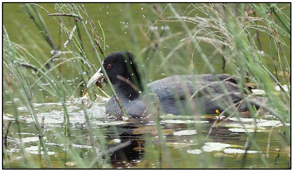
Coot Mid-Argyll Sep 2020

Autumn/winter A 1cy was at Loch Bhasapol Tiree on 27 Oct-17 Nov. One was at Glenfeochan House, Balinoe Mid-Argyll on 4 Sep.