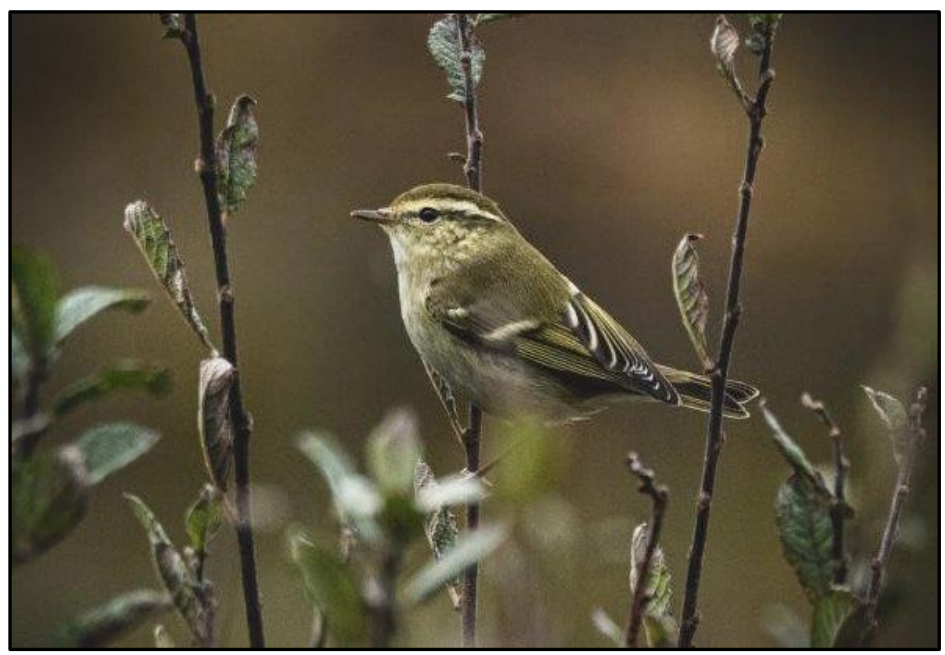
Yellow-browed Warbler Islay Oct 2020 David Wood