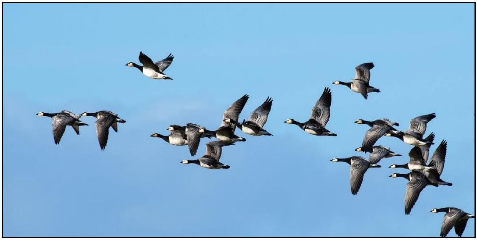
Barnacle Geese Islay Mar 2020 Steve Carter

Autumn/winter Up to 3 Todd's type birds on Islay on 18 Oct-19 Nov. One at RSPB Loch Gruinart on 18 Oct showed a black throat stripe similar to a Taverner's type, but is included here as Todd's due to size and was reported again at Bridgend on 23 Oct and possibly same at The Oa in Nov. Two together at Bridgend on 24 Oct, otherwise all reports across several locations were of singles. One, presumed returning, Todd's type was at Balephetrish Tiree on 5 Nov then seen at various sites across NW Tiree until the year end with a second almost identical bird at sites in East Tiree from 9 Nov until the year end. All reports subject to acceptance by the BBRC.