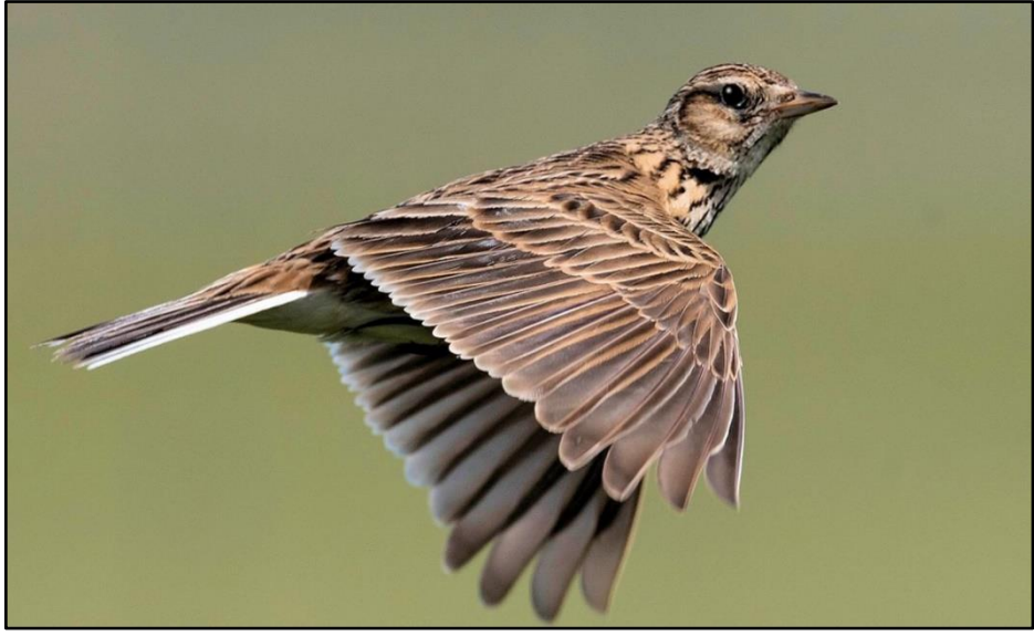
Skylark Kintyre May 2020

Autumn/winter Reports from all areas except (Jura/Tiree). All reports of only 1-5 birds.