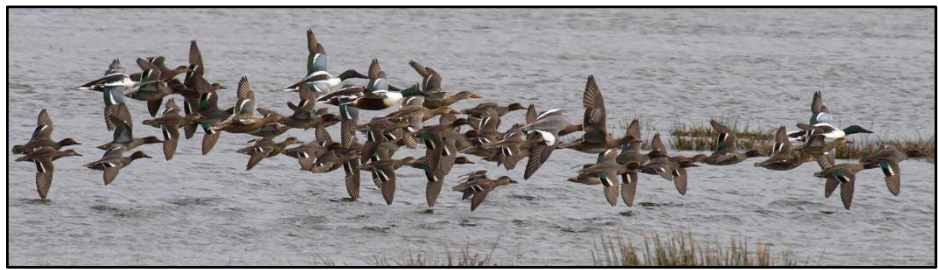
Shoveler & Teal Islay Feb 2020

Autumn/winter Reports from only ( Islay/Kintyre/Tiree ). Max count of 97 at RSPB Loch Gruinart Islay on 31 Oct, and on Tiree a max count of 7 at An Fhaodhail on 17 Dec. In Kintyre 6 >S at Machrihanish SBO on 4 Oct and 1 >S on 26 Oct.