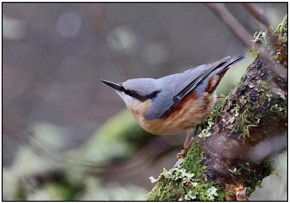
Nuthatch Cowal Dec 2020 Andrew MacFarlane

Autumn/winter Reports from all areas. Generally, 1-6 birds noted at sites and a max of 7 at Laphroaig woods Islay on 2 Nov.