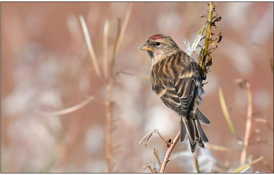
Lesser Redpoll Kintyre Sep 2020 Jo Goudie

Autumn/winter Present on Tiree until 28 Oct and a max site count of 25 at Balephuil on 18-30 Sep.