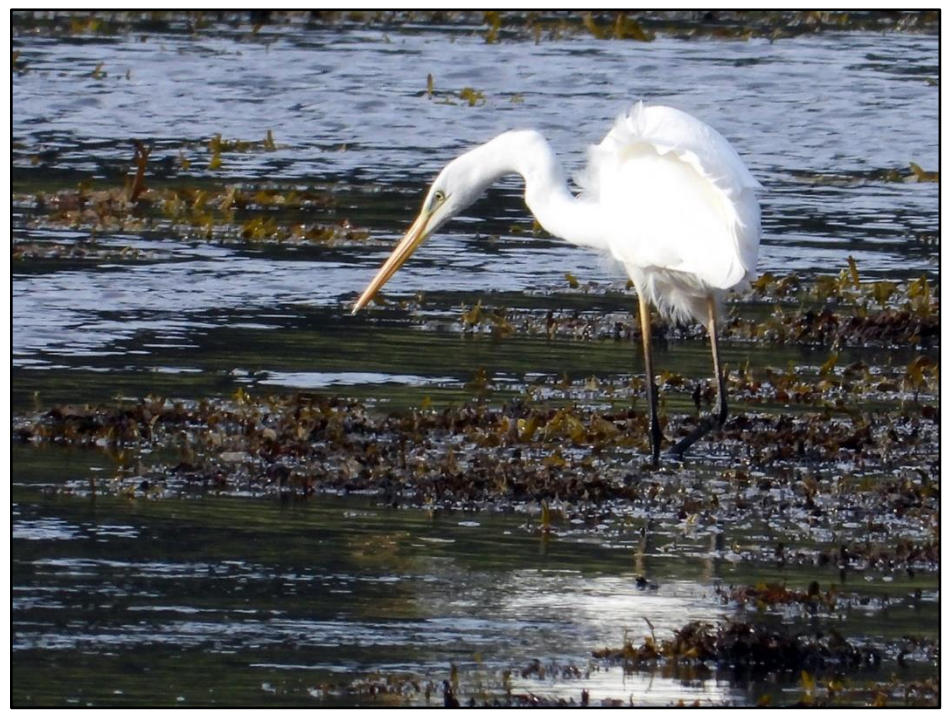
Great White Egret Mid-Argyll Aug 2020