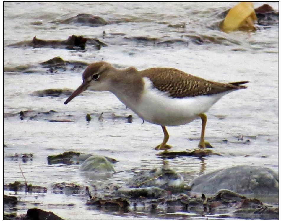
Spotted Sandpiper Tiree Sep 2020