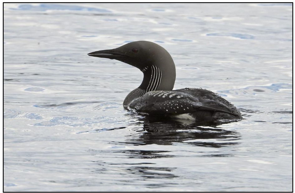
Black-throated Diver Mid-Argyll Jul 2020 Jim Dickson

Autumn/winter Reports from all areas except ( Jura ). Max counts of 41 at Loch Indaal Islay on 17 Oct and 27 at the Sound of Gigha Kintyre on 17 Oct. A total of 49 birds >S past Machrihanish SBO Kintyre in Oct with peak count there of 14 on 10 Oct.