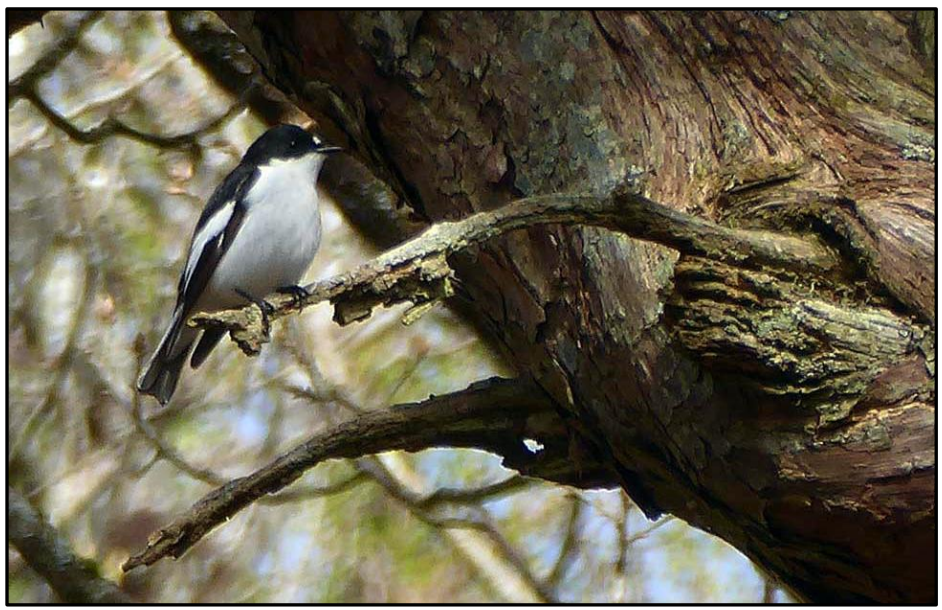
Pied Flycatcher Mull Apr 2020 Stuart Gibson

Autumn Four different single 1cy birds were at Balephuil Tiree on; 16 Aug, 19 Aug, 27-28 Aug and on 20 Sep. A 1cy was at Kinnabus, The Oa Islay on 27 Sep.