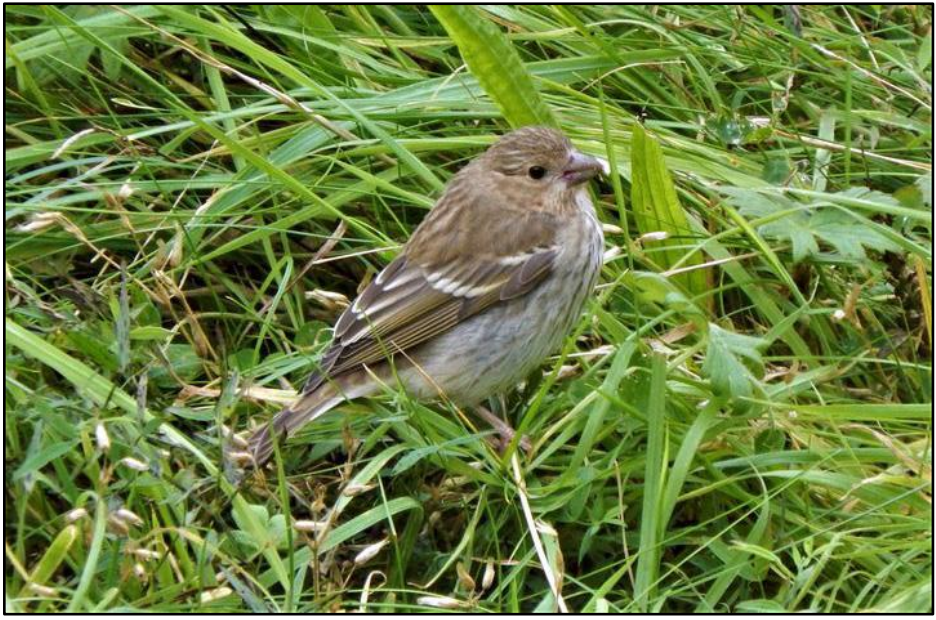
Common Rosefinch Tiree Sep 2020

Autumn/winter Reports from all areas except ( Coll/Colonsay/Jura/Tiree ). Most reports in; Sep (17), Aug (9), Oct & Nov (3) and Dec (1). Max counts of 26 nr Strachur Cowal on 4 Aug, 10 nr Bunnahabhainn Islay on 14 Nov and 8 at Fennachrochan, Lismore North Argyll on 9 Sep. Elsewhere, counts of 1-6 birds.