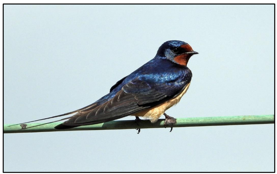
Barn Swallow Mid-Argyll May 2020 Jim Dickson

Sep. Most birds had departed by end of Sep, smaller nos until mid-Oct and scattered reports of 4 singles in Nov with last reports at Dervaig Mull on 26 Nov and at Kildalloig Kintyre on 30 Nov.