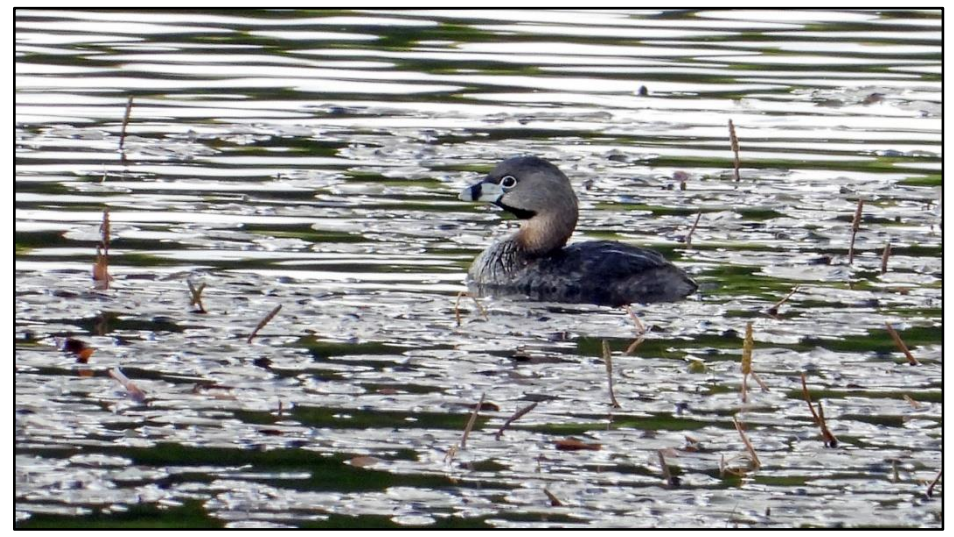
Pied-billed Grebe Mid-Argyll Jun 2020