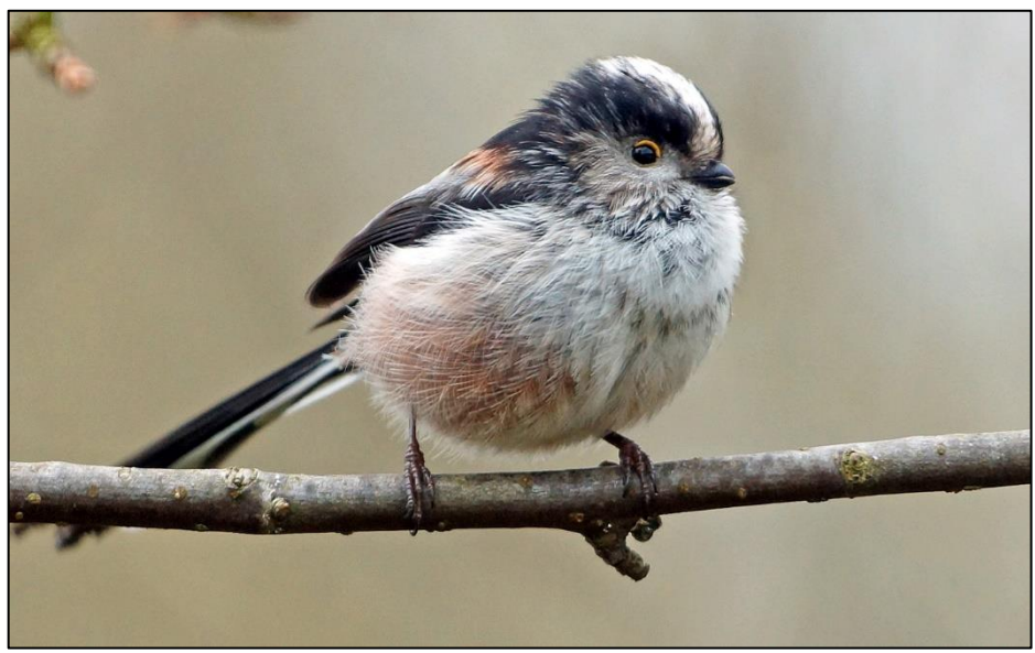
Long-tailed Tit Mid-Argyll Nov 2020 Jim Dickson

Autumn/winter Reports from all areas except ( Jura/Tiree ). Most counts of 1-12 birds and mostly from sites in Mid-Argyll (11) and Mull (8). Max counts of 16 at Cairnbaan Mid-Argyll on 15 Oct, 15 at Craignure Mull on 2 Nov, 14 at RSPB Kinnabus, The Oa Islay on 2 Oct, and 14 at the Holy Loch Cowal on 30 Dec.