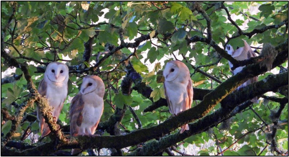
Barn Owls Mid-Argyll Jul 2020