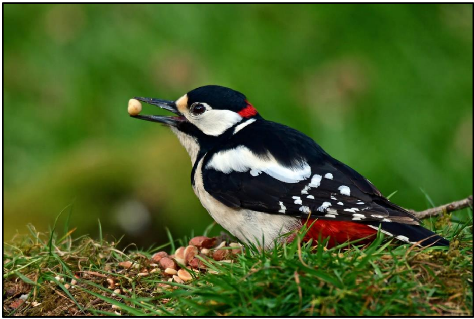
Great Spotted Woodpecker Mid-Argyll Apr 2020

Autumn/winter Reports and sites reported from only: Islay (6), Kintyre (1), Mid-Argyll (14), Mull (7) and all of 1-2 birds.