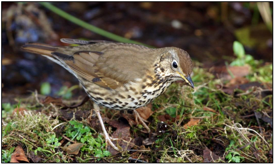
Song Thrush Mid-Argyll Apr 2020 Jim Dickson

Autumn/winter Reports from all areas. Only small numbers noted, generally of 1-5 birds and a max of only 10 at Machrihanish Kintyre on 7 Nov, 10 at West Hynish Tiree on 7 Nov and 8 at Keillbeg, Loch na Cille Mid-Argyll on 22 Aug.