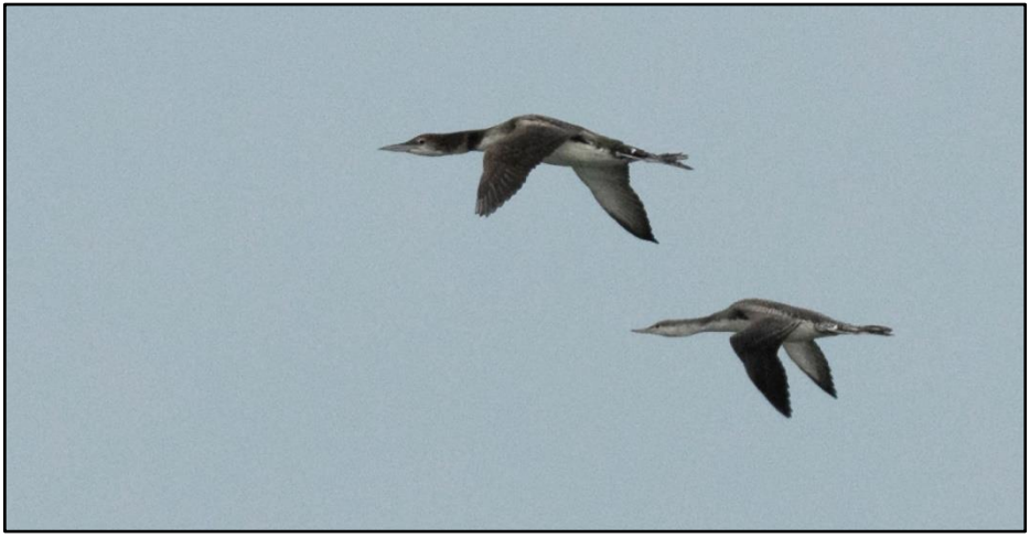
Great Northern & Red-throated Divers Kintyre Oct 2020 Eddie Maguire

Autumn/winter Reports from all coastal areas. First autumn birds were 3 at mouth of Loch Caolisport Mid-Argyll on 15 Aug. Max counts of 88 at Loch na Keal Mull on 9 Nov, 76 at the Sound of Gigha Kintyre on 17 Oct, 50 at Loch Indaal Islay on 23 Sep and 48 at Loch Scridain Mull on 6 Nov.