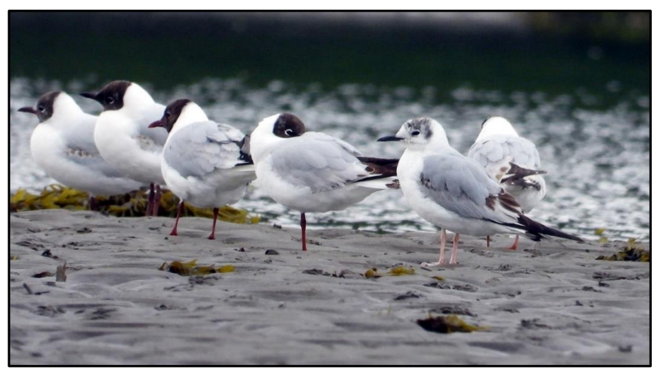
Bonaparte's Gull with Black-headed Gulls Mid-Argyll Jun 2020