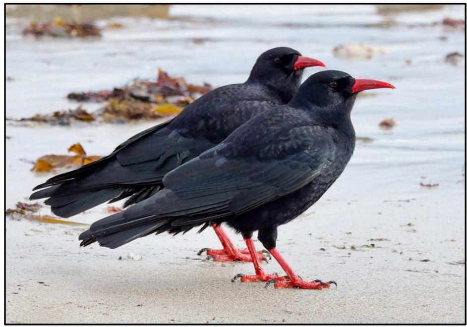
Chough Islay Nov 2020 Dan Brown

Autumn/winter Reports from only ( Colonsay/Islay ). Few counts received, however max counts on Islay of 42 roosting at RSPB Smaull in Aug, a mobile flock of 50 at Eilean Mor on 8 Aug and 29 at Ardnave in Oct. On Colonsay in Sep, mostly 2 birds at sites and a max of 6 together on 6 Sep.