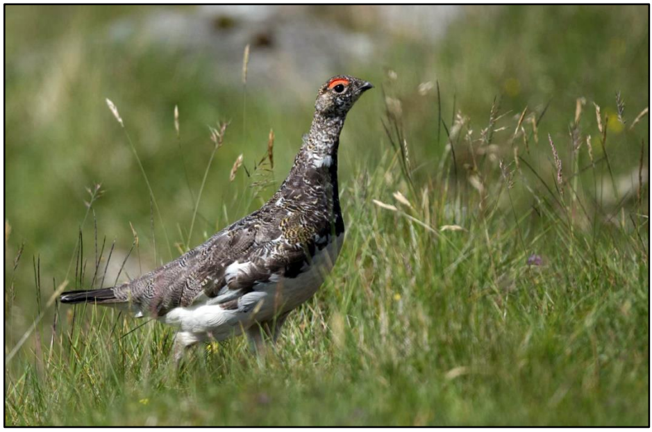
Ptarmigan Mull Jul 2020 Ewan Miles

Autumn/winter Two were N of Strachur Cowal on 4 Aug and up to 7 were at Feochag, S of Campbeltown Kintyre between 15 Sep- 6 Oct.