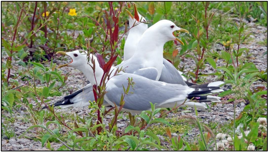
Common Gulls Mid-Argyll Jun 2020

Autumn/winter A 2cy, with yellow c/r on L leg, was at the Add Estuary Mid-Argyll on 22 Jun, also an adult was there on 29 Jun, a new 2cy there on 5 Jul and a 1cy there on 24 Aug. A 2cy flew S past Machrihanish SBO Kintyre on 28 Jun. A 2cy was at Eilean Traighe, Ormsary Mid-Argyll on 6 Aug. An adult was at Otter Ferry Cowal on 12 & 17 Dec.