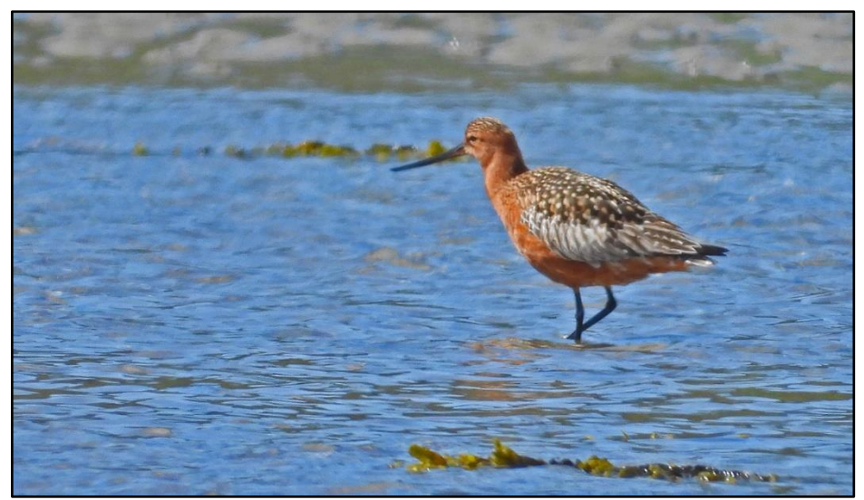
Bar-tailed Godwit Mid-Argyll May 2020

Autumn/winter Reports from all areas. Return passage from late Jun. Max counts of 168 at the Holy Loch Cowal on 26 Sep, 161 on Tiree WeBS counts on 28 Nov, 127 at RSPB Loch Gruinart Islay on 24 Aug and 100 at Loch Don Mull on 17 Sep. Many other sites held up to 60 birds.