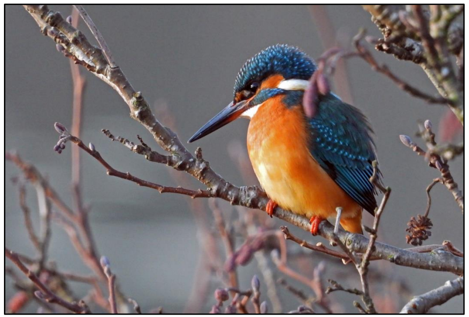
Kingfisher Mid-Argyll Feb 2020 Jim Dickson

Autumn Reports from all areas except ( Coll/Jura/North Argyll ). Reported from 13 locations in Aug with max counts of 20 in Campbeltown Kintyre 11 Aug and 7 at Kilmichael Glassary Mid-Argyll on 20 Aug. Most birds had departed by late Aug however a juv in a nest box at Kilmichael Glassary was reluctant to leave until 9 Sep. One was at Balnahard Bay Colonsay on 3 Sep. One was seen briefy at Machrihanish Kintyre on 22 Oct and Pallid Swift not ruled out. One was found (dead several days) at Ardrishaig Mid-Argyll on 23 Oct and confirmed as Common Swift.