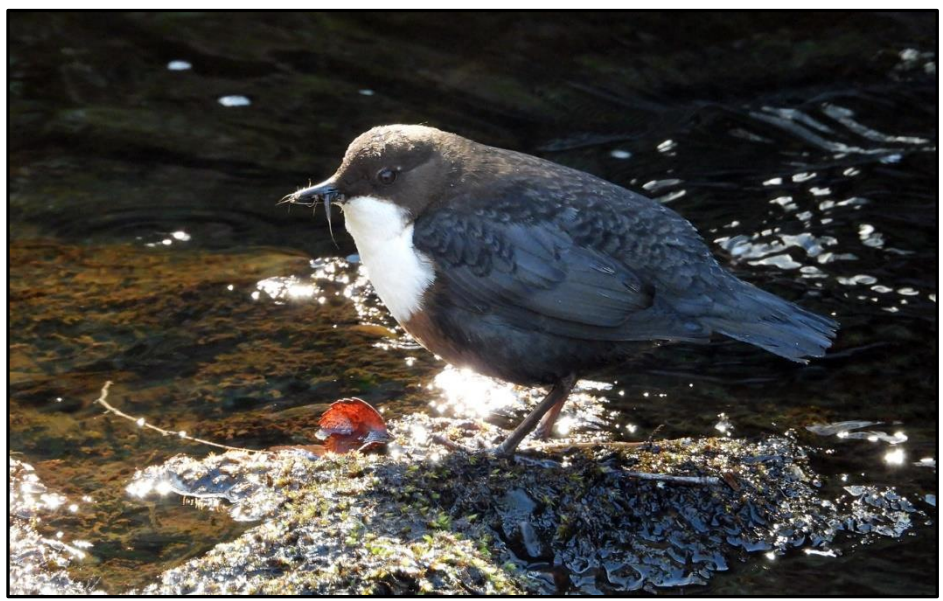
Dipper Mid-Argyll Apr 2020 Jim Dickson

Spring Only 1-3 birds at sites on ( Islay, Kintyre, Mid-Argyll/Tiree ) between 16 Apr - 6 May. Autumn First bird noted on Tiree on 14 Aug and an obvious influx from 27 Aug and 60+ counted across Tiree on 28 Aug, also good numbers in Sep with up to 15 noted from sites across Tiree . A 'significant' passage noted from the N coast of Coll on 30 Sep, however no counts given.