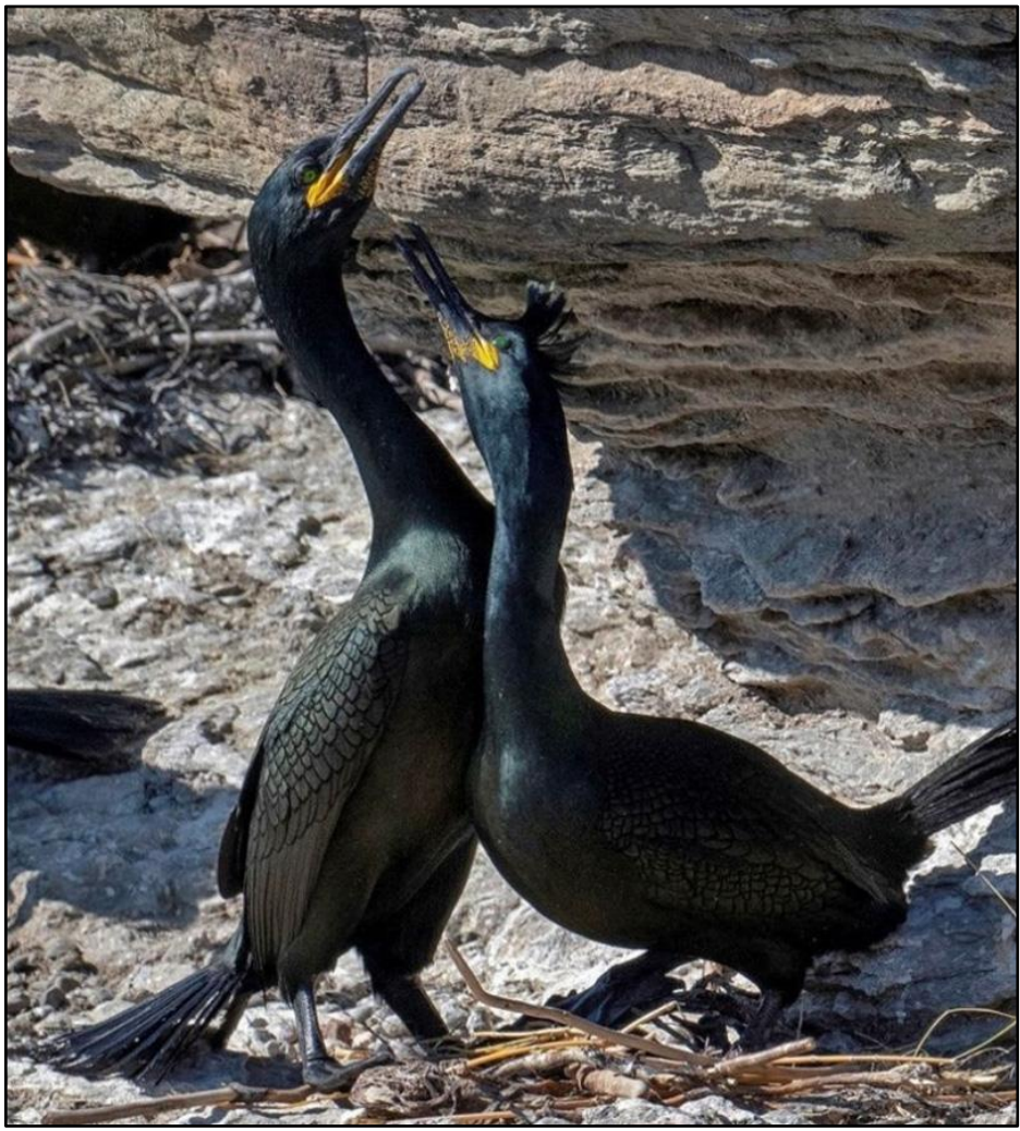
European Shag Kintyre Mar 2020 Eddie Maguire

Autumn/winter Max counts of 568 >W in 1 hr at Aird Tiree on 9 Oct, 510 off Caliach Point Mull on 9 Sep and 250 >W in 1 hr off Frenchman's Rocks Islay on 5 Sep. Overland birds crossing the Laggan Kintyre peaked at 524 in total during Sep. Reports decreased after Oct, although included 208 >SW in 1hr off Hynish Tiree on 11 Nov, and only four reports of 1-2 birds during Dec, all from Tiree .