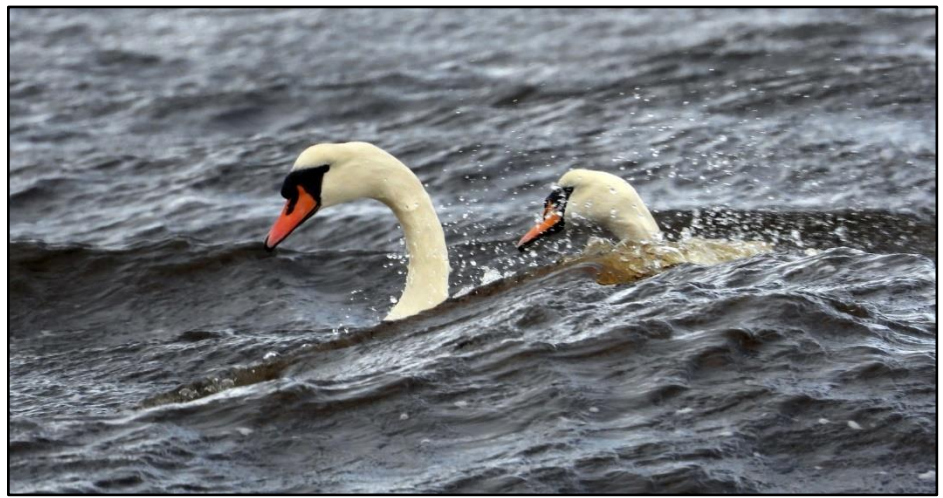
Mute Swans Mid-Argyll Oct 2020 Jim Dickson

Autumn/winter Reports from all areas except (Colonsay/Jura). Max counts of 67 on Tiree on 26 Aug, 27 at Ulva Lagoon Mid-Argyll on 4 Oct, 19 at Loch Gilp Mid-Argyll on 13 Nov, 18 at Loch Skerrols Islay on 27 Oct and 16 at Loch Caithlim, Seil Mid-Argyll on 3 Nov.