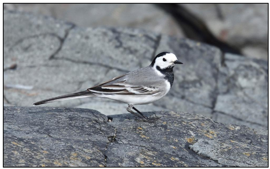
White Wagtail Kintyre Apr 2020

Autumn First report of 2 at Machrihanish SBO Kintyre on 8 Aug where 81 >S in Aug and peak counts of 25 there on 24 Aug and 147 >S in Sep with peak count of 30 there on 18 Sep. Peak counts of 50 at Strath Farm, The Laggan Kintyre on 24 Aug and 26 there on 6 Sep. On Islay a peak count of 20 at Carnain on 5 Sep. On Colonsay 16 were at Traigh nan Barc on 6 Sep. On Tiree 20 at Hynish to Balemartine on 20 Sep and last reports on Tiree and for Argyll of 18 from across 4 sites there on 26 Sep.