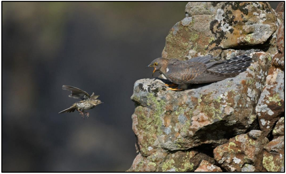
Cuckoo with Meadow Pipit Mull May 2020

Autumn Last report of an adult was on 7 Jul, thereafter several reports of juvs on Mull to 12 Aug, at Croabh Haven Mid-Argyll on 22 Aug and at Vaul Tiree to 24 Aug.