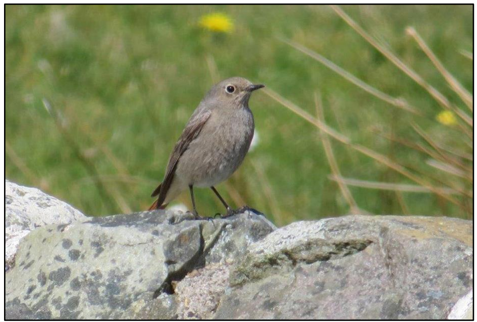
Black Redstart Islay Apr 2020 Bonnie Wood