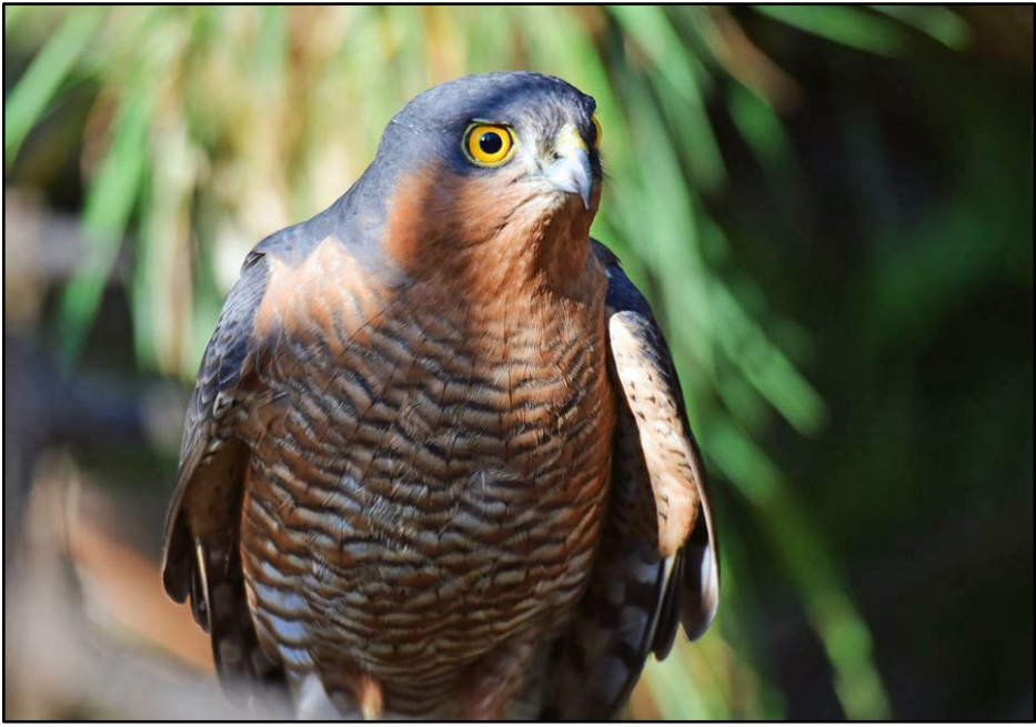
Sparrowhawk Mid-Argyll Apr 2020 Bill Anderson

Breeding Of the 4 sites checked, 2 nests had young from which 8 young fledged (av no of young per nest = 4.00) (ARSG).