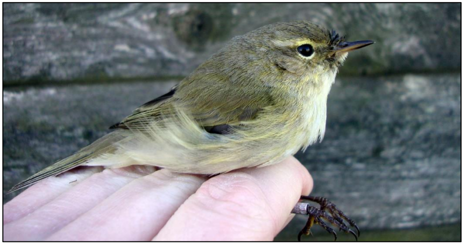
Common Chiffchaff Tiree Mar 2020

Autumn/winter Number of reports decreased during Aug with few reports by end of Sep. Last report was a juv at Balephuil Tiree on 3 Oct. A bird thought to be this species, but unconfirmed, was at RSPB Totronald Coll on 30 Dec.