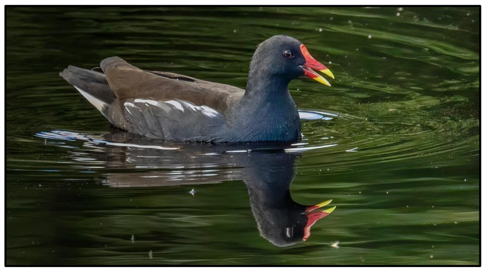
Moorhen Mid-Argyll Sep 2020