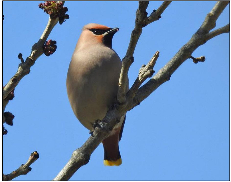
Waxwing Mid-Argyll Apr 2020