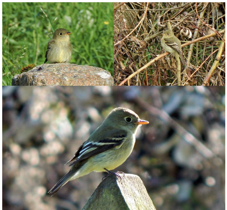
Yellow-bellied Flycatcher Tiree Sep 2020 John Bowler

As a first record for the Western Palearctic this was a major find and attracted a lot of attention from far and wide across the birding world. A well-managed 'twitch' under Covid-19 guidelines ensued and allowed 120+ birders to get amazing views at close range (down to 2 metres!) as it fed on a good supply of flies during its stay. Almost £2,000 was given by visiting birders for Covid -19 related projects on Tiree.