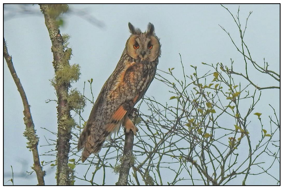
Long-eared Owl Mid-Argyll May 2020