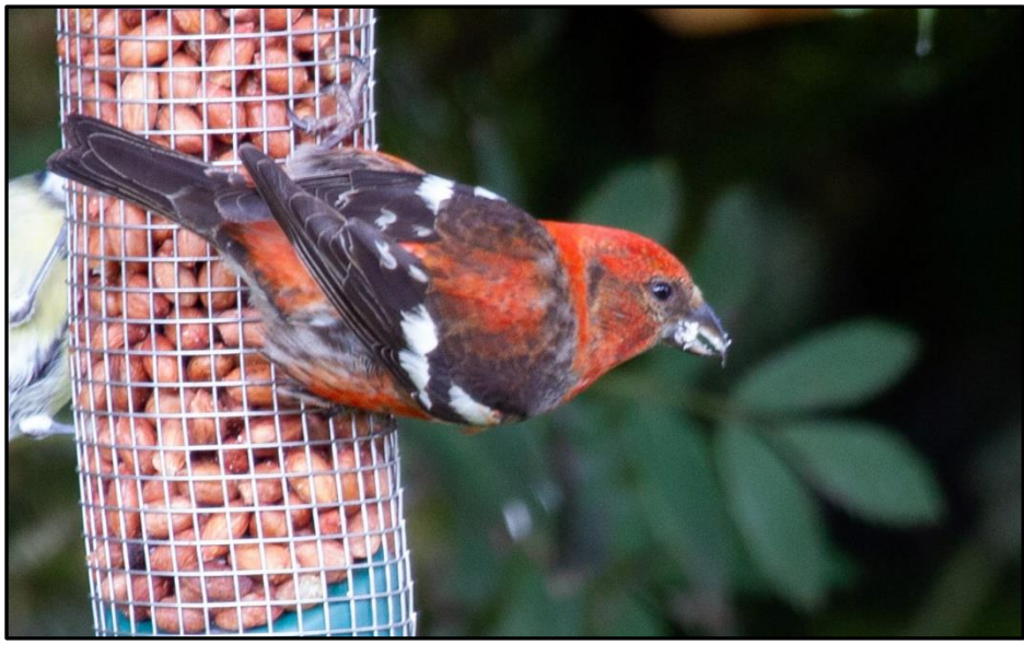
Two-barred Crossbill Mull Aug 2020 Alan Spellman

Autumn/winter Reports from all areas except ( Jura ). Flocks sizes increased from early Aug when 80 at Port Righ Kintyre on 6 Aug and widespread larger flocks during Sep-Oct then fewer reports during Nov-Dec. Max counts included several flocks of 100+ and many flocks of 30-50 counted around the roads of the Rhinns of Islay on 6 Sep, 85 at Ulva Lagoon Mid-Argyll on 12 Sep, 70 at Lossit House Kintyre on 26 Sep, 60 at Killean, Lismore North Argyll on 9 Sep and 60 over central Lochgilphead Mid-Argyll on 20 Oct. On Tiree first single of autumn noted on 8 Sep. Good nos noted during Oct to mid-Nov with a peak count of 32 at Balephetrish on 30 Oct and then single figures from late Nov to the year end.