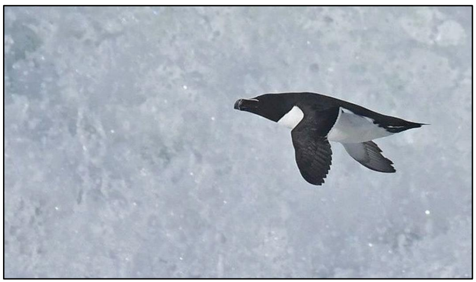
Razorbill Kintyre Mar 2020 Eddie Maguire

Autumn/winter Reports from all coastal areas, with low nos of 1-40 birds. Few reports, and of only 1-7 birds after mid-Oct.