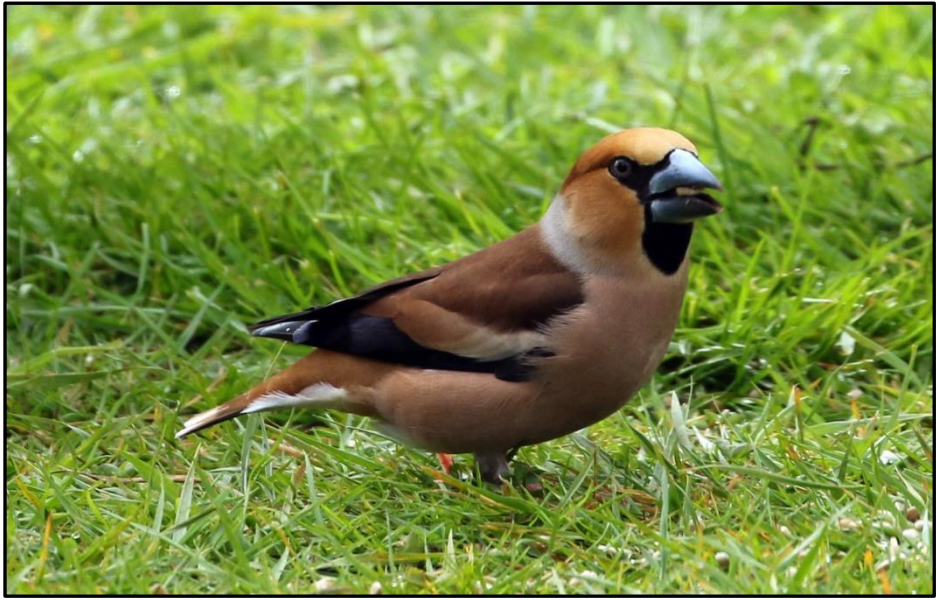
Hawfinch Mull May 2020 Mike Murphy

Autumn/winter Generally low numbers with only 1-3 birds noted at 23 sites. No reports from ( Coll/Colonsay/Cowal/Jura/North Argyll ). First report of 1 at Balephuil Tiree on 3 Oct. Higher counts of 3 birds at Hynish Tiree on 10 Oct, Sunderland Farm Islay on 10 Nov and at Port Righ Kintyre on 16 Nov.