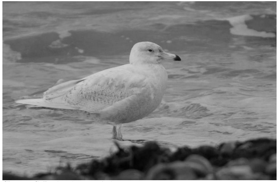
Glaucous Gull Islay (Steve Percival)

GREAT BLACK-BACKED GULL Larus marinus Farspag AMBER LIST A common resident: breeding widely on small islands along the coast.