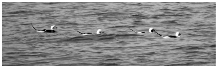
Long-tailed Ducks Kintyre (Jim Dickson)

Winter/spring The numbers reported were lower than in the spring. The first noted was one at Blackrock (Loch Indaal) Islay on 13 Oct, followed by one at Hynish Tiree on 22 Oct and 10 at Rhunahaorine Point Kintyre on 31 Oct. Away from the usual sites, 2 were seen off Kerrera Mid-Argyll on 3 Nov and one was inland on Loch a'Phuill Tiree on 22 Nov – the only freshwater record during year. Numbers increased at Loch Indaal Islay during Nov, with 15 reported on 30 Nov. Small numbers remained around Tiree through until Dec, when one was in Gunna Sound on 8 Dec and 3 were at Balephetrish Bay on 11 Dec.