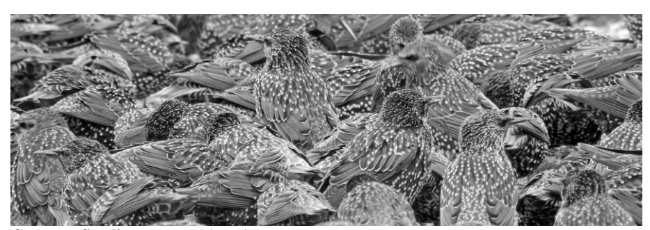
Common Starlings Tiree (Jim Dickson)

Autumn/winter Moderate flocks of up to 100 birds in autumn were recorded from all areas except Coll and Jura . From Aug onwards some substantial flocks built up, probably including migrant birds, with some notable examples: 340 at Oronsay Colonsay on 11 Oct, on Islay 450 at Loch Gorm on 14 Sep and 2,000 at RSPB Loch Gruinart on 17 Nov and in Kintyre 400 were at Machrihanish SBO and 700 at the Laggan during Aug. Numbers on Tiree were substantial too, building up at Ruaig from 500 on 17 Aug to 1,600 on 21 Sep. Tiree numbers remained high through to the end of the year with 1,000 at Loch an Eilein on 8 Dec.