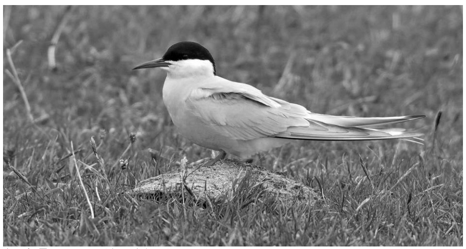
Arctic Tern Tiree (Jim Dickson)

RED LIST A rare migrant; prior to 1980 it occasionally bred in Argyll. The most recent records were from Kintyre in 2005, 2007, 2009 and 2012. No records.