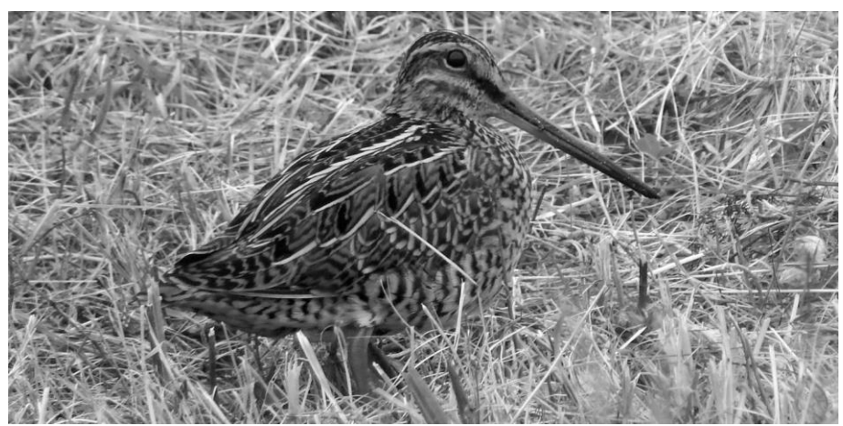
Common Snipe Tiree

Autumn/winter Larger groups and sightings from other regions were reported following the breeding season. 35 were at Kilkenneth Tiree on 29 Aug, 2 at Feolin Jura on 16 Sep, 19 at the Drury Loch (The Laggan) Kintyre on 30 Sep, 40 at Sandaig Tiree on 1 Oct, and 5 at Port Charlotte Islay on 17 Oct. The peak autumn count, 55 at Barrapol Tiree on 21 Oct was lower than that in 2014. Numbers declined thereafter with 30 at Balinoe Tiree on 1 Dec, 3 at Loch Cuin (Dervaig) Mull on 7 Nov, and singles at Caolas Gigalum (Gigha) Kintyre on 19 Dec and at Balvicar (Seil) Mid-Argyll on 22 Dec being the more notable records.