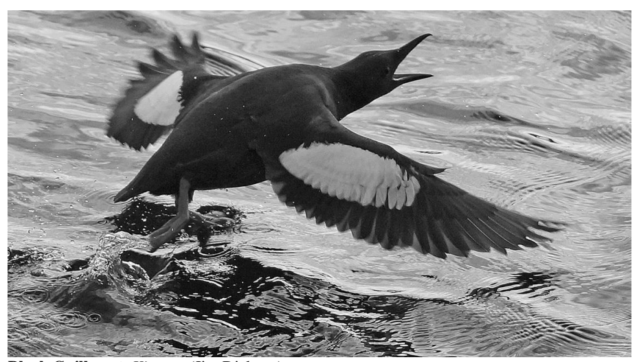
Black Guillemot Kintyre (Jim Dickson)

Autumn/winter Birds were widely distributed along Argyll coasts in small numbers, with few reports of large groups however 14 were at Loch Creran North Argyll on 17 Oct and 52 headed west off Aird Tiree in 2 hrs on 22 Oct.