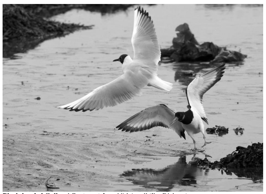
Black-headed Gull and Oystercatcher Mid-Argyll