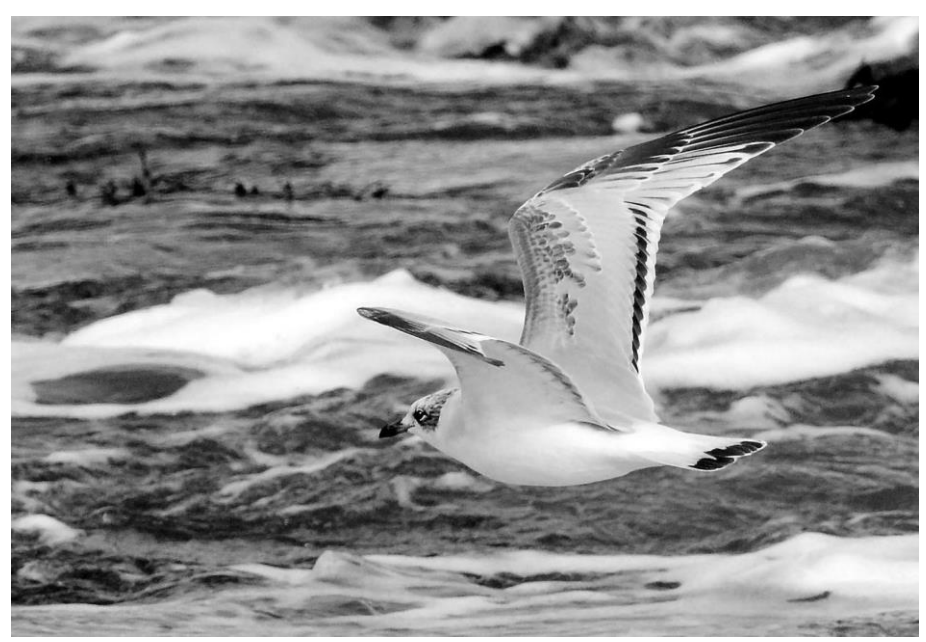
Mediterranean Gull Kintyre

Winter No winter reports, which is unusual.