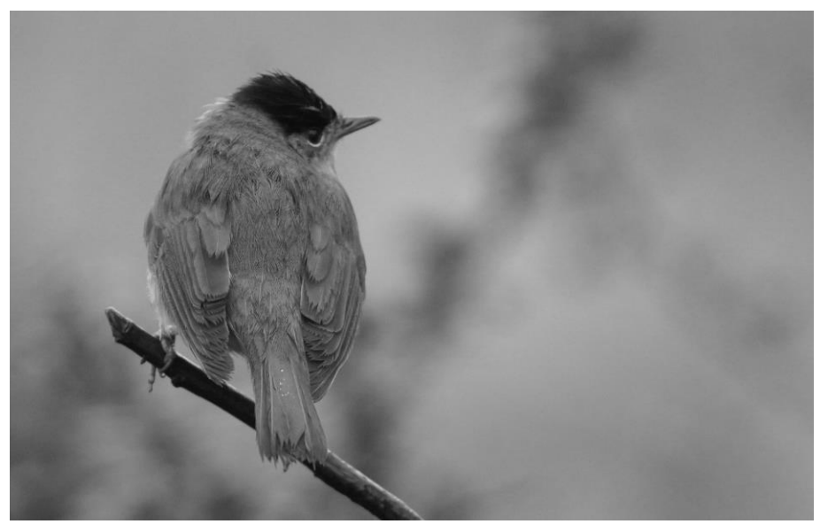
Eurasian Blackcap Mid-Argyll (Jim Dickson)

EURASIAN BLACKCAP Sylvia atricapilla Ceann-dubh