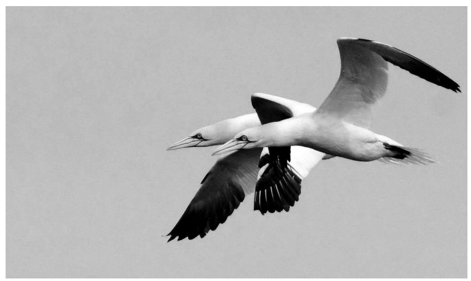
Northern Gannets Kintyre