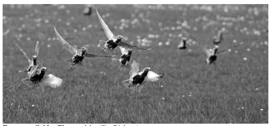
European Golden Plovers Islay (Jim Dickson)