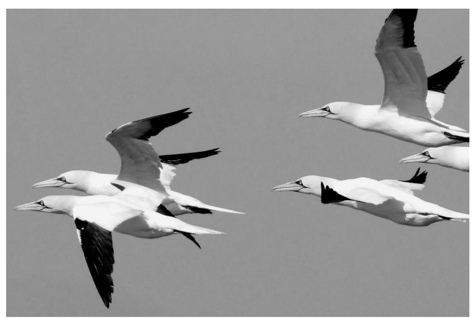
Northern Gannets Kintyre (Eddie Maguire) showing full 'bellies' (see discussion)

e.g. on 15th October CR contacted MSBO from Campbeltown Harbour at 11:24hrs and announced that an adult Gannet had just set off for the west high over the town. MSBO wardens located this individual arriving over the sand dunes at Machrihanish Bay at 11:33hrs. This bird had taken around 9 minutes to fly 8km west over the Kintyre peninsula. Gannets certainly lose height during the crossing although many can still be >150m ASL when they arrive over the bay.