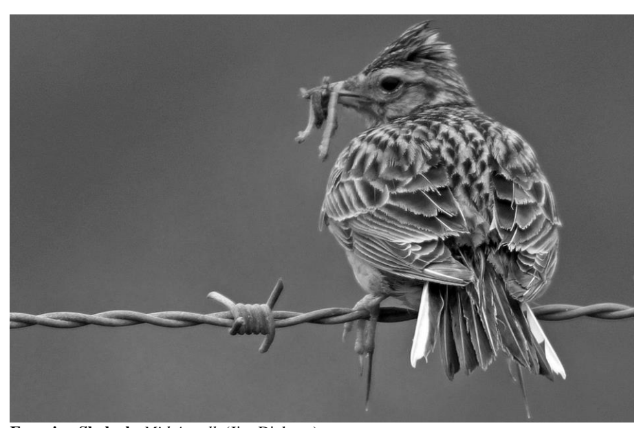
Eurasian Skylark Mid-Argyll (Jim Dickson)

RED LIST A vagrant: one record; near Water of Tulla, North Argyll on 1 Jun 1991. No records.