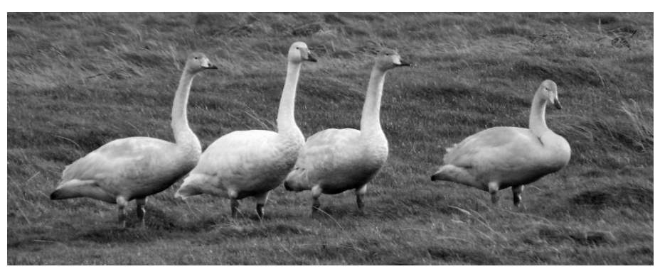
Whooper Swans Tiree