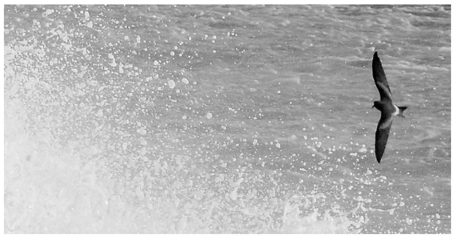
Leach's Storm Petrel Kintyre

Autumn Small numbers were reported from seawatching from Coll and Tiree . The last record was 20 northwest of Tiree on 10 Sep.