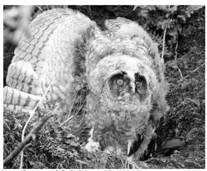
Young Long-eared Owl Colonsay

LITTLE GULL A near adult (third-winter) and an adult were at Loch Gilp, Mid-Argyll from 6 Dec and seen infrequently until February 2016. SNOW BUNTING One was at Gott tip, Tiree on 9 Dec. GREEN-WINGED TEAL A drake was at the RSPB Loch Gruinart, Islay from 14 Dec and remained throughout the winter period. BOHEMIAN WAXWING Seven were in Bowmore, Islay on 22 Dec. AMERICAN WIGEON On Islay the drake (first seen at Ardnave Loch on 12 Sep) was reported again at the RSPB Loch Gruinart on 24 Dec.