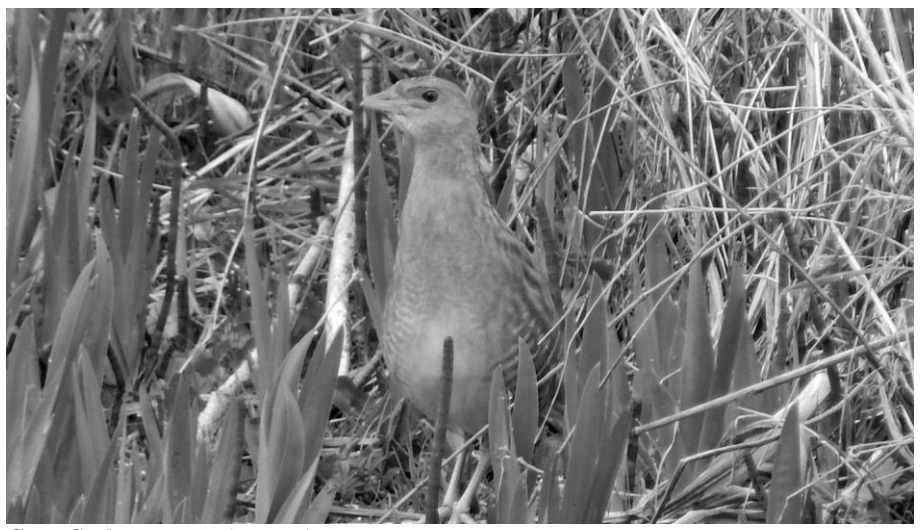
Corn Crake Tiree (John Bowler)

Spring/summer After a good year in 2014 when 4 birds were recorded, no Spotted Crakes were recorded in Argyll in 2015.