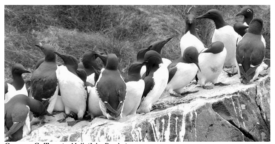
Common Guillemots Mull

A scarce and irregular winter visitor: usually seen during sea-watches or after severe gales. Winter One off Duart Castle Mull on 13 Mar was possibly ill as it was nearly run over by the ferry. One was reported the same day at Killean (Lismore) North Argyll. Six flew past Aird Tiree in 1 hr on 26 Mar. One was in Oban Harbour Mid-Argyll on 19 Dec.