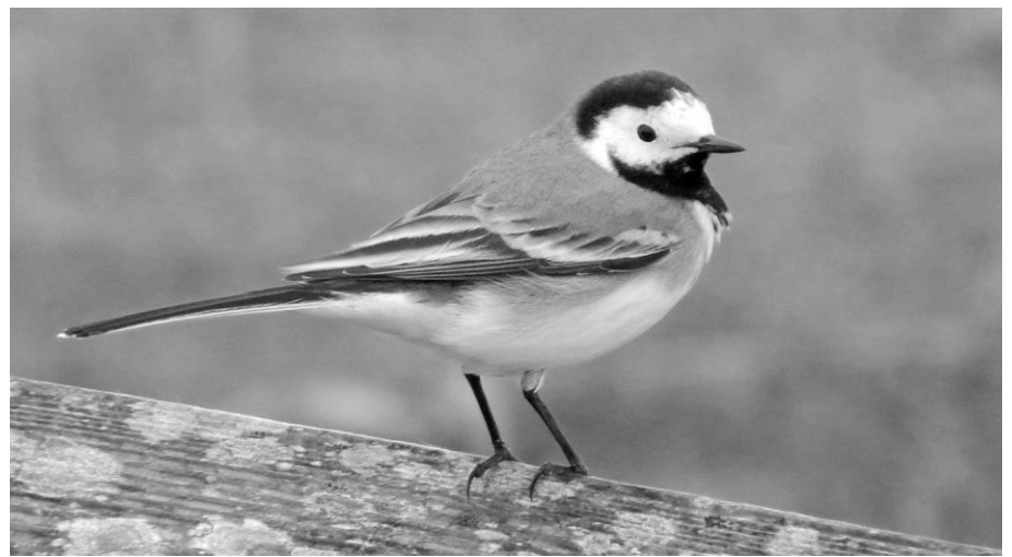
'White' Wagtail Tiree (John Bowler)

Autumn/winter Recorded in all areas except Jura. There were some large passage gatherings from Aug through to Sep: 37 at RSPB Loch Gruinart Islay on 21 Aug, 20 at Meningie Tiree on 27 Aug, 36 at Calgary Mull on 30 Aug, 30 at Machir Bay Islay on 7 Sep, at least 12 roosting on one boat in Dunstaffnage Bay Mid-Argyll on 8 Sep with more on other boats, 35 at Drimvore Mid-Argyll on 10 Sep, 35 at Otter Ferry Cowal on 23 Sep, and 60 coming to roost at the waterworks at Loch a'Phuill Tiree on 25 Sep. Numbers declined during Oct and, after 16 at Loch Gorm Islay on 2 Nov, only single figure reports were received.