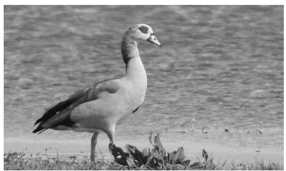
Egyptian Goose Kintyre (Eddie Maguire)

During early March 2015, I made occasional visits to flood pools on grassland at Strath Farm, The Laggan in South Kintyre, Argyll. By mid-April, one of the floods, the east pool (NR 683197), developed into a significant marsh-like habitat with a classic muddy margin that had obvious potential to attract a variety of migrant waders and other wetland species. This prompted twice-daily visits to the area.