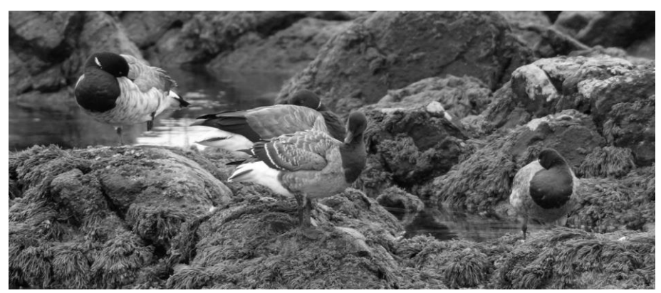
Pale-bellied Brent Geese Tiree