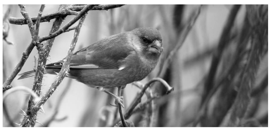
European Greenfinch Mid-Argyll (Jim Dickson)

Autumn/winter Reported present in all areas except Coll , mainly in single figures. Only a few post-breeding flocks of note (with 10 or more) included 22 at Kintallen (Tayvallich) Mid-Argyll on 4 Aug, 12 at Kinnabus (The Oa) Islay on 18 Oct, 20 at RSPB Aoradh Islay on 17 Nov, and 11 at Achnacroish (Lismore) North Argyll on 28 Nov. 9 were caught and ringed at Machrihanish SBO Kintyre over the autumn.