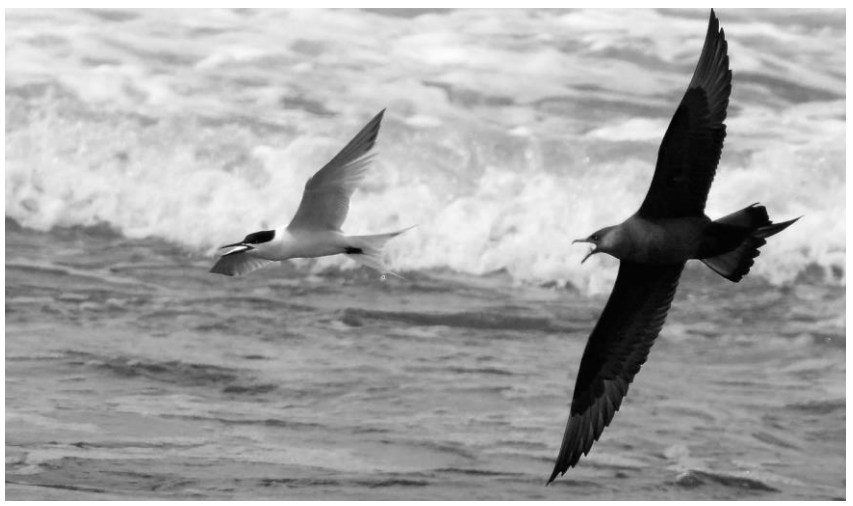
Sandwich Tern pursued by an Arctic Skua Kintyre (Eddie Maguire)

Autumn Small numbers were seen off Mull, Islay, Kintyre, North Argyll, Coll, but especially Tiree in Aug-Oct. Most autumn records were during Aug, but the peak count was 10 birds off Aird Tiree in 2 hrs on 22 Oct. About half of the birds seen in autumn where colour phase was reported were dark birds, so likely to originate from relatively local, at least low latitude, breeding areas. The last record of the autumn was of a juvenile off Coll on 29 Oct.