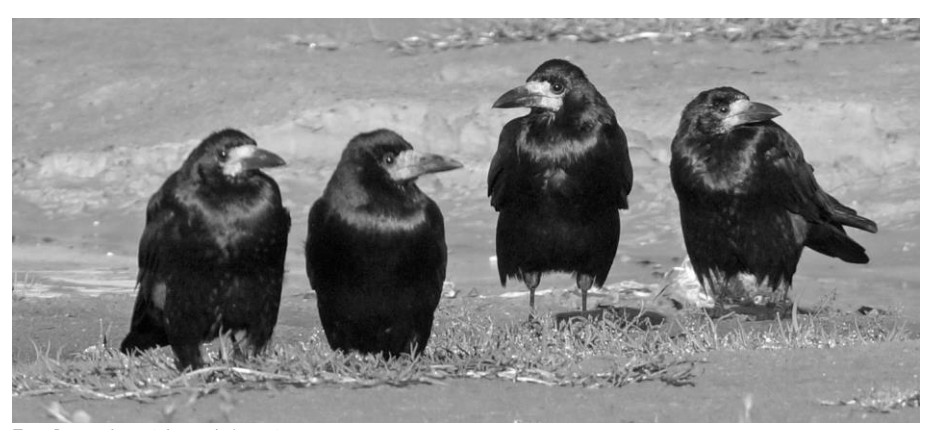
Rooks Islay (Jim Dickson)

Autumn/winter On Colonsay 20 were at Uragaig on 26 Sep; in Cowal highest count of 10 at Innellan on 28 Dec; on Islay highest counts were of 150 at Kilchoman on 13 Aug, 14 at The Oa on 27 Oct, 20 at Esknish on 16 Nov and 30 at RSPB Gruinart reserve on 18 Nov; in Kintyre noted as 'present' at 2 sites in Sep; in Mid-Argyll noted as 'present' at 4 sites; on Mull highest counts of 54 at Caliach Point on 12 Oct and 23 at Ensay Burn mouth on 13 Oct; in North Argyll noted as 'present' at North Ledaig on 10 Sep.