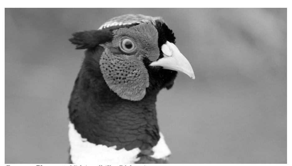
Common Pheasant Mid-Argyll

Large numbers were widely reported on Islay throughout the year, including 20 at Loch a' Gheoidh (Sunderland) on 18 Nov. 12 were at Loch nam Breac Jura on 5 Mar and smaller numbers were widely reported from Colonsay , Cowal , Mid-Argyll , Mull and Tiree . Breeding was confirmed on Islay and Colonsay .