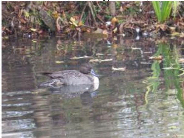
Pintail – near Bellanoch, Mid-Argyll 17 Oct.