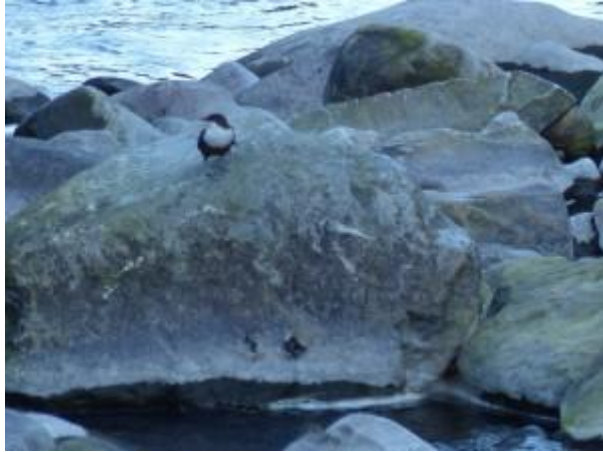
Dipper – River Corran, Jura 17 Oct (Mike Peacock).

Exceptional weather for the WeBS Count at Loch Sween, Mid-Argyll today: birds found included a total of 17 Little Grebes and 34 Mute Swans , 10 Whooper Swans and 137 Greater Canada Geese at Ulva Lagoons (Paul Daw).