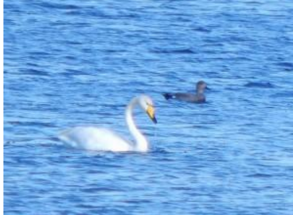
Gadwall with Whooper Swan – Loch an Eilein, Tiree 06 Oct (John Bowler).

bellied Brent Geese at Sorobaidh Bay; 8 Whooper Swans and a Black-tailed Godwit at Loch a' Phuill; 37 Whooper Swans and single Gadwall and Pintail at Loch an Eilein; one Goldcrest , 6 Barn Swallows , 1 Common Chiffchaff , 1 Willow Warbler , 4 Blackcaps , 4 Redwings , 2 Common Chaffinches , a Brambling , 45 Goldfinches and 7 Common Redpolls at Balephuill and a Common Chaffinch and a Northern Wheatear at the Glebe (John Bowler). Two Northern Gannets heading down the Clyde from Loch Long, Cowal and one sub-adult heading up Loch Long: also three Common Guillemots (George Newall).