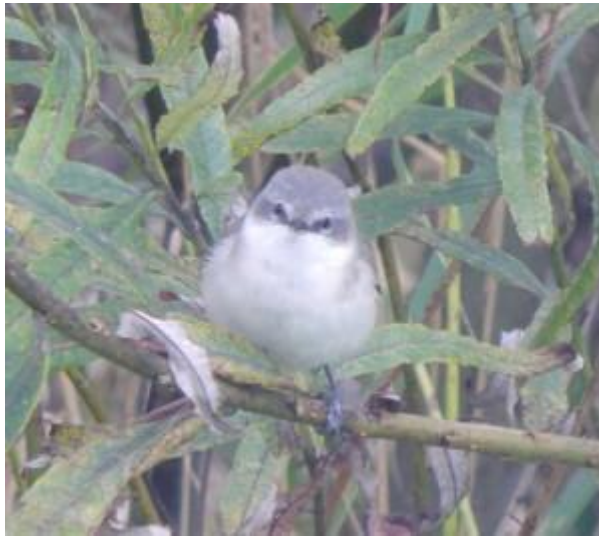
Lesser Whitethroat – Balephuill, Tiree 03 Oct (John Bowler).

02 October: On Tiree today, a juvenile Baird's Sandpiper at Sorobaidh Bay this afternoon was presumable the Hough Bay bird: 9 Pale-bellied Brent Geese were also there. At Balephuill: 2 Willow Warblers , a Common Chiffchaff , 2male/3 female Blackcaps , 3 newly arrived Bramblings , 6 Lesser Redpolls and up to 12 Common Redpolls . Also, 8 Whooper Swans and 2 Ruffs at Loch an Eilein; 5 Whooper Swans , a Gadwall , 210 Teal , 4 Pintail and a Black-tailed Godwit at Loch a' Phuill; a Common Chiffchaff and a Grey Wagtail at The Glebe; a Common Chiffchaff at An Airidh; 6 Goldfinches at Balemartine, 16 more Goldfinches at West Hynish and 25-30 more at Vaul. (John Bowler/Jim Dickson). An Autumn Green Carpet and Turnip Moth new for Tiree in the moth-trap last night (John Bowler).