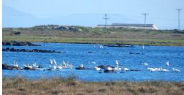
Whooper Swans – Loch an Eilein, Tiree 12 Oct (John Bowler).

On Tiree today: 2 Grey Phalaropes headed west off Upper Vault in a big movement down the Minch of 87 Northern Gannets , 1,060 Kittiwakes and 720 large auks in an hour; 18 Whooper Swans headed south over The Reef in 3 groups this morning in 1 hour; 82 Whooper Swans at Loch an Eilein; 11 Whooper Swans at Loch Riaghain; 18 Whooper Swans , 7 Pintail and 55 Tufted Duck at Loch a' Phuill; one Common Chiffchaff at The Glebe and 2 Goldcrests , 4 Barn Swallows , 2 Common Chiffchaffs , 3 Redwings and 7 Common Redpolls at Balephuill (John Bowler).