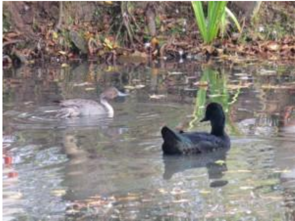
Pintail – near Bellanoch, Mid-Argyll 17 Oct.

This male Pintail that turned up on a pond near Bellanoch, Mid-Argyll looks like a first winter bird. It's been coming with Mallards for the past few days.