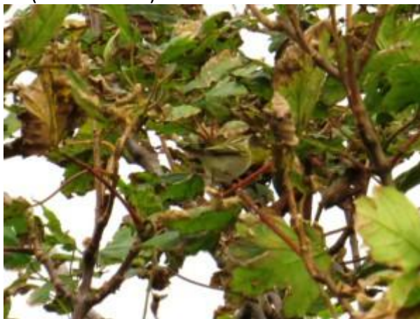
Yellow-browed Warbler – Kinnabus, Islay 14 Oct (David Wood).

A Yellow-browed Warbler was at Kinnabus, Islay today, as well as a Grey Wagtail and the first Great Tit of the year! (David Wood).