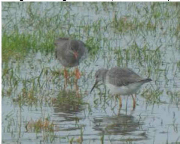
Lesser Yellowlegs – Corraig Crossroads, Tiree 21 Oct (John Bowler).