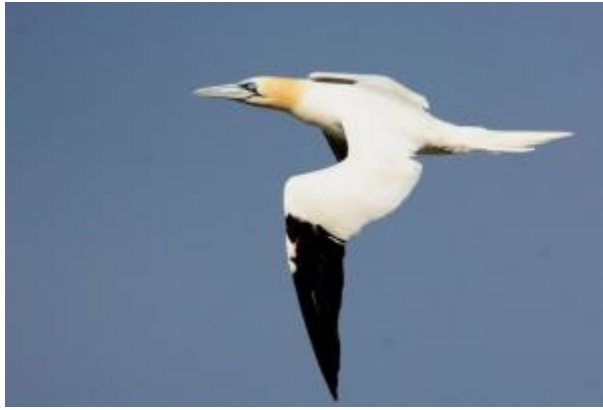
Northern Gannet – MSBO, Kintyre 22 Oct.