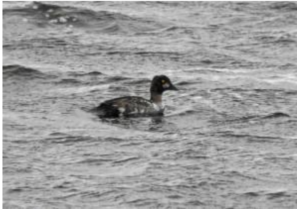
male Common Goldeneye – Add Estuary, Mid-Argyll 22 Oct.