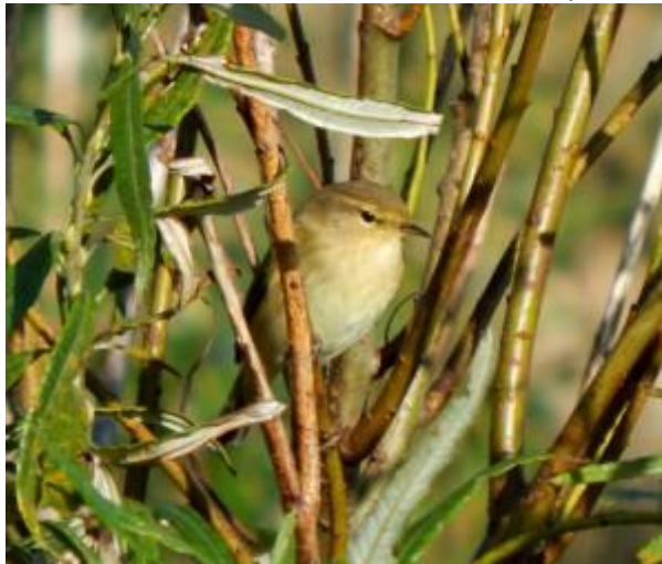
Common Chiffchaff – The Glebe, Tiree 12 Oct.