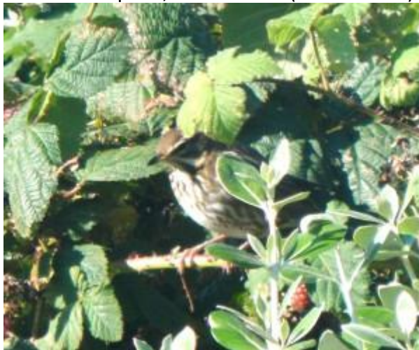
Redwing – Balephuill, Tiree 07 Oct (John Bowler).

06 October: On Tiree today: 13 Whooper Swans flying south over Balephuill at 08:30 hrs with another 12 south there at 11:15; 12 Pale-bellied Brent Geese at West Hynish; 4 Pale-