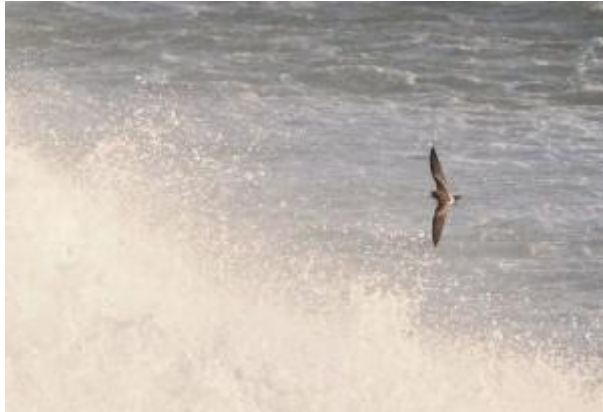
Leach's Storm-petrel – over a 'provocative' sea at MSBO 22 Oct.