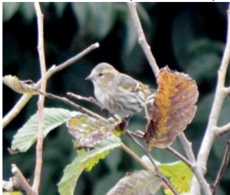
Siskin – Balephuill, Tiree 03 Oct (John Bowler).

03 October: On Tiree: no sign of the Baird's Sandpiper at Sorobaidh Bay this morning – just the 9 Pale-bellied Brent Geese there. Elsewhere, a Lesser Whitethroat and a Siskin were new arrivals at Balephuill together with 2 Goldcrests , 2 Willow Warblers , 6 Blackcaps , 6 Lesser Redpolls and 12 Common Redpolls ; 3 Common Chiffchaffs at Sorobaidh Bay creek and a single Common Chiffchaff at Balemartine (John Bowler).