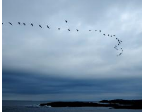
Barnacle Geese off Tiree 11 Oct.