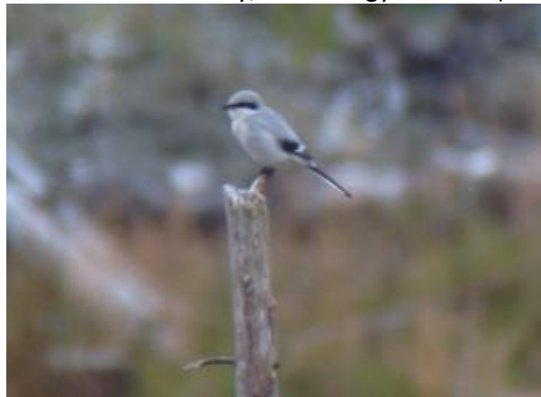
Great Grey Shrike – near Dalmally, North Argyll 20 Oct (Andy Robinson).