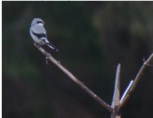
Great Grey Shrike – near Dalmally, North Argyll 20 Oct (Andy Robinson).

20 October: A Great Grey Shrike was found sometime after 14:30 today near Dalmally, North Argyll at NN 145 263 (Andy Robinson). Great Grey Shrikes are very scarce visitors to Argyll, with only five records in the past 20 years.