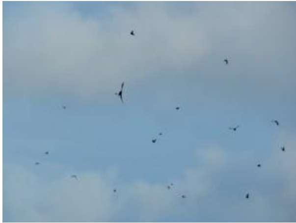
Redwings dropping from the sky – Balephuill, Tiree 24 Oct (John Bowler).

23 October: The Great Grey Shrike is still in the same area nr. Dalmally, North Argyll where it was found on Tuesday (20 Oct). Seen by Simon Pinder around 13:00 onward and still in the area when Jim left about 14:30. Generally 2-300metres away and no closer than about 80 metres. It could go missing for spells of 10 minutes or so....presumably lost in dead ground amongst tree stumps (Jim Dickson/ Simon Pinder).