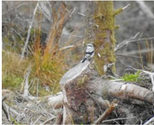
Great Grey Shrike near Dalmally, North Argyll 23 Oct.

Today at Loch Gilp, Mid-Argyll: ca 160 Wigeon, 2 Red Knot, 13 Dunlin and 24 Bar-tailed Godwits. Wigeon numbers seemed higher at Add estuary with ca 280 and an adult male Hen Harrier was also there.