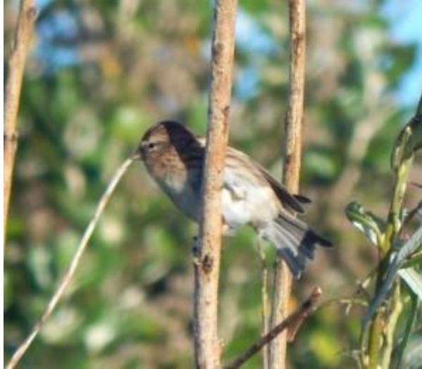
Common Redpoll – Balephuill, Tiree 07 Oct (John Bowler).

45 Goldfinches , 5 Common Chaffinches and 7 Common Redpolls . Also 7 Pale-bellied Brent Geese at Sorobaidh Bay and a Blackcap at Melness, Cornaigbeg (John Bowler).