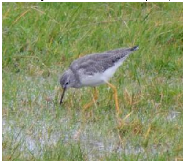
Lesser Yellowlegs – Corraig Crossroads, Tiree 21 Oct.