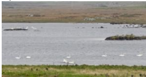
Whooper Swans – Loch an Eilein, Tiree 05 Oct (John Bowler).

05 October: The first 4 Barnacle Geese were back on Tiree, at Ruaig, today. Elsewhere on Tiree: 41 Whooper Swans at Loch an Eilein and 22 more at Loch a' Phuill; 23 Barn Swallows at Ruaig; Northern Wheatears at Kilkenneth and Ruaig; a Canada Goose at Baugh; 30 Goldfinches at Balephuill and 80 Rock Doves feeding on traditional corn stooks at Whitehouse (John Bowler).