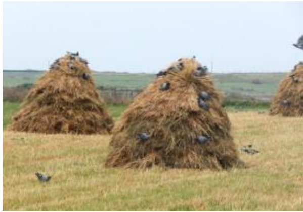
Rock Doves – Whitehouse, Tiree 05 Oct.

04 October: The flock of Greater Canada Goose at Port Appin, North Argyll was at least 120 strong this morning; it seems to get bigger every year. No sign of any other geese yet round the peninsula, but two very noisy Ravens overhead (Mike Anderson).