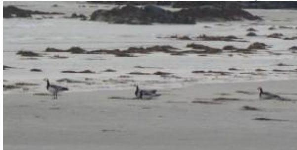
Barnacle Geese – Ruaig, Tiree 05 Oct.