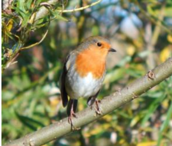
Robin – Balephuill, Tiree 07 Oct.