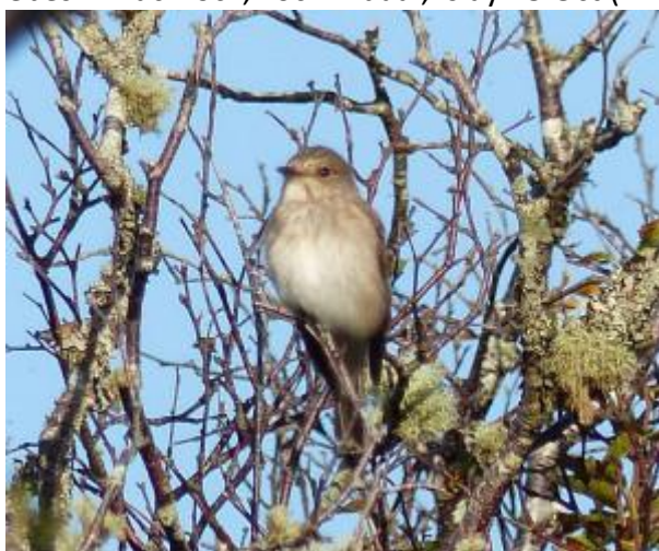
Spotted Flycatcher – Gortantaoid Islay 13 Oct (Mike Peacock).

The first Greenland White-fronted Geese (9) and Whooper Swans (13) appeared at the Oa, Islay today (David Wood).