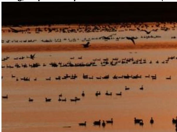
Barnacle Geese – Gruinart Flats, Islay 13 Oct (Mike Peacock).

Grebes at Blackrock, Loch Indaal and at Gortantaoid – 2 Hen Harriers , a Sparrowhawk , a Common Kestrel , a Redwing , a Spotted Flycatcher and 23 Twite (Mike Peacock).