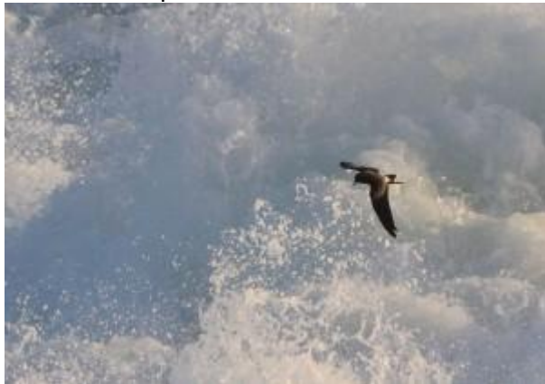
Leach's Storm-petrel – over a 'provocative' sea at MSBO 22 Oct (Eddie Maguire).

Quieter at the Add Estuary with a single male Common Goldeneye along with a slight increase in Wigeon numbers to 292 birds (Jim Dickson).