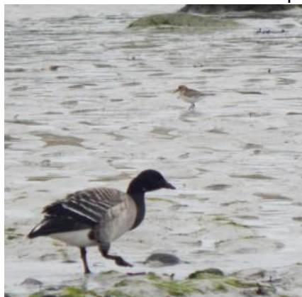
Juv. Baird's Sandpiper (with P-b. Brent Goose) – Sorobaidh Bay, Tiree 02 Oct (John Bowler).

02 October: On Tiree today, a juvenile Baird's Sandpiper at Sorobaidh Bay this afternoon was presumable the Hough Bay bird: 9 Pale-bellied Brent Geese were also there. At Balephuill: 2 Willow Warblers , a Common Chiffchaff , 2male/3 female Blackcaps , 3 newly arrived Bramblings , 6 Lesser Redpolls and up to 12 Common Redpolls . Also, 8 Whooper Swans and 2 Ruffs at Loch an Eilein; 5 Whooper Swans , a Gadwall , 210 Teal , 4 Pintail and a Black-tailed Godwit at Loch a' Phuill; a Common Chiffchaff and a Grey Wagtail at The Glebe; a Common Chiffchaff at An Airidh; 6 Goldfinches at Balemartine, 16 more Goldfinches at West Hynish and 25-30 more at Vaul. (John Bowler/Jim Dickson). An Autumn Green Carpet and Turnip Moth new for Tiree in the moth-trap last night (John Bowler).