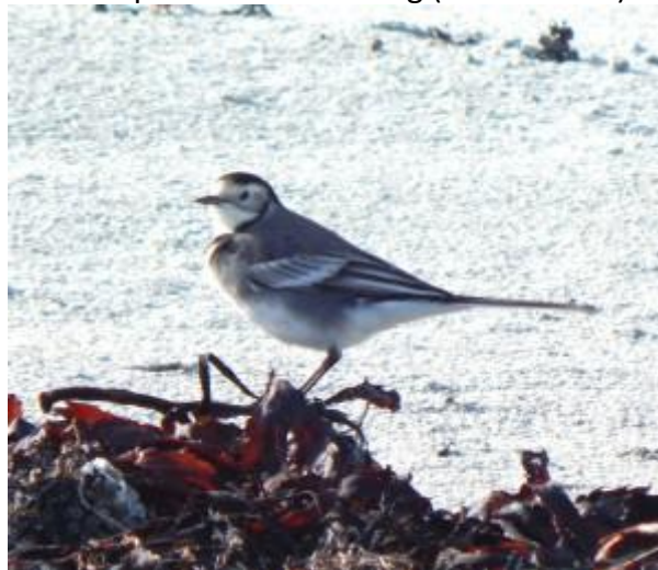
White Wagtail – Balemartine, Tiree 24 Oct (John Bowler).

Elsewhere on Tiree: the juvenile Lesser Yellowlegs relocated briefly with 6 Common Redshank on roadside pool near Heylipol Church at 14:10hrs before all flushed off towards Loch a' Phuill; drake American Wigeon again at Loch a' Phuill with 3 Common Goldeneyes ; 15 Common Scoter headed south off Sandaig; 1 Snow Bunting and 3 Lesser Redpolls at Scarinish (Toby Green); 1 Common Chiffchaff at Sorobaidh Bay creek; 1 White Wagtail at Balemartine; 1 Greenland Wheatear at West Hynish and a Common Chiffchaff , 12 Redwing and 2 Common Redpolls at Balephuill in the morning (John Bowler).