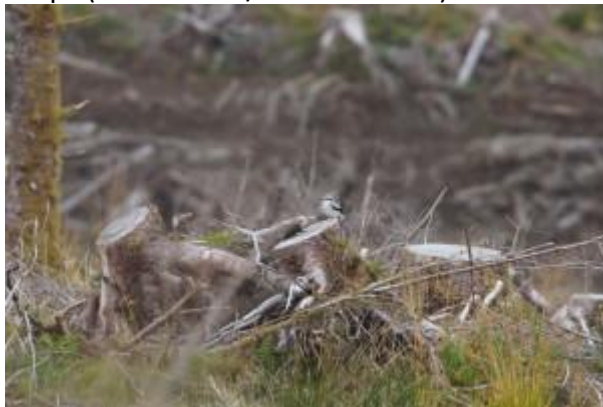
Great Grey Shrike near Dalmally, North Argyll 23 Oct (Jim Dickson).

23 October: The Great Grey Shrike is still in the same area nr. Dalmally, North Argyll where it was found on Tuesday (20 Oct). Seen by Simon Pinder around 13:00 onward and still in the area when Jim left about 14:30. Generally 2-300metres away and no closer than about 80 metres. It could go missing for spells of 10 minutes or so....presumably lost in dead ground amongst tree stumps (Jim Dickson/ Simon Pinder).