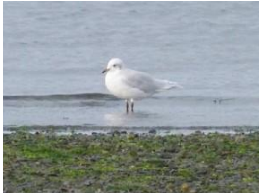
Mediterranean Gull – Blackmill Bay, Luing, Mid-Argyll 10 Oct (David Jardine).

10 October: The Polish ringed Mediterranean Gull (see Recent Reports 18 Sep for details) was back at Blackmill Bay, Luing today.