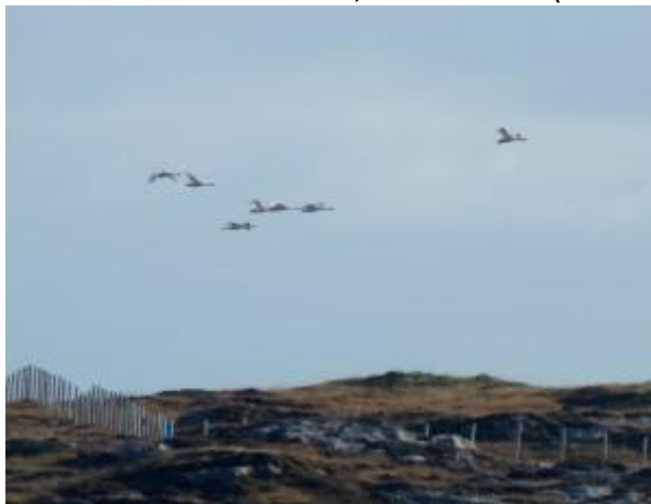
Whooper Swans – The Reef, Tiree 12 Oct (John Bowler).

11 October: On Tiree today: 550+ Barnacle Geese south off the Minch 14:00-15:30hrs in groups of up to 120 heading to Islay. Elsewhere, 1 Great Skua off The Ringing Stone plus 42