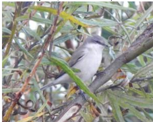
Lesser Whitethroat – Balephuill, Tiree 03 Oct (John Bowler).