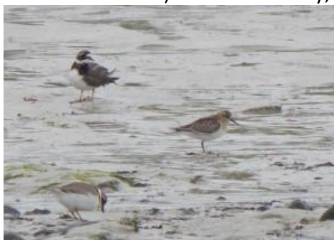
Juv. Baird's Sandpiper – Sorobaidh Bay, Tiree 02 Oct.