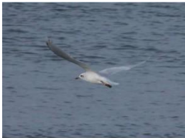
Mediterranean Gull – Blackmill Bay, Luing, Mid-Argyll 10 Oct.