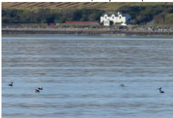
Slavonian Grebes – Blackrock, Loch Indaal, Islay 13 Oct (Mike Peacock).