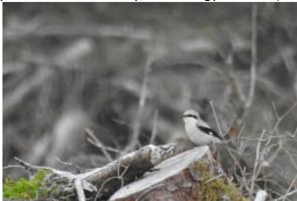
Great Grey Shrike near Dalmally, North Argyll 23 Oct (Jim Dickson).