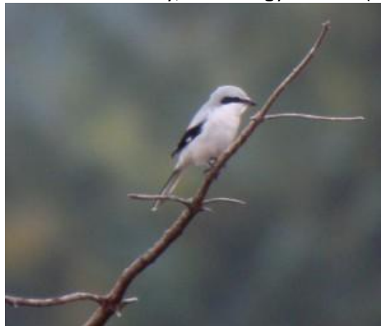
Great Grey Shrike – near Dalmally, North Argyll 20 Oct (Andy Robinson).