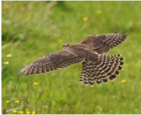
Female Merlin – Islay 17 Sep.