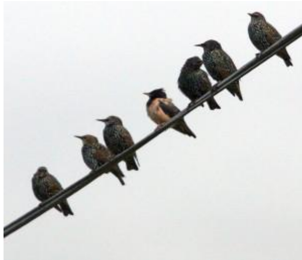
Rose-coloured Starling – nr. Machir Bay, Islay 16 Sep (Jim Dickson).

A Rose-coloured Starling was with starling flocks around Coastguard cottages before road down to Machir Bay, Islay this afternoon. Also on Islay today: on Loch Indaal, off Uiskentuie: 53 Common Scoter , one Great Northern Diver , 9 Red-throated Divers and 11 Slavonian Grebes ; a Common Sandpiper at Bruichladdich and the American Wigeon still at Ardnave Loch (Jim Dickson).