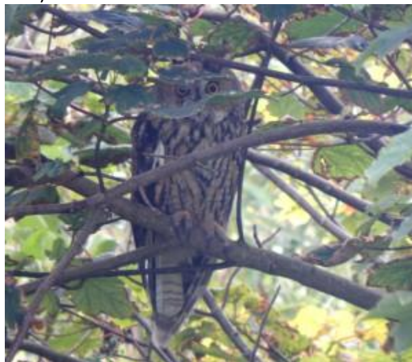
Long-eared Owl – Balephuill, Tiree 18 Sep (John Bowler).

18 September: On Tiree, there was no sign of the Yellow-browed Warbler at Balephuill today but a Long-eared Owl appeared briefly there this morning. Also present there were: 3 Goldcrests , a singing Common Chiffchaff , 4 Willow Warblers , 2 Sedge Warblers , 3 Robins , a Dunnock and 6 Common Redpolls . The adult White-tailed Eagle was on NE side of Loch a' Phuill this afternoon again; also a Ruff and a Black-tailed Godwit at Baugh and a Ruff at Loch an Eilein (John Bowler).