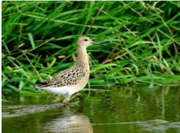
Ruff - Strath farm, The Laggan, Campbeltown 08 Sep (Eddie Maguire).

Strath Farm east pool (The Laggan), Kintyre is back in prime marsh condition after flooding too much last month and 4 Ruff arrived there today (Eddie Maguire).