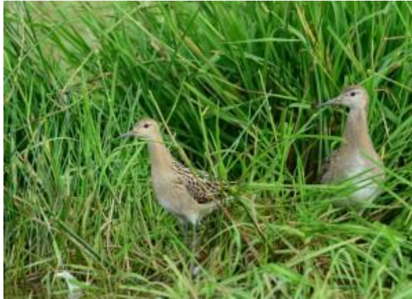
Ruff - Strath farm, The Laggan, Campbeltown 08 Sep (Eddie Maguire).

07 September: On Tiree today: the first winter Barred Warbler was finally showing well this evening at Balephuill along with 3 Sedge Warblers and 2 House Martins . Also, two Red-throated Divers , 3 juvenile Knot and 20 Bar-tailed Godwits at Gott Bay; a Ruff and 20 Black-tailed Godwits at Miodar; 4 Ruffs and 3 Black-tailed Godwits at Balevullin and at least 1 White Wagtail with at least 20 Pied Wagtails at Loch a' Phuill (John Bowler). A Pied Flycatcher and a Grey Wagtail were on the Oa at Kinnabus, Islay today (David Wood).