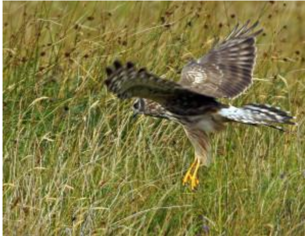
Hen Harrier Barrapol, Tiree 25 Sept