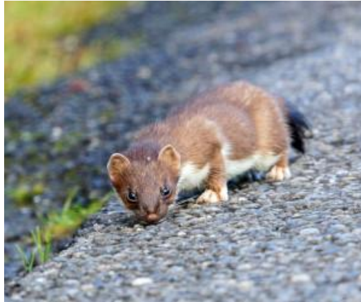
Stoat - north of Port Ellen, Islay 18 Sep (Jim Dickson).

Caught on camera : a Stoat on a side road north of Port Ellen (Jim Dickson with Bill Allan).