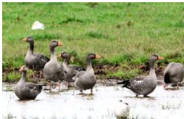
Greylag Geese - Strath farm, The Laggan, Campbeltown 09 Sep (Eddie Maguire).

Strath Farm east pool (The Laggan), Kintyre. The 4 Ruff were still present this morning but only 2 there late afternoon. A further influx of Greylag Geese : total at the pool now 220. (Eddie Maguire).