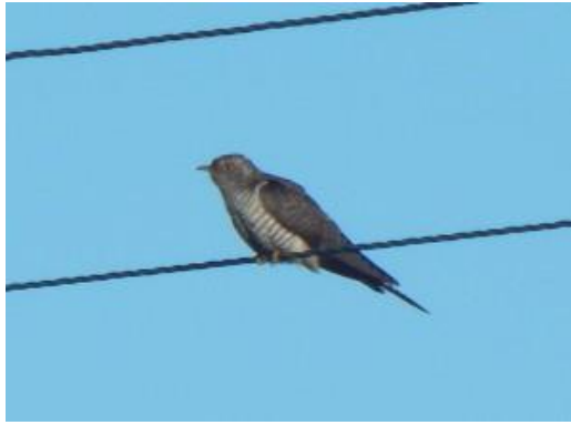
Common Cuckoo – Balephuill, Tiree 19 Sep.