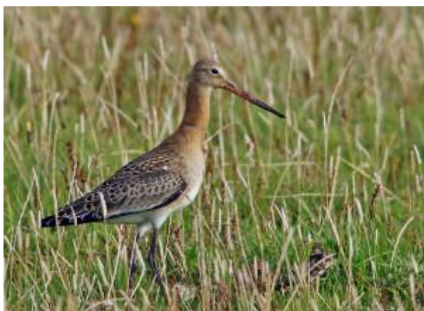
Black-tailed Godwit Balevullin, Tiree 27 Sept ( Jim Dickson).

26 September: On Tiree: 1 Lapland Bunting south over Barrapol, 1 Chiffchaff and 1 Sedge Warbler at Sorobaidh Bay creek, 5 Pale-bellied Brent Geese at Sorobaidh Bay plus 9 Bar-tailed Godwits there, 1 Chiffchaff at West Hynish, 5 Willow Warblers , 1 f Blackcap , 1 Dunnock , 2 Goldcrest and 9 Redpolls at Balephuill, 1 Ruff and 2 Moorhen at Sandaig (John Bowler). Two Ruff and 1 Black-tailed Godwit at Scarinish (Jim Dickson). On Colonsay: Grey Plover with 76 Golden Plover Traigh nam Barc, 1 Barnacle Goose (with Canada Geese) Lochan Bhreac, Garvard, 1Y Brent Goose , Seal Cottage, Oronsay, 4+ Shoveler , South Oronsay ponds, 1Y Brent Goose Kiloran Bay, 1 Grey Wagtail Scalasaig (David Jardine).