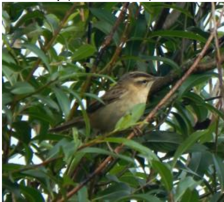
Sedge Warbler – Balephuill, Tiree 17 Sep (John Bowler).

On Tiree, the Yellow-browed Warbler was present at Balephuill all day together with single Goldcrest , Common Chiffchaff , Garden Warbler and 4 Willow Warblers , 2 Sedge Warblers and now 6 Common Redpolls . Also an unexpected Bulrush Wainscot in the moth-trap - seemingly the first for the Vice-county (John Bowler).