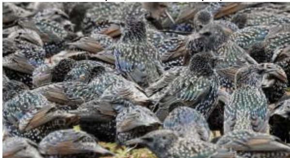
Starlings West Hynish, Tiree 25 Sept (Jim Dickson).