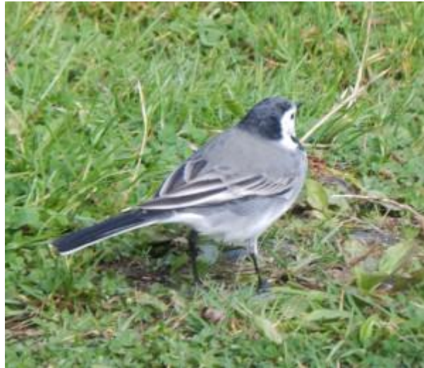
White Wagtail – Balephuill, Tiree 09 Sep (John Bowler).

The following were recorded during a return trip to Barra: 10+ Sooty Shearwaters west of Coll/Tiree (7 in 'Argyll waters') and 2 just east of Gott Bay/Gunna Sound, 25+ European Storm-petrels west of Coll/Tiree (20 in 'Argyll Waters'), 2 Grey Phalaropes west of Coll/Tiree – much closer to Barra – not in 'Argyll Waters', a Puffin on the approach to Gott Bay and ca 500 Shags roosting on rocks between Soa and Gunna Sound. Also a single Arctic Skua at the Lismore lighthouse (David Jardine).