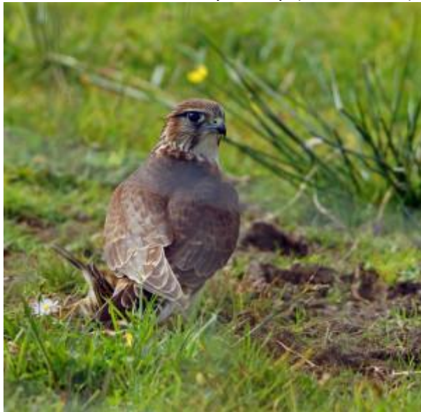
Female Merlin – Islay 17 Sep (Jim Dickson).

Waders at Strath Farm east pool (The Laggan), Kintyre today included: 10 Northern Lapwing , 2 Ruff and a Black-tailed Godwit . 20 Teal were also present (Eddie Maguire).