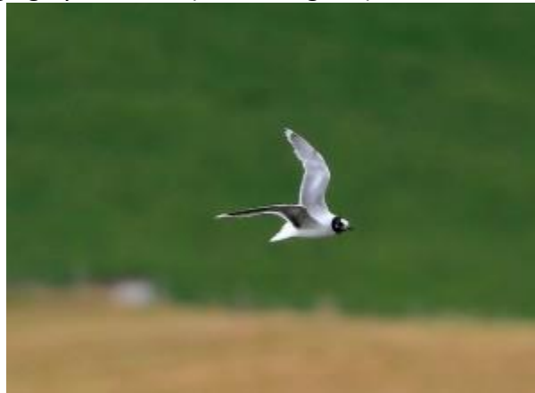
Little Gull - Strath farm, The Laggan, Campbeltown 12 Sep (Eddie Maguire).

tailed Godwit and a Little Gull in first-summer > second-winter plumage. Ruff had increased to 5 and a Common Redshank and ca 10 Common Snipe were also there. A flock of 200+ Chaffinches were foraging by the farm (Eddie Maguire).