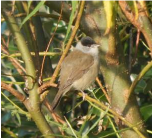
Blackcap Balephuil, Tiree 28 Sept (John Bowler).