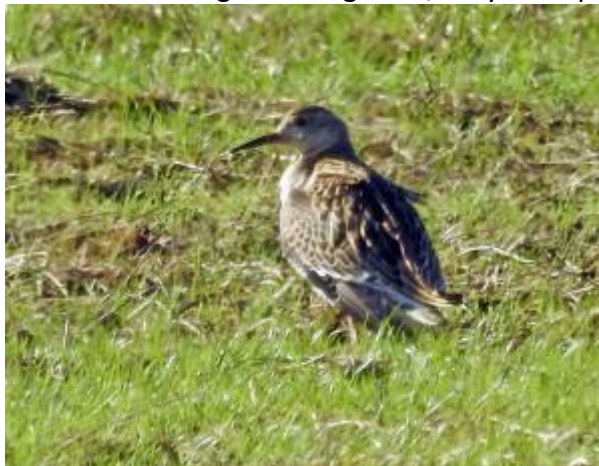
Ruff - Gruinart flats, Islay 13 Sep (Jim Dickson).