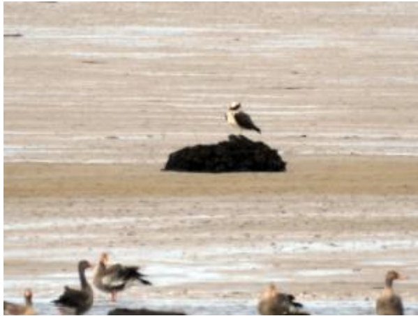
Osprey – Bridgend Merse, Islay 13 Sep (Jim Dickson).