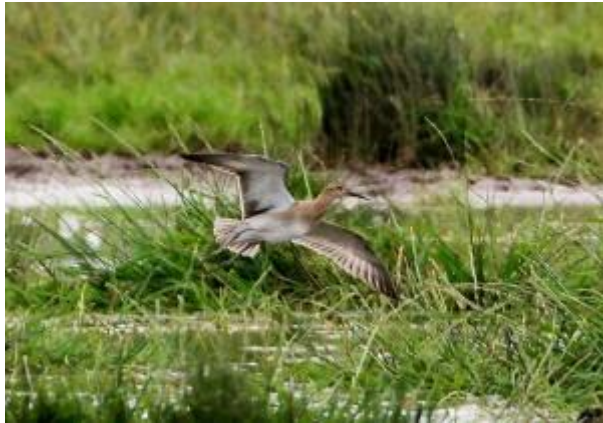
Ruff - Strath farm, The Laggan, Campbeltown 17 Sep (Eddie Maguire).

On Tiree, the Yellow-browed Warbler was present at Balephuill all day together with single Goldcrest , Common Chiffchaff , Garden Warbler and 4 Willow Warblers , 2 Sedge Warblers and now 6 Common Redpolls . Also an unexpected Bulrush Wainscot in the moth-trap - seemingly the first for the Vice-county (John Bowler).