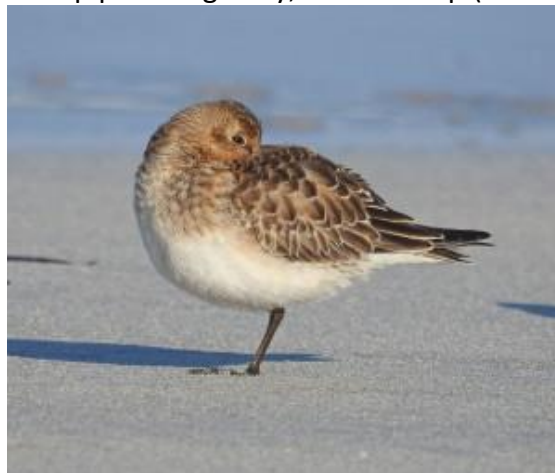
Baird's Sandpiper Hough Bay, Tiree Sep 30.