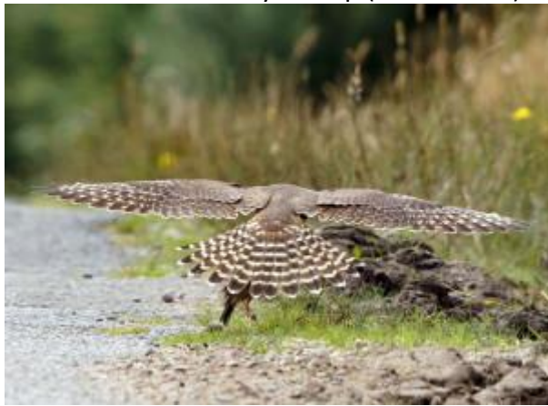
Merlin with catch – Islay 17 Sep.