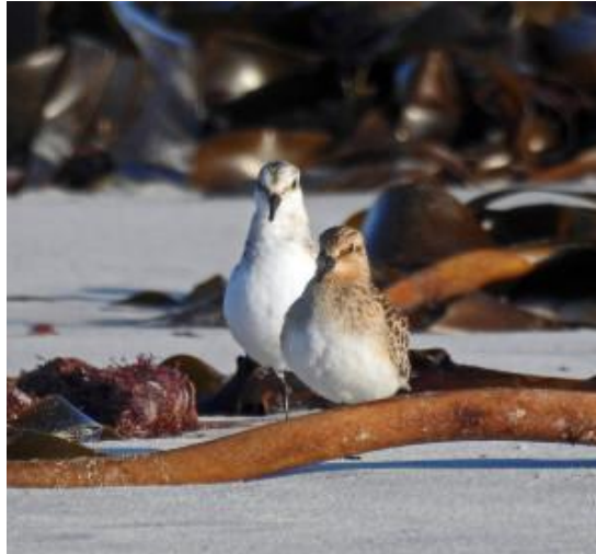
Baird's Sandpiper Hough Bay, Tiree 30 Sep (Jim Dickson).

30 September: A Hobby observed crossing the Sound of Mull heading south towards Glengorm this afternoon. (Ewan Miles per Alan Spellman). On Tiree the Juv Baird's Sandpiper still present at Hough Bay this morning (Jim Dickson). A Yellow-browed Warbler new at Balephuill at 18.30hrs - also 12 Common Redpoll , 6 Lesser Redpoll , 3 Goldfinch , 1 Dunnock , 2 Willow Warbler and 3 Blackcap there (John Bowler). 9 PB Brent at Sorobaidh Bay, 3 Ruff still at Sandaig 65 Barn Swallows at Kenovay and 54 Barn Swallows at Balevullin (John Bowler/Jim Dickson/Jerry Wilson). A Yellow-browed Warbler was found near Gary Turnbull's house in Ballygrant, Islay.