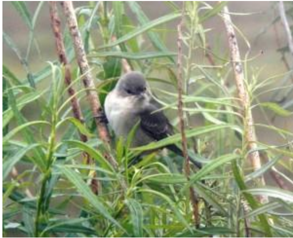
Barred Warbler – Balephuill, Tiree 07 Sep.