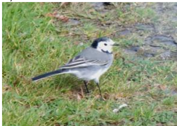
White Wagtail – Balephuill, Tiree 09 Sep (John Bowler).

There seems to be a good wagtail passage just now. For example 35 Pied Wagtails and at least 6 White Wagtails were at Drimvore (Moine Mhor), Mid-Argyll today and on Islay last Sat/Sun there were big numbers in several places (groups of 50+). Mostly Pied but often flocks were in flight so difficult to count the whites however on the garden lawn at Craighs, Gruinart there were 2 adult Whites and several first-winters in with 18+ Pied Wagtails. Dan Brown (on Islay 4-7 Sep) reported 18 White Wagtails in with 30 Pied Wagtails just behind Machair Bay (Jim Dickson).