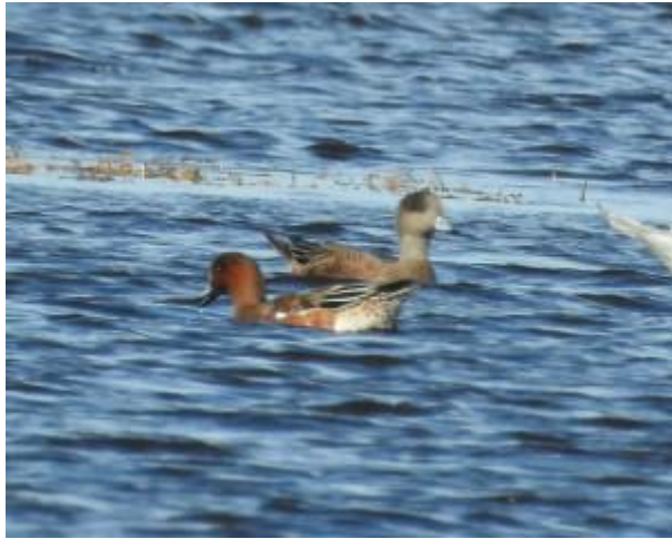
American Wigeon - Ardnave Loch, Islay 14 Sep (Jim Dickson).