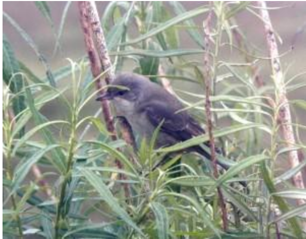
Barred Warbler – Balephuill, Tiree 07 Sep.

A Convolvulus Hawk-moth was found at Crossapol.