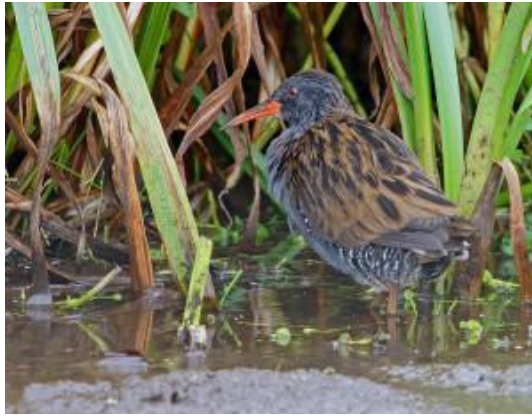
Water Rail Kilkenneth, Tiree 25 Sep (Jim Dickson).