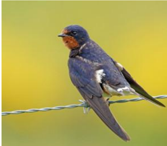
Barn Swallow Balevuillin, Tiree 25 Sept (Jim Dickson).