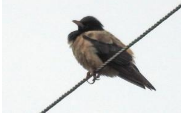
Rose-coloured Starling – nr. Machir Bay, Islay 16 Sep (Jim Dickson).

15 September: On Tiree today: a Common Kestrel , 2 Goldcrests , 2 Willow Warblers and a newly arrived Garden Warbler were at Balephuill. Also, 550 Golden Plover , 5 Ruffs , 12 Black-tailed Godwits and 2 Bar-tailed Godwits at Balevullin, a Ruff at Cornaigmore and 3 Ruffs at Middleton (John Bowler).