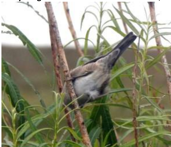
Barred Warbler – Balephuill, Tiree 07 Sep (John Bowler).

07 September: On Tiree today: the first winter Barred Warbler was finally showing well this evening at Balephuill along with 3 Sedge Warblers and 2 House Martins . Also, two Red-throated Divers , 3 juvenile Knot and 20 Bar-tailed Godwits at Gott Bay; a Ruff and 20 Black-tailed Godwits at Miodar; 4 Ruffs and 3 Black-tailed Godwits at Balevullin and at least 1 White Wagtail with at least 20 Pied Wagtails at Loch a' Phuill (John Bowler). A Pied Flycatcher and a Grey Wagtail were on the Oa at Kinnabus, Islay today (David Wood).