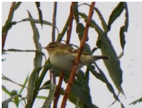
Yellow-browed Warbler – Balephuill, Tiree 19 Sep (John Bowler).

19 September: On Tiree today, a very late Common Cuckoo (first seen yesterday evening) and a Yellow-browed Warbler (a bright, silent bird) were at Balephuill together with 2 Common Chiffchaffs , 3 Willow Warblers , a male Blackcap (first of autumn here), 2 Sedge Warblers , a Dunnock and 4 Common Redpolls . Elsewhere, 8 Whooper Swans at Loch a' Phuill included 2 new arrivals, a Common Chiffchaff was at Sorobaidh Bay creek, a Corn Crake and a Yellow-browed Warbler in coastal weedy growth at Balemartine, a Common Chiffchaff with metal ring on right leg at Hynish and an immature Pied Flycatcher at Balinoe (John Bowler).