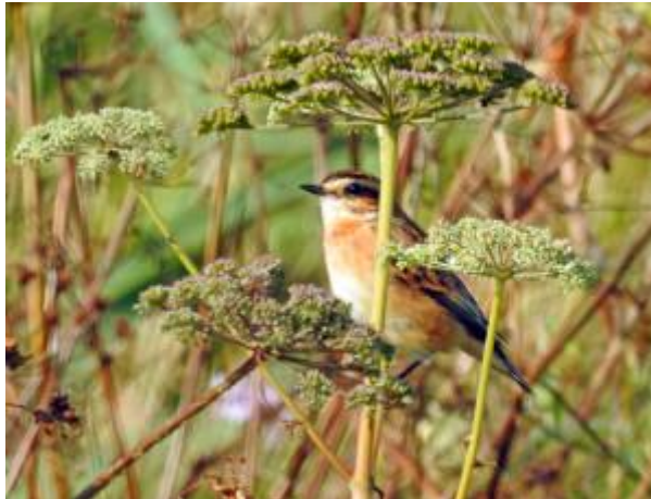
Whinchat – Craigens, Islay 13 Sep (Jim Dickson).

12 September: On Tiree, a Grey Phalarope was briefly in SW corner of Sorobaidh Bay this morning before flying south down the coast: also there, 7 juvenile Knot . Also, an immature Common Crossbill with 70 Linnets at Meningie and 4 Goldcrests and 2 Sparrowhawks at Carnan Mor (John Bowler).