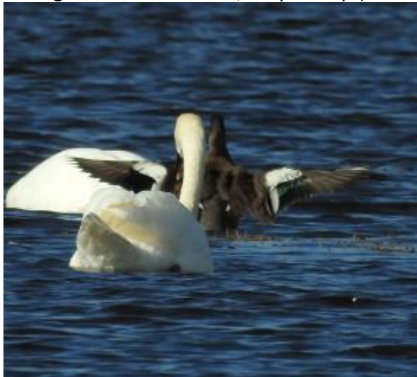
American Wigeon - Ardnave Loch, Islay 14 Sep (Jim Dickson).

13 September: The WeBS Count at Loch Sween today produced a 'first' for the site. A male Ruff with a flock of 12 Common Redshank at Loch na Cille (Paul Daw). Seems to have been an exceptionally good autumn for Ruff in Argyll generally.