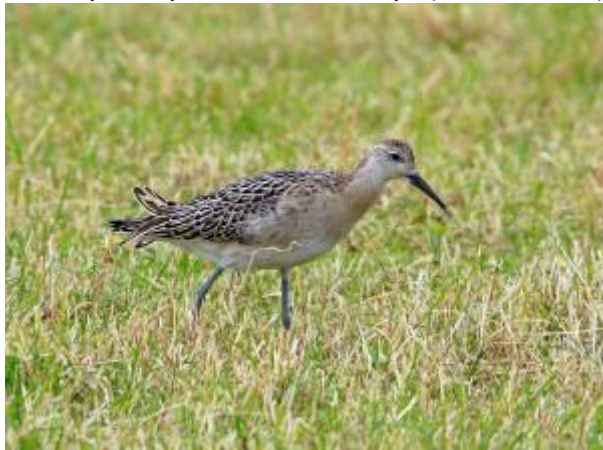
Ruff Ruaig, Tiree 28 Sept (Jim Dickson).

27 September: On Tiree: 2 juv Sabine's Gulls SW off Hynish in sea-watch 0720-0830 hrs in S6-7, also 2 Sooty Shearwater and 1 Pomarine Skua (Jerry Wilson). Later sea-watch 14.55-15.55hrs off Hynish in SSW7-5 produced (all heading SW):12 Sooty Shearwater , 1 Balearic Shearwater , 1 Pomarine Skua , 1 Great Skua , 111 Manx Shearwater , 55 Gannet , 30 Kittiwake , 87 large auk , 1 Red-throated Diver and 3 Wigeon - also 4 P-b Brent there and 5 P-b Brent at Sorobaidh Bay. Two Blackcap , 4 Goldcrest and 4 Willow Warbler at Balephuil (John Bowler). On Colonsay: 1Y Brent Goose at Port Lobh, Grey Plover with 76 Golden Plover Traigh nam Barc, 2 Lapland Buntings flying SE over Turnigil, 2 Grey Wagtails Kiloran Bay, 2 Grey Wagtails Colonsay House Gardens, 1 Chiffchaff Colonsay House Gardens (David Jardine).