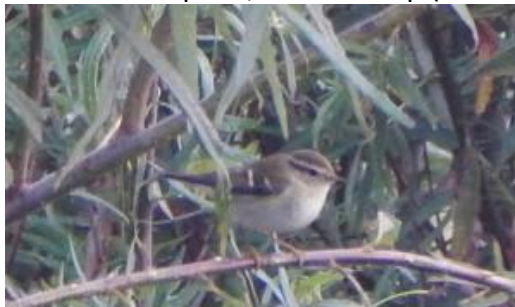
Yellow-browed Warbler – Balephuill, Tiree 17 Sep (John Bowler).