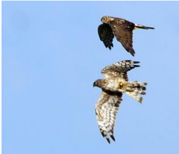
Female Hen Harriers – Craigens, Islay 13 Sep (Jim Dickson).