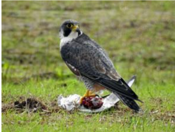
Peregrine Falcon - Gruinart flats, Islay 13 Sep (Jim Dickson).

Gruinart with 2 imm. Peregrine Falcons on the Merse; 2 Common Shelduck , 2 female Hen Harriers 'having a go' at each other, an adult Golden Eagle , 3 juvenile Black-tailed Godwits and 2 Whinchats at Craicens a female Sparrowhawk at Carnain; an Osprey on Bridgend Merse and a male Kestrel at Portnahaven (Jim Dickson).