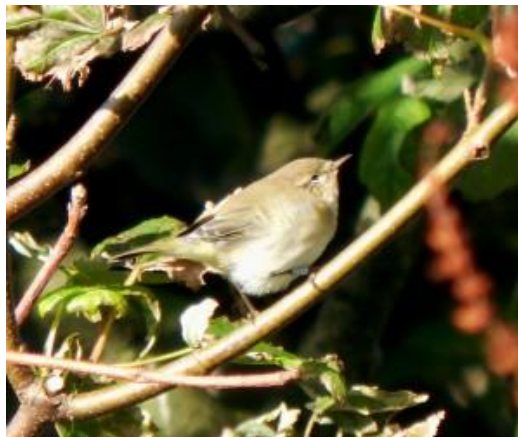
Common Chiffchaff – Balephuill, Tiree 19 Sep (John Bowler).

18 September: On Tiree, there was no sign of the Yellow-browed Warbler at Balephuill today but a Long-eared Owl appeared briefly there this morning. Also present there were: 3 Goldcrests , a singing Common Chiffchaff , 4 Willow Warblers , 2 Sedge Warblers , 3 Robins , a Dunnock and 6 Common Redpolls . The adult White-tailed Eagle was on NE side of Loch a' Phuill this afternoon again; also a Ruff and a Black-tailed Godwit at Baugh and a Ruff at Loch an Eilein (John Bowler).