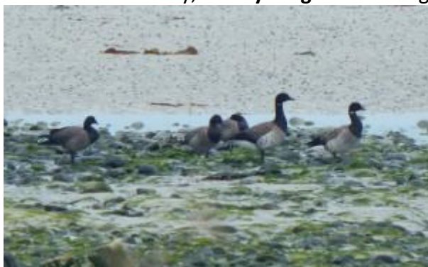
P-b Brent Geese Sorobaidh Bay, Tiree 26 Sept (John Bowler).

26 September: On Tiree: 1 Lapland Bunting south over Barrapol, 1 Chiffchaff and 1 Sedge Warbler at Sorobaidh Bay creek, 5 Pale-bellied Brent Geese at Sorobaidh Bay plus 9 Bar-tailed Godwits there, 1 Chiffchaff at West Hynish, 5 Willow Warblers , 1 f Blackcap , 1 Dunnock , 2 Goldcrest and 9 Redpolls at Balephuill, 1 Ruff and 2 Moorhen at Sandaig (John Bowler). Two Ruff and 1 Black-tailed Godwit at Scarinish (Jim Dickson). On Colonsay: Grey Plover with 76 Golden Plover Traigh nam Barc, 1 Barnacle Goose (with Canada Geese) Lochan Bhreac, Garvard, 1Y Brent Goose , Seal Cottage, Oronsay, 4+ Shoveler , South Oronsay ponds, 1Y Brent Goose Kiloran Bay, 1 Grey Wagtail Scalasaig (David Jardine).