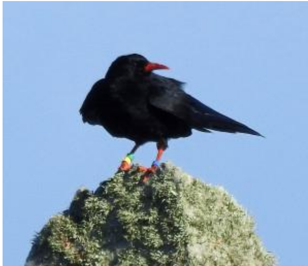
Colour ringed Red-billed Cough - Sanaigmore, Islay 13 Sep (Jim Dickson).