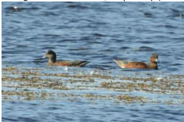
American Wigeon - Ardnave Loch, Islay 14 Sep (Jim Dickson).