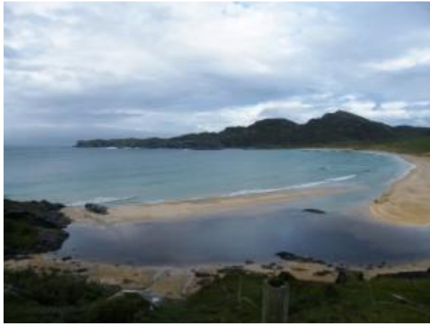
ABC trip to Colonsay 29 Aug