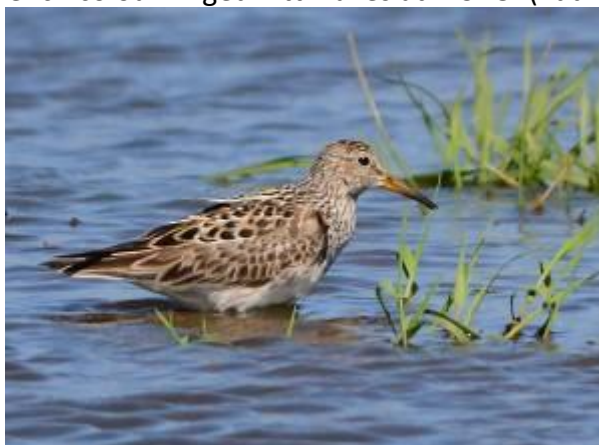
Pectoral Sandpiper - The Laggan, Campbeltown 19 Jul (Eddie Maguire).

A colour ringed first-summer Kittiwake photographed at Machrihanish Seabird Observatory on 24 May 2015 was found dead on the beach close by today. The bird was ringed in France (probably Brittany). Metal ring details were: Mus. Paris FX24192. There are four previous confirmed records of French colour ringed Kittiwakes at MSBO (Eddie Maguire).