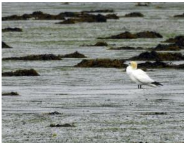
Northern Gannet – Loch Gilp, Mid-Argyll 04 Aug.

04 August: This Northern Gannet was standing on the mud at Loch Gilp today looking rather exhausted: it eventually tucked its head in and went to sleep! The first-summer Caspian Gull was also there still.