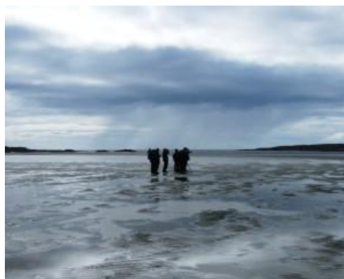
ABC trip to Colonsay 29 Aug.

29 August: Some highlights from the ABC trip from Kennacraig to Colonsay today included: 3 Swifts in total, 1 Puffin west of Islay, 1 Whimbrel calling & crossing in front of the ferry, 3 Chough , 1 juvenile Moorhen on Loch Fada, 6 Red Knot , 200 Ringed Plover and 100 Dunlin at Traigh nam Barc (Malcolm Chattwood/David Jardine).