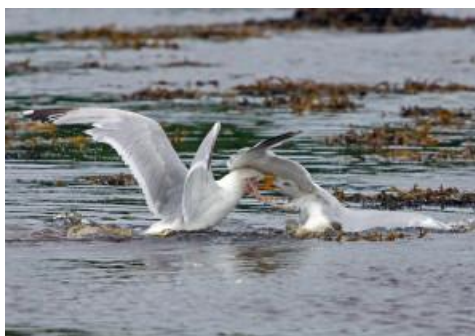
Herring Gull stooshie Loch Gilp, Mid-Argyll 19 Aug.