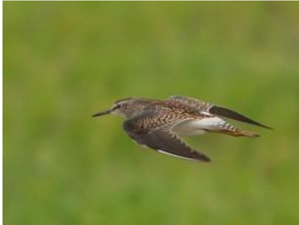
Wood Sandpiper - Strath Farm, The Laggan nr Campbeltown 06 Aug (Neil Black).

06 August: This morning a nice Wood Sandpiper was with 2 Dunlin and a female-type Shoveler at the east pool at Strath Farm (The Laggan near Campbeltown) (Eddie Maguire / Neil Black - photos from both). At MSBO the only newsworthy event was an all too brief visit to the garden by a cracking Humming Bird Hawk Moth (Eddie Maguire).