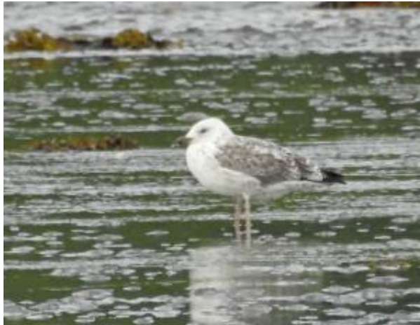
first-summer Caspian Gull – Loch Gilp, Mid-Argyll 08 Aug (Jim Dickson).