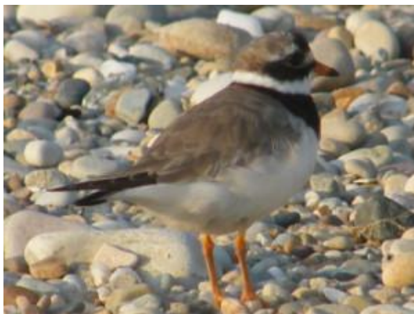
Ringed Plover - Ormsary, Knapdale 13 Aug (Davie Rutherford).

This Ringed Plover was photographed at Ormsary, Knapdale this evening (Davie Rutherford).