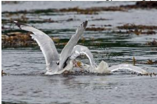
Herring Gull stooshie Loch Gilp, Mid-Argyll 19 Aug.