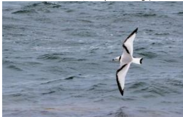
Kittiwake – MSBO, Kintyre 27 Aug (Eddie Maguire).

26 August: The Twite season commenced at Machrihanish Seabird Observatory, Kintyre today and 14 birds were colour ringed. A pair that were ringed during autumn 2013 were re-trapped along with one of their youngsters. Waders moving south there included: 140 Oystercatchers , 40 Red Knot and a Greenshank (Eddie Maguire / Rab Morton).