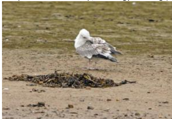
1st summer Caspian Gull - Loch Gilp, Mid-Argyll 21 Aug.