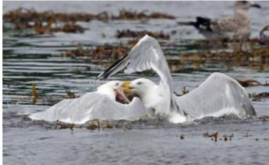
Herring Gull stooshie Loch Gilp, Mid-Argyll 19 Aug.