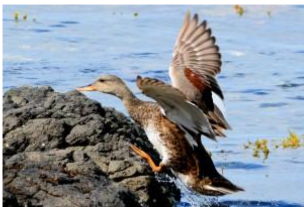
Eclipse male Gadwall – Machrihanish Seabird Observatory, Kintyre 04 Jul.