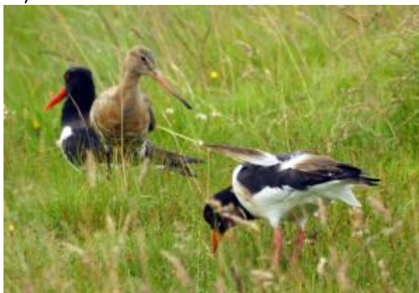
Black-tailed Godwit – Add Estuary, Mid-Argyll 23 Jul (Jim Dickson).

23 July: Flocks of Mistle Thrush building up at Cairnbaan, Mid-Argyll: 17 this morning with a further 4 in the Moine Mhor area. Also a single Black-tailed Godwit at the Islandadd Bridge, Moine Mhor (Jim Dickson).