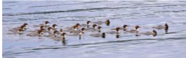
Goosanders – Holy Loch, Cowal 22 Aug.

This group of Goosanders on the Holy Loch, Dunoon today comprised 27 birds.