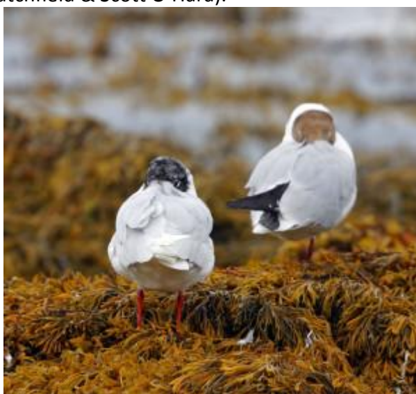
Mediterranean Gull - Loch Gilp, Mid-Argyll 27 Jul.