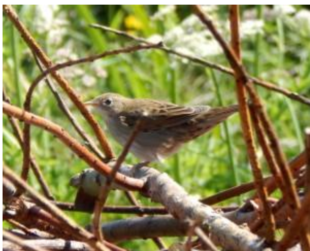
Grasshopper Warbler – Balephuill, Tiree 18 Jul (John Bowler).

17 July: The weather conditions today were presumably behind several rewarding sightings of grounded waders.