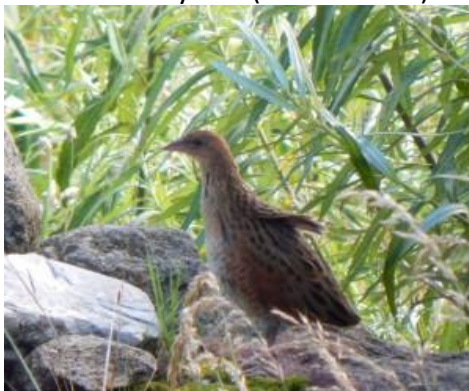
Corn Crake – Balephuill, Tiree 15 Aug (John Bowler).

15 August: On Tiree today a late Corn Crake was showing well at Balephuill and 2 adult and a juvenile Black-throated Divers were off Hynish (John Bowler).