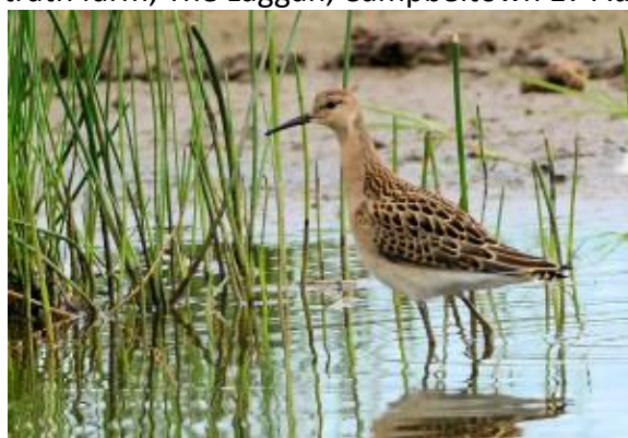
Ruff - Strath farm, The Laggan, Campbeltown 17 Aug.