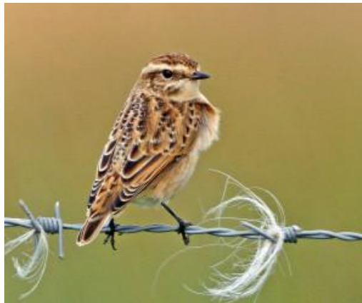
Whinchat Add Estuary 30 Aug 2015 (Jim Dickson).

30 August: At the Add Estuary today: 112 Ringed Plovers , 40+ Dunlin , 14 Red Knot , 2 Bar-tailed Godwits , 28 Common Redshank , 1 Turnstone , 7 Cormorants , 8 Goosanders , 2 Wigeon , 1 Osprey , 4 juvenile Whinchats (Jim Dickson).