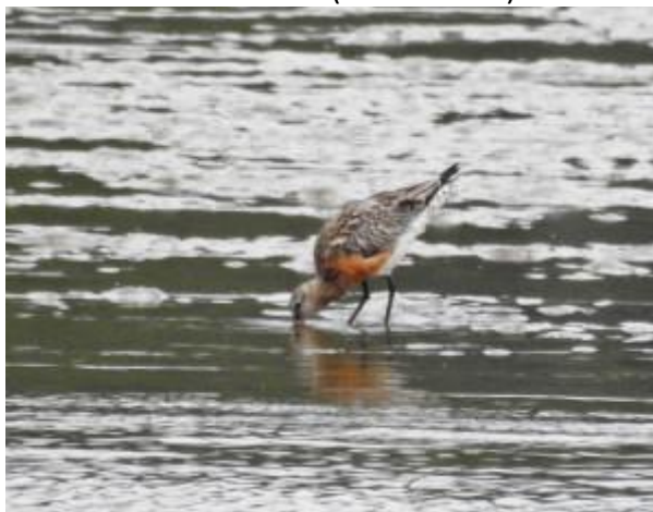
Adult Bar-tailed Godwit – Loch Gilp, Mid-Argyll 09 Aug (Jim Dickson).

At Loch Gilp, Mid-Argyll today: The first-summer Caspian Gull was present 10:00-11:30. Also a juvenile Peregrine Falcon overhead, an adult Black-tailed Godwit on the shinty pitch and 2 Bar-tailed Godwits on the mud inc. one red adult. And at the Add Estuary: an Osprey , 10 adult Black-tailed Godwits and a Greenshank (Jim Dickson).