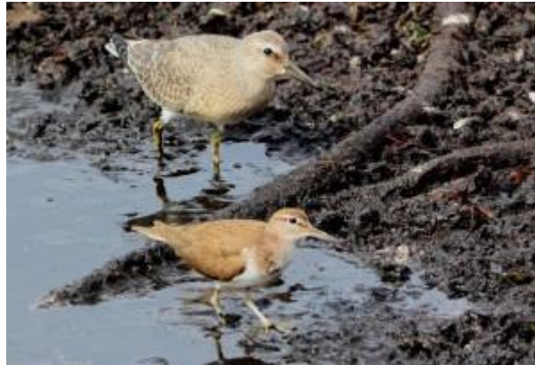
Red Knot & Common Sandpiper - MSBO, Kintyre 28 Aug (Eddie Maguire).

And at Strath Farm east pool, The Laggan (nr Campbeltown): 62 Greylag Geese , one female-type Shoveler , 82 Black-headed Gulls , 210 Common Gulls , 3,000+ Herring Gulls , 40 Great-black-backed Gulls and 61 Lesser-black Backed Gulls . Unfortunately, recent heavy rain has flooded the pool and the muddy margins are gone!