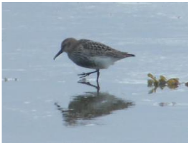
Dunlin - ABC trip to Colonsay 29 Aug.