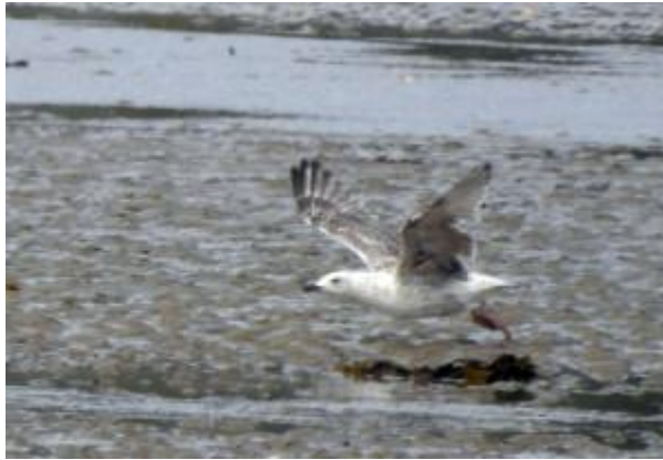
first-summer Caspian Gull – Loch Gilp, Mid-Argyll 08 Aug (Jim Dickson).