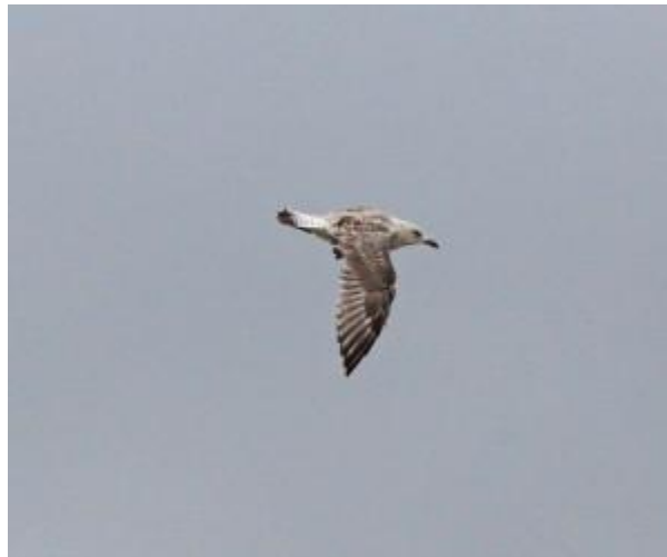
1st summer Caspian Gull - Loch Gilp, Mid-Argyll 21 Aug.