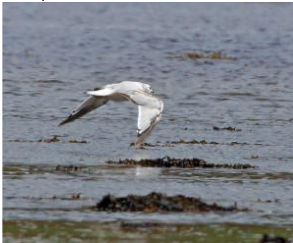
first-summer Ring-billed Gull – Loch Gilp, Mid-Argyll 22 Jul.

Among the birds seen during the ABC Field Trip to Loch Gilp, Add Estuary and Taynish on Saturday 25 July was the first-summer Ring-billed Gull that has been around at Loch Gilp for a few days. Not an easy gull to pick out from the crowd so here are a couple of Jim Dickson's photos (taken on 22 July) of the bird in question, which show the essential ID features. NB in the second photo it's the bird on the right and when seen on Monday 27 Jul it was limping badly....so might be easier to pick out in future!!