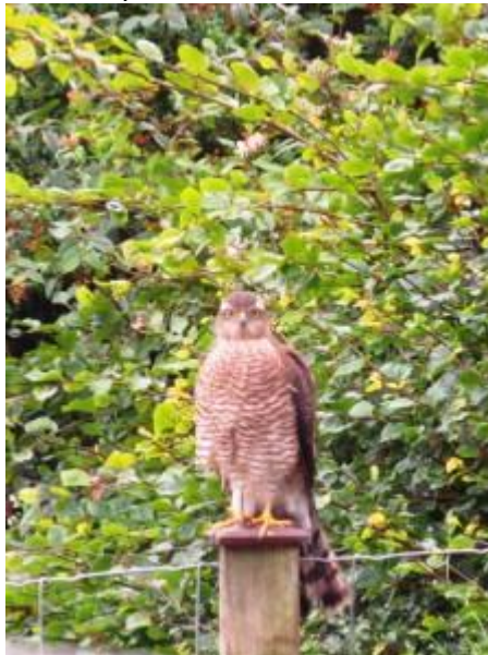
Sparrowhawk - Tullochgorm (Minard), Mid-Argyll 20 Aug.

This juvenile Sparrowhawk which arrived on the garden fence at Tullochgorm (Minard), Mid-Argyll this morning looked as surprised to see me as I was him (or her).