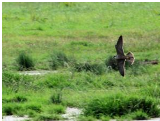
Peregrine Falcon - Strath farm, The Laggan, Campbeltown 17 Aug.