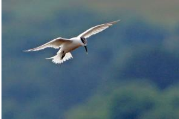
Sandwich Tern - Loch Gilp, Mid-Argyll 14 Aug.