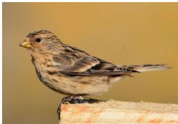
Twite - MSBO, Kintyre 28 Aug (Eddie Maguire).

27 August: At Loch Gilp, Mid-Argyll today: 11 Eurasian Wigeon , 1st summer Caspian Gull still present, 29 Ringed Plover , 7 Bar-tailed Godwits in non-breeding plumage, a single Whimbrel and 6 Common Redshank . And at the Add Estuary: 109 Ringed Plover , 7 Red Knot , one Sanderling , 31 Dunlin , a juvenile Bar-tailed Godwit and 18 Common Redshank (Jim Dickson).