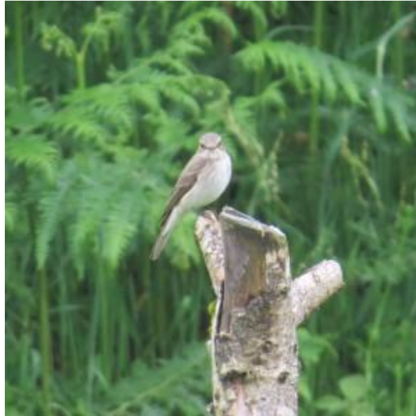
Spotted Flycatcher - Bellanoch, Mid-Argyll 05 Jul.

These Spotted Flycatchers were enjoying the abundant insect life at Bellanoch, Mid-Argyll today.