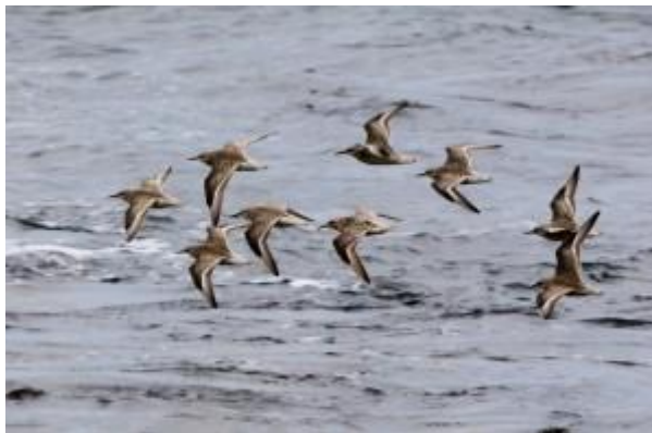
Red Knot - MSBO, Kintyre 09 Aug (Eddie Maguire).

At Loch Gilp, Mid-Argyll today: The first-summer Caspian Gull was present 10:00-11:30. Also a juvenile Peregrine Falcon overhead, an adult Black-tailed Godwit on the shinty pitch and 2 Bar-tailed Godwits on the mud inc. one red adult. And at the Add Estuary: an Osprey , 10 adult Black-tailed Godwits and a Greenshank (Jim Dickson).