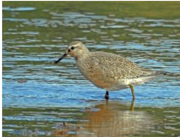
Red Knot - Loch Crinan, Mid-Argyll 25 Aug (Jim Dickson).

At Loch Crinan, Mid-Argyll late morning: a Wood Sandpiper (flushed & flew towards Eilean Glas), 29 Ringed Plover , 25 Dunlin , a Red Knot , one Black-tailed Godwit , 2 Bar-tailed Godwits , a Greenshank and 17 Common Redshank . Also 2 Eurasian Wigeon at Loch Gilp and 2 Common Swifts over Cairnbaan. And the Add Estuary this evening one Wigeon , 2 Whimbrel , 3 Greenshanks , 25 Common Redshanks and 5 Common Sandpipers (Jim Dickson).