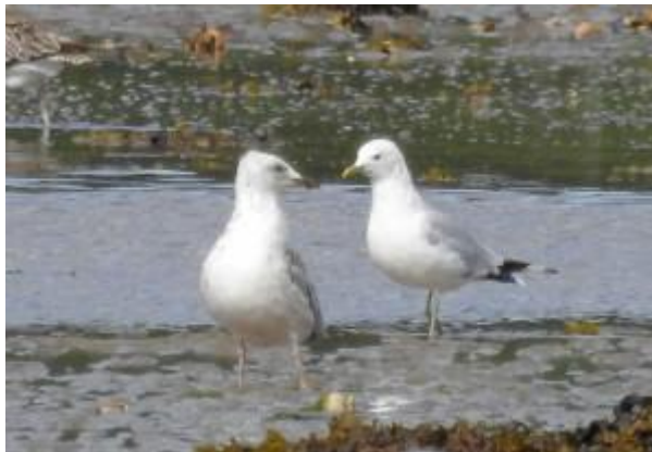
first-summer Caspian Gull – Loch Gilp, Mid-Argyll 08 Aug.

On Jura today at Glas Eilean David Jardine saw 10 species of waders including a single Little Stint .