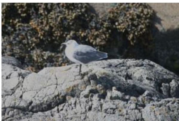
Laughing Gull - Portnahaven, Islay 21 Jul.