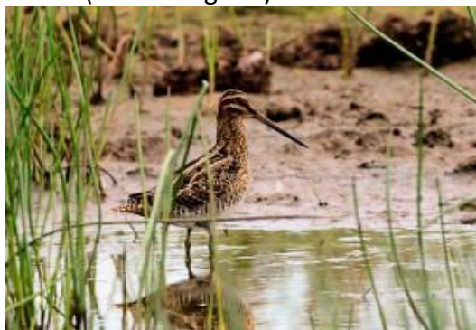
Common Snipe - Strath farm, The Laggan, Campbeltown 17 Aug (Eddie Maguire).

An overnight increase in waders at Strath Farm east pool, The Laggan (nr Campbeltown) included: 6 Ruffs , 2 Common Snipe , 9 Black-tailed Godwits and a Common Redshank . A juvenile Peregrine Falcon spooked the waders this morning but appeared far too inexperienced for this 'fast food' (Eddie Maguire).