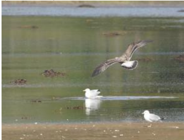
probable juvenile Yellow-legged Gull Loch Gilp, Mid-Argyll 13 Aug (Jim Dickson).

13 August: A probable juvenile Yellow-legged Gull was photographed at Loch Gilp, Mid-Argyll late this morning (Jim Dickson).