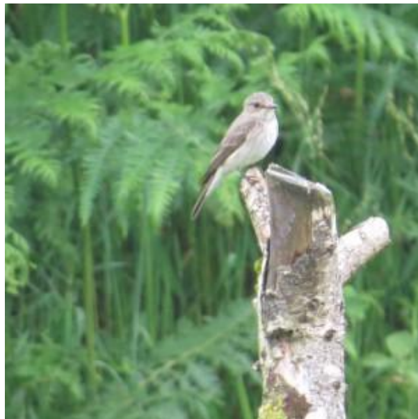
Spotted Flycatcher - Bellanoch, Mid-Argyll 05 Jul.