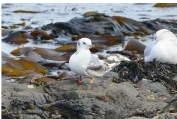
colour ringed Kittiwake - MSBO, Kintyre - photographed 24 May 2015.

18 July: On Tiree today: 99 Black-tailed Godwits at Loch a' Phuill, 38 Black-tailed Godwits at Loch an Eilein and a Grasshopper Warbler showing nicely at Balephuill (John Bowler).