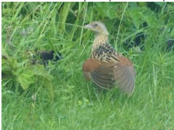
Corn Crake and young - Oronsay, Colonsay 08 Jul (Mike Peacock).

08 July: This female Corn Crake photographed on Oronsay, Colonsay today had a brood of 5 small young, one of which can be seen in the photo (Mike Peacock).