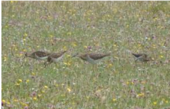
Ruffs - Loch a' Phuill, Tiree 07 Aug.