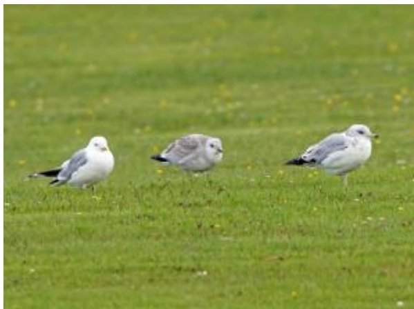
first-summer Ring-billed Gull – Loch Gilp, Mid-Argyll 22 Jul (Jim Dickson).

30 July: On Tiree today: 6 Whooper Swans , 35 Mute Swans , 4 Black-tailed Godwits and 2 Great Skuas at Loch a' Phuill. Also 2 Bar-tailed Godwits at Gott Bay, a Greenshank at The