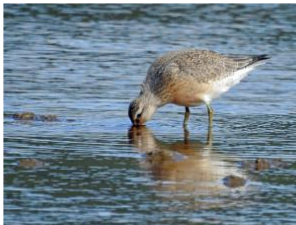
Red Knot - Loch Crinan, Mid-Argyll 25 Aug (Jim Dickson).

24 August: On Tiree today: a juvenile Spotted Redshank with 4 Bar-tailed Godwits and 4 Greenshank at Sorobaidh Bay; a third calendar year Little Gull and 2 Sandwich Terns at Gott Bay; at least 28 juvenile Ruff on pools on silage fields with 58 Ringed Plover , 30 Dunlin and a further 13 Bar-tailed Godwits at Salum / Ruaig; a male Sparrowhawk at Baugh and a Greenshank at Sandaig. Also dozens of Black and Common Darter dragonflies in sheltered places (John Bowler).