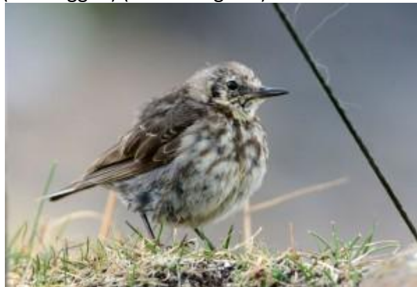
Unusual Rock Pipit – MSBO, Kintyre 11 Jul (Eddie Maguire).

11 July: Still relatively quiet at Machrihanish Seabird Observatory today but 5 Common Scoter flying south and 11 Common Sandpipers also flying south, including a flock of 5. An adult Rock Pipit with leucistic / aberrant plumage was photographed. Four adult Dunlin were Strath Farm pool (The Laggan) (Eddie Maguire).