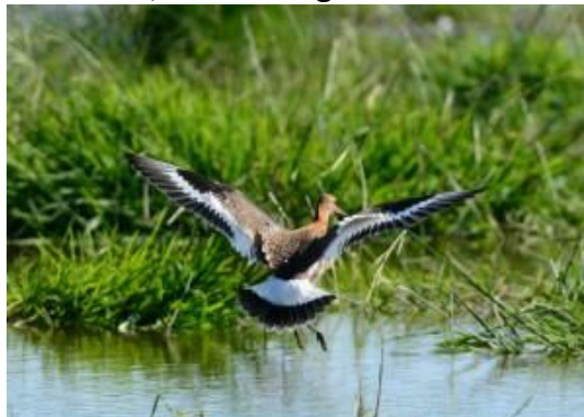
Black-tailed Godwit – Strath farm, The Laggan, Campbeltown 16 Aug (Eddie Maguire).

At the Strath Farm east pool, The Laggan (nr Campbeltown) today: 2 Ruff and a Black-tailed Godwit with a male Hen Harrier flying E close by. The only species to appear in any numbers at Machrihanish Seabird Observatory today were Kittiwakes . A total of 464 flew S in 5hrs and 328 (70%) of these were juveniles. A further 11 birds not included in this analysis were first-summers. Also, a rare bird here, a Wood Pigeon flew in-off the sea (Eddie Maguire).