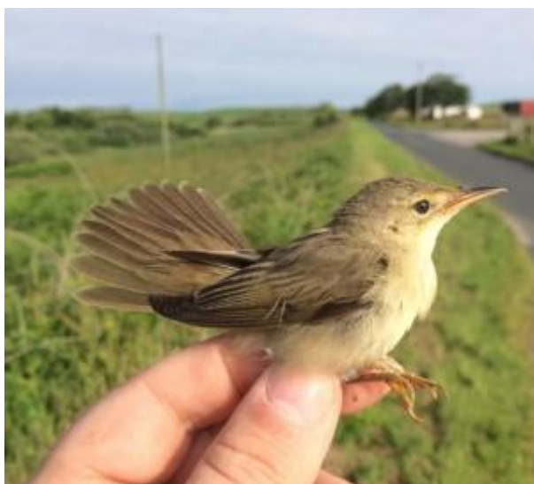
Reed Warbler – Aros Moss, Kintyre 09 Jul.

On Gunna Island, Tiree today: one Canada Goose , one Barnacle Goose , a Sandwich Tern and a Short-eared Owl . Also a male Greenfinch at Balephuill (John Bowler).