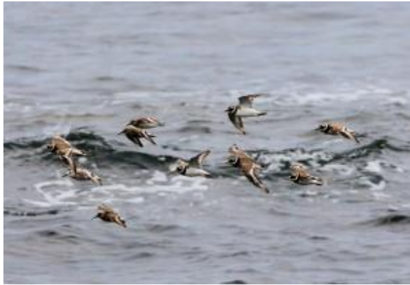
Ringed Plover, Sanderling & Dunlin – MSBO, Kintyre 09 Aug.