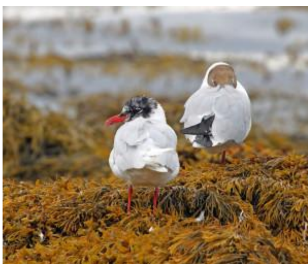
Mediterranean Gull - Loch Gilp, Mid-Argyll 27 Jul (Jim Dickson).

26 July: A Nuthatch was on garden bird feeders at Carsaig (Tayvallich), Mid-Argyll at 10:45 today (Jon Close).