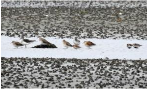
Waders – Loch Crinan, Mid-Argyll 31 Jul.

A single Sooty Shearwater and ca 2,000 Manx Shearwaters were seen off Gunna Sound from the Tiree-Mull ferry today.