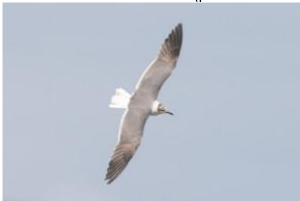
Laughing Gull - Portnahaven, Islay 21 Jul