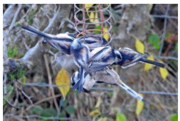
Long-tailed Tits - Cairnbaan 21 Nov (Jim Dickson).

20 November: Islay: A Little Egret was reported from Machir Bay this afternoon (Toby Green per Angus Murray).