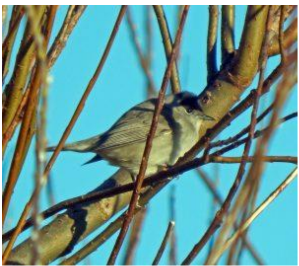
Blackcap - Tiree 20 Nov (John Bowler).

Tiree: 2CY Iceland Gull at Kilkenneth – quite likely the bird that over-summered there. 1 m Blackcap at Balephuil (John Bowler).