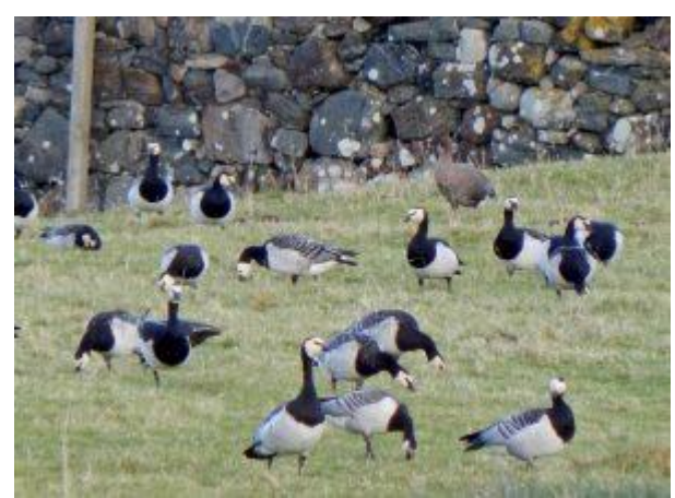
Barnacles and a Pink-footed Goose- Tiree 24 Nov (John Bowler).

22 November: Islay: A m Green-winged Teal with 150+ Teal from the viewing platform overlooking Gruinart floods/scrapes this afternoon (Toby Green per Angus Murray).