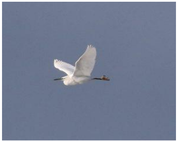
Little Egret - Islay 20 Nov (Toby Green).

19 November: Tiree: 1f Blackcap at Balephuil,1 imm/f Greater Scaup at Loch a' Phuill (John Bowler).