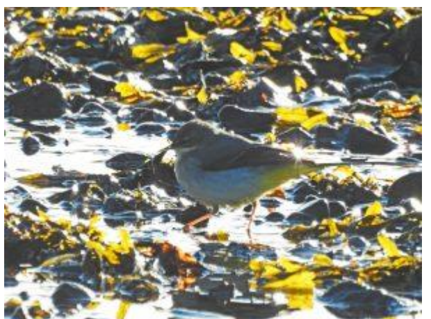
Grey Wagtail - Loch Gilp 21 Nov (Jim Dickson).

21 November: Mid-Argyll: A Kingfisher at Furnace, Loch Fyne around mid-day. At Loch Gilp: 32 Dunlin , 27 Ringed Plover and 2 Red Knot plus a Grey Wagtail , however counts disrupted by presence of a hovercraft! Also at Cairnbaan 8 Long-tailed Tits on feeders (Jim Dickson). Islay: A Red Kite over Kinnabus and a Long-tailed Duck on the loch this afternoon – both firsts on the reserve for me (David Wood).