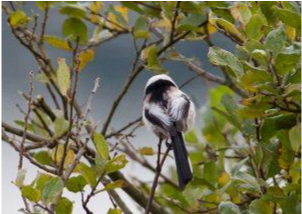
'Northern' Long-tailed Tit - Loch Beg, Mull 7 Nov.