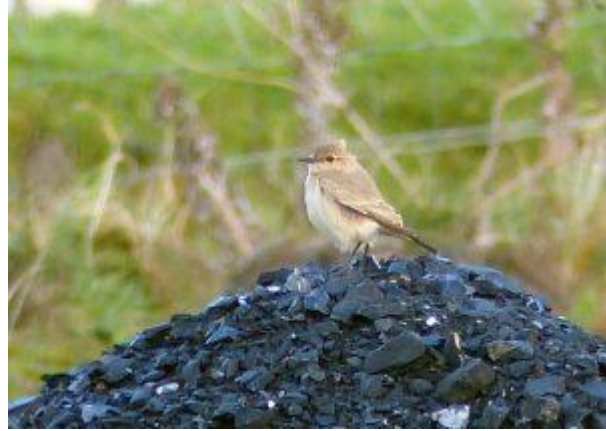
Wheatear - Islay 27 Nov (Mike Peacock).