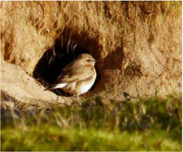
Wheatear - Islay 27 Nov.

27 November: Islay: a very pale wheatear was seen at Machir Bay (Mike Peacock/Ian Brooke/Peter Roberts) and was probably the same bird seen there on 23 Nov. It required close study to rule out Isabelline Wheatear however in the end it was considered to be a very late, pallid Northern Wheatear and perhaps the latest ever in Argyll by a few days.