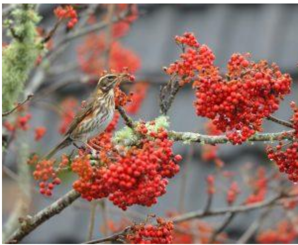
Redwing - Tayvallich 29 Oct (Morag Rea).

03 November: Mid-Argyll: Morag Rea kindly sent some thrush photos taken at Tayvallich recently.