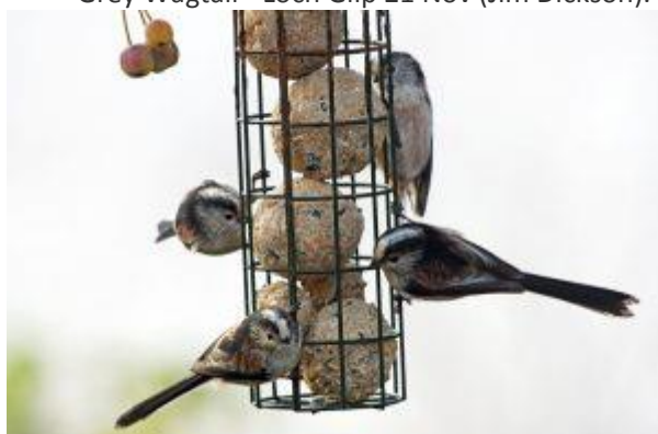
Long-tailed Tits- - Cairnbaan 21 Nov (Jim Dickson).