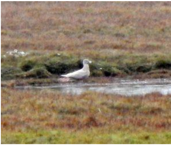
Glaucous Gull - Tiree 26 Nov.