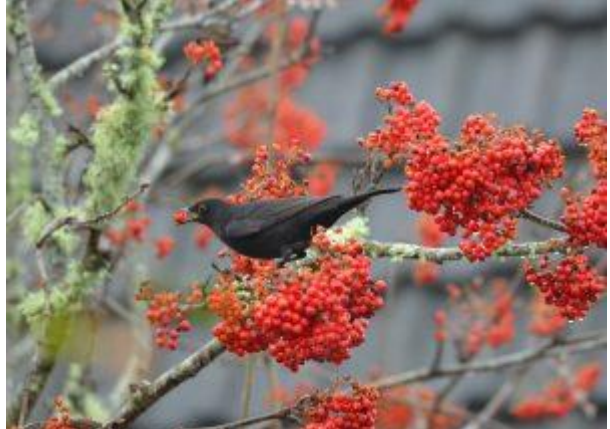
Blackbird - Tayvallich 29 Oct (Morag Rea).