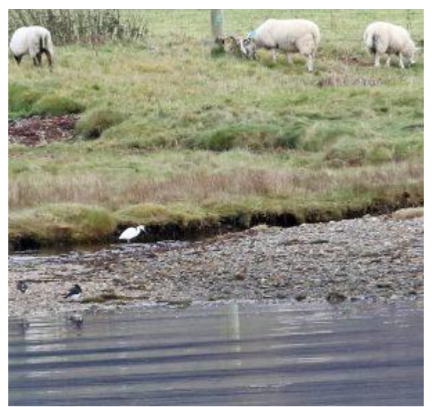
Little Egret - West Loch Tarbert 26 Nov (Toby Green).