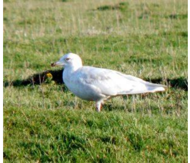
Iceland Gull - Tiree 20 Nov (John Bowler).