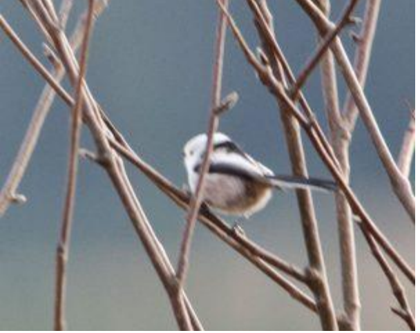
'Northern' Long-tailed Tit - Loch Beg, Mull 7 Nov (Bryan Rains).