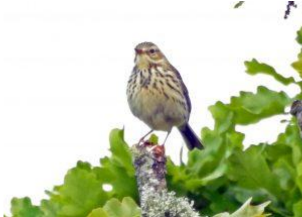
Tree Pipit - Duntrune, Mid-Argyll 29 May.

A male Hen Harrier was hunting over clear-fell at Tullochgorm (Minard), Mid-Argyll this morning (Paul Daw).