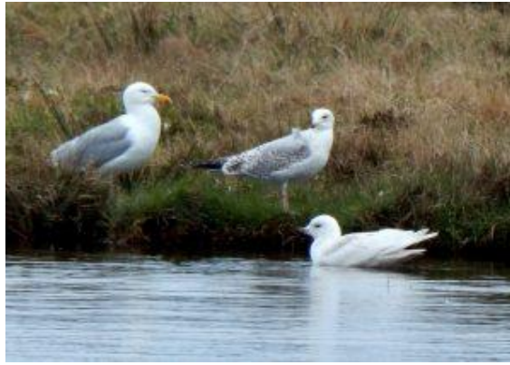
Iceland Gull – Heylipol, Tiree 16 May.