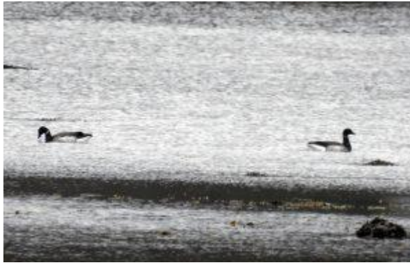
Pale-bellied Brent Geese – Loch Gilp, Mid-Argyll 01 May.