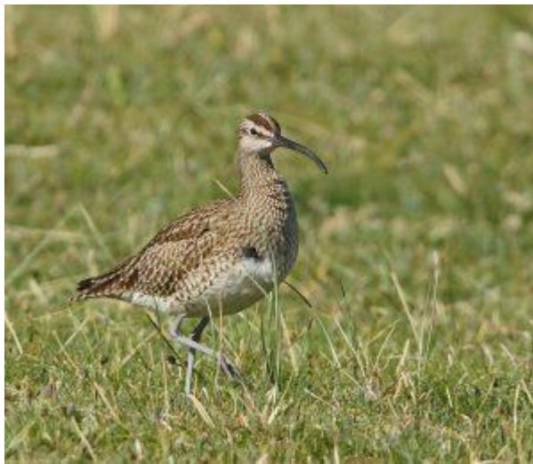
Whimbrel – Tiree 14 May.