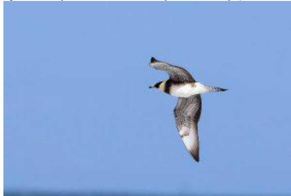
Pomarine Skua - MSBO, Kintyre 03 May.