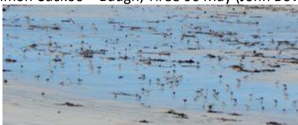
Waders - Balephetrish Bay, Tiree 06 May (John Bowler).

A Wood Pigeon on the Oa, Islay was the first reserve record for 9 yrs, despite them breeding a few miles up the road. Also there today: Common Chiffchaff and male Blackcap . A Great Skua was seen offshore and a good number of Red-throated Divers moving past NW, with 48 in total from 08:30-09:30, in groups of between 4 and 13. Common Cuckoos Grasshopper Warblers , Sedge Warblers and Barn Swallows seemingly arriving over last couple of days (David Wood).