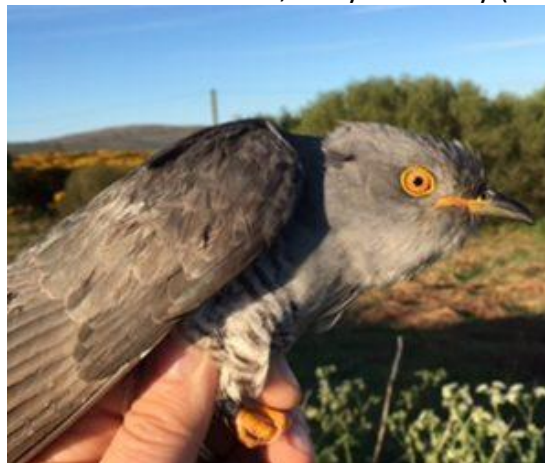
Common Cuckoo – Aros Moss, Kintyre 15 May.