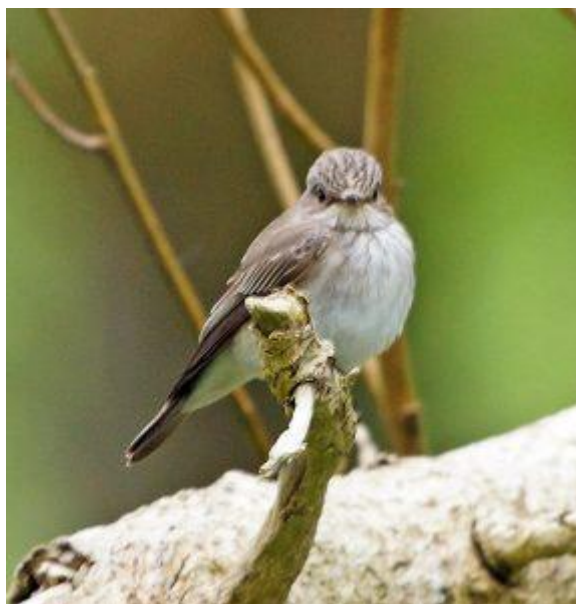
Spotted Flycatcher – Loch Gruinart, Islay 17 May (Jim Dickson).

This Spotted Flycatcher was photographed at RSPB Gruinart reserve woods, Islay today (Jim Dickson).