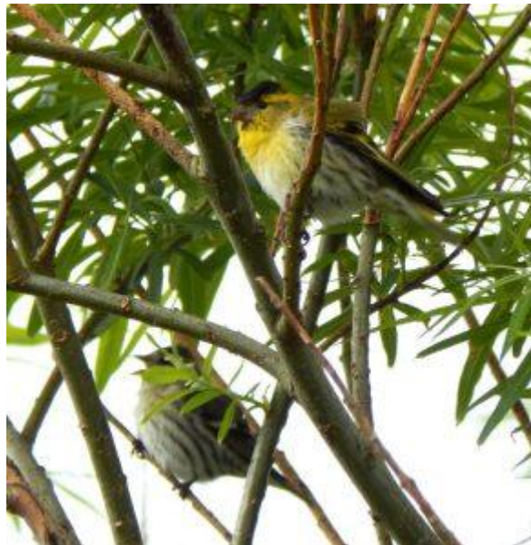
Siskins – Balephuill, Tiree 29 May (John Bowler).

29 May: On Tiree today: a Wood Pigeon , 2 Common Chiffchaffs , a male Common Whitethroat and male and female Siskin at Balephuill; 5 male and a female Blackcaps and a Spotted Flycatcher at Carnan Mor (John Bowler). And a Yellow-legged Gull was reported at Rubha Saltaig, Tiree, with 3 Pintail (2m, 1f) among the Eiders on Saltaig sea inlet (Alison Morgan).