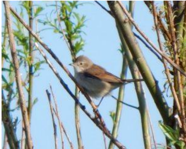
Common Whitethroat – Balephuil, Tiree 11 May.