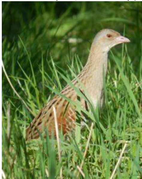
Corn Crake – Balephuill, Tiree 09 May (John Bowler).

At Machrihanish Seabird Observatory, Kintyre today: a Green Sandpiper flew N (too close to photograph!), a Black-tailed Godwit was nearby and 3 White Wagtails were on the shore (Eddie Maguire).