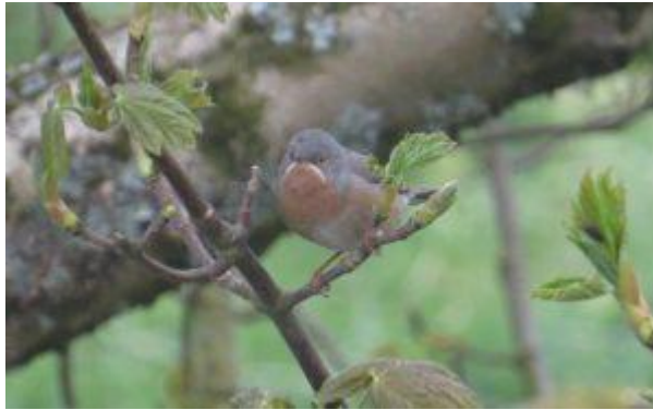
'Western' Subalpine Warbler - Kinnabus, Islay 16 May (David Wood).