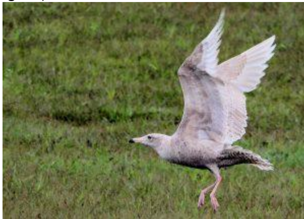
Glaucous Gull – MSBO, Kintyre 01 May (Eddie Maguire).

A first-winter Glaucous Gull was photographed by Machrihanish Seabird Observatory, Kintyre today (Eddie Maguire).