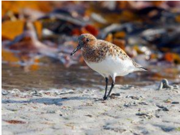
Sanderling – Tiree 12 May.