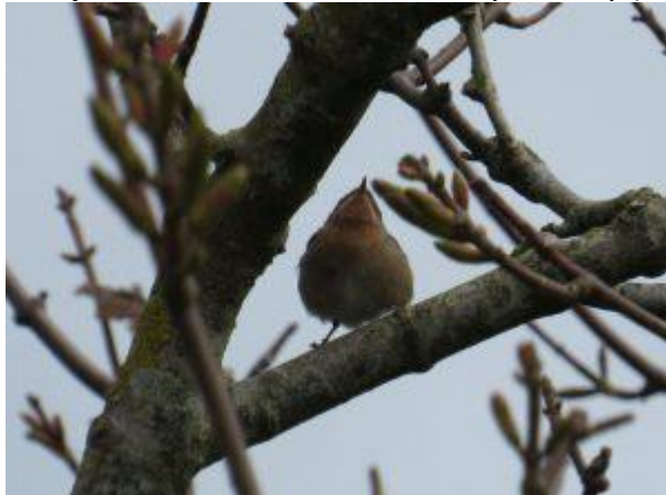
'Western' Subalpine Warbler - Kinnabus, Islay 16 May (David Wood).