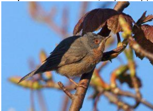
‘Western’ Subalpine Warbler - Kinnabus, Islay 16 May (Jim Dickson).