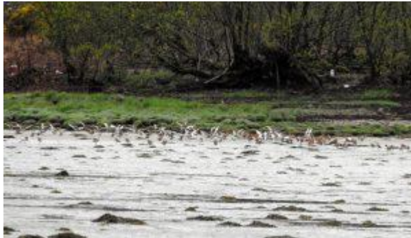
Black-tailed Godwits – Loch Gilp, Mid-Argyll 01 May.