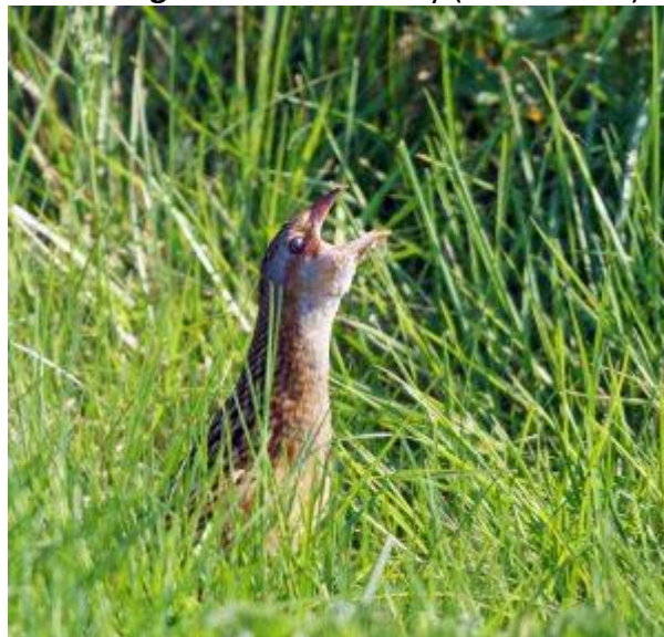
Corn Crane – Tiree 12 May (Jim Dickson).