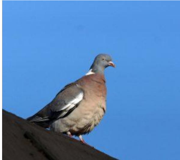
Wood Pigeon – Tiree 14 May (Jim Dickson).