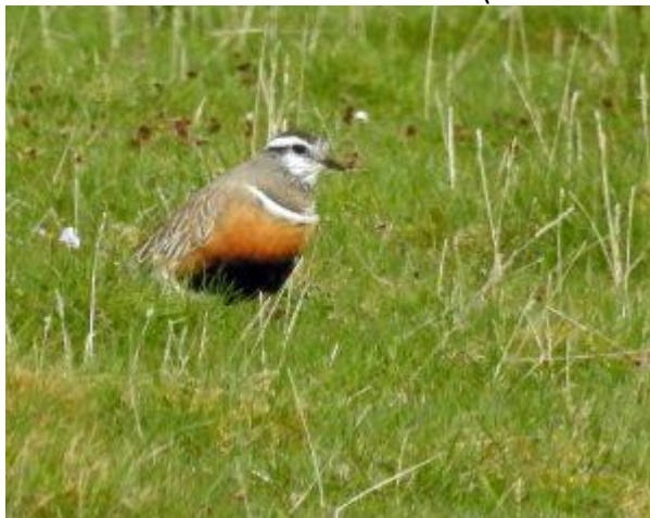
Dotterel – Vaul, Tiree 13 May (Jim Dickson).

On Tiree today: a male and a female Ruff on a pool near Heylipol church; a female Dotterel on Vaul golf course this evening with 120 Ringed Plovers (Jim Dickson). Four Minke Whales were seen in Gunna Sound (John Bowler).