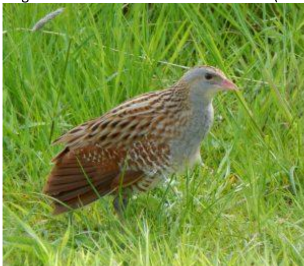
Corn Crane – Tiree 19 May.