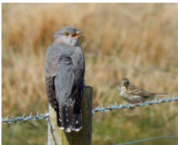
Common Cuckoo – Baugh, Tiree 06 May.