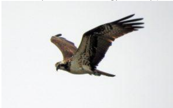
Osprey – Add Estuary, Mid-Argyll 28 May.