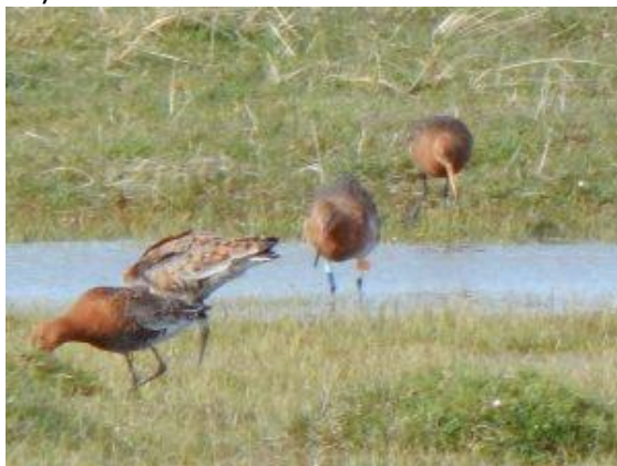
Leg-flagged Black-tailed Godwit – Loch Bhasapol, Tiree 02 May (John Bowler).

Black-tailed Godwits galore on Tiree today. A female Greater Scaup , 78 Black-tailed Godwits and a House Martin at Loch an Eilein; 180 Black-tailed Godwits (inc. a French leg-flagged bird) and 5 Arctic Terns at Loch Bhasapol (but no sign of the Green-winged Teal); 135 Black-tailed Godwits at Loch a' Phuill, as well as 220 Ringed Plovers , 75 Dunlin and 4 Arctic Terns (John Bowler).