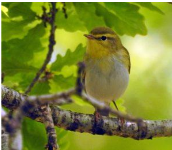
Wood Warbler - Taynish NNR, Mid-Argyll 28 May.