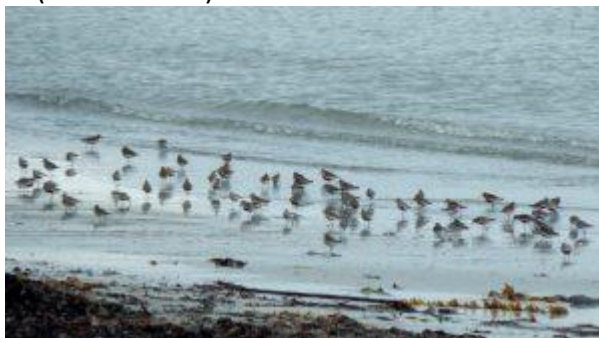
Dunlins - Vaul Bay, Tiree 23 May.

770 Ringed Plovers at Vaul/Ruaig; 8 Black-tailed Godwits at The Reef; a Common Whitethroat at Balephuill.