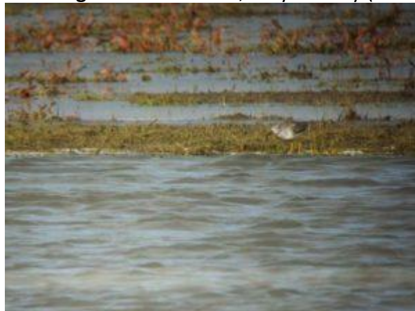
Lesser Yellowlegs – Loch Gruinart, Islay 02 May.