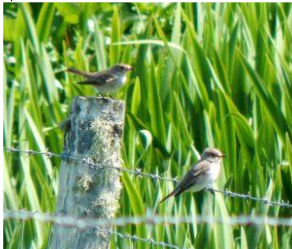
Spotted Flycatchers – Balephuill, Tiree 28 May (John Bowler).

28 May: On Tiree today: 2 female Blackcaps , a Garden Warbler and 2 Spotted Flycatchers at Balephuill; a female Blackcap , and a male Common Whitethroat at Carnan Mor; 15,000+ Manx Shearwaters feeding in enormous rafts off West Hynish towards Skerryvore (John Bowler).