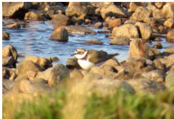
Little Ringed Plover - Loch Kinnabus, Islay 10 May (David Wood).

A Little Ringed Plover was found at Loch Kinnabus, Islay this morning. Also, Spotted Flycatchers finally made it to the Oa peninsula, with 2 around Kinnabus this morning (David Wood). Little Ringed Plovers are still rare birds in Argyll with only four previous records; the last on Islay in 2013.