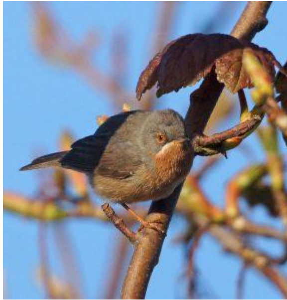
'Western' Subalpine Warbler - Kinnabus, Islay 16 May (Jim Dickson).