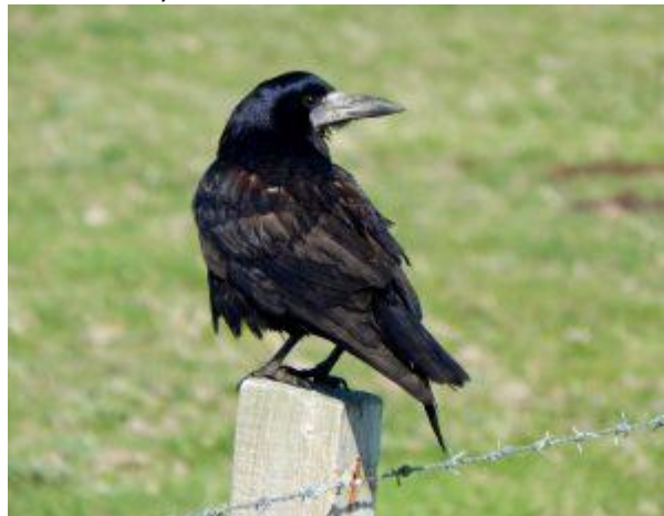
Rook – Balephuill, Tiree 09 May (John Bowler).

09 May: Lots of arrivals on Tiree today: a Common Cuckoo , 2 female Blackcaps , a male Common Whitethroat , a Grasshopper Warbler , 3 Spotted Flycatchers , a Robin and 2 Common Redpolls at Balephuill; a Wood Pigeon , a male Common Whitethroat , a Spotted Flycatcher , a Robin , a Chaffinch and 2 Common Redpolls at Carnan Mor; a Rook and a Spotted Flycatcher at Meningie; 2 Cuckoos , a Grasshopper Warbler and a Spotted Flycatcher at the Glebe, a male and female Blackcap at Cornaigmore and a juvenile Iceland Gull at Loch a' Phuill (John Bowler).