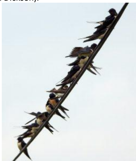
Barn Swallows – Moine Mhor, Mid-Argyll 08 May (Jim Dickson).

Near Dalvore, Moine Mhor, Mid-Argyll today: singing Common Whitethroat , Blackcaps , Sedge Warblers , Spotted Flycatcher , Common Redstart , Whinchats , Grey Wagtail , among other species and a Peregrine Falcon over the wood. No surprises on the Add Estuary/L Crinan WeBS other than 7 Whimbrels and 9 Dunlins . Canada Geese now with chicks.....also at least 80 Barn Swallows over one field at Barsloisnoch, Mid-Argyll (Jim Dickson).