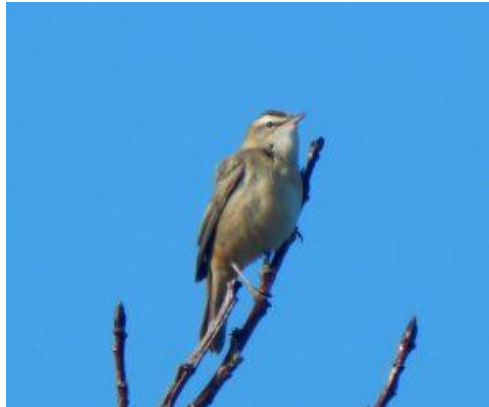
Sedge Warbler – Balephuill, Tiree 10 May (John Bowler).

11 May: An elusive Reed Warbler singing at Balephuill, Tiree this morning was only the 4th record for Tiree. Also at Balephuill: a male and 2 female Blackcaps , a Common Whitethroat , a Grasshopper Warbler and 2 Spotted Flycatchers , and at Carnan Mor; 2 Wood Pigeons and a female Blackcap . A Wood Warbler was at Meningie late in the day (John Bowler). Three Common Swifts at Connel, Mid-Argyll today (Mike Harrison).