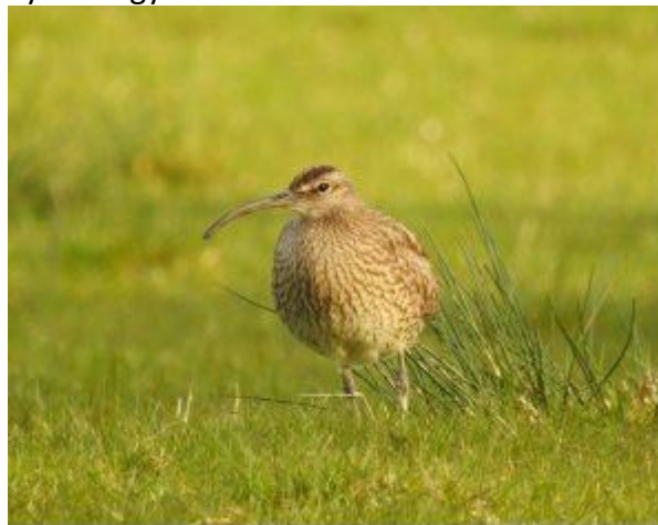
Whimbrel - Ballimeanoch, Mid-Argyll 06 May (Roger Broad).

Two very obliging Whimbrel in a field beside the road at Ballimeanoch, Loch Awe, Mid-Argyll today provided the opportunity for this photo (Roger Broad). Roger has been monitoring Osprey nests and found 'very few incubating yet and many sites either unoccupied or just a single bird seen. Unless things change for the better it is going to be a very poor year for Ospreys in Argyll'.