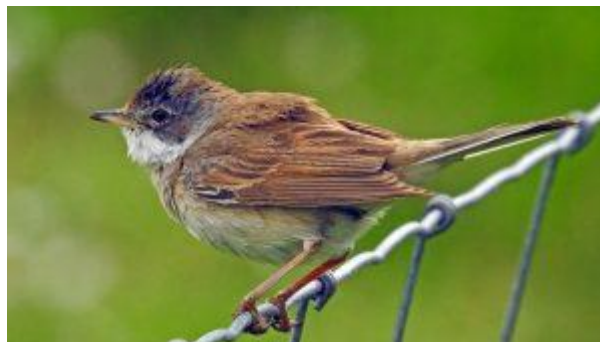
Common Whitethroat - Duntrune, Mid-Argyll 29 May (Jim Dickson).

A walk around the Duntrune gardens area (Moine Mhor), Mid-Argyll today produced several singing Common Whitethroats , Tree Pipits , Blackcaps , Garden Warbler and Redstart (Jim Dickson).