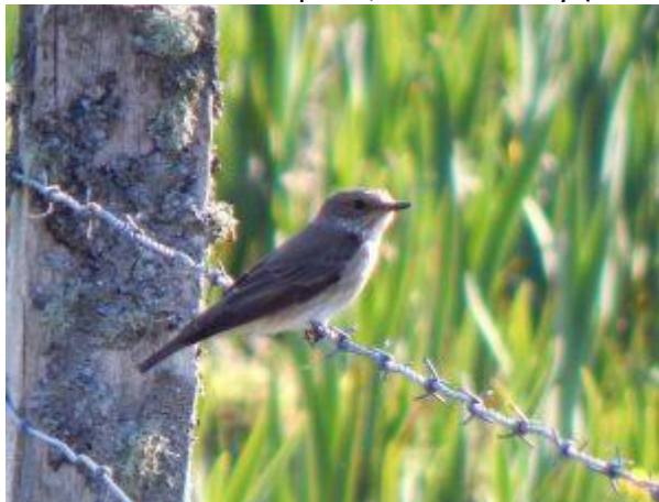
Spotted Flycatcher – Balephuill, Tiree 09 May.