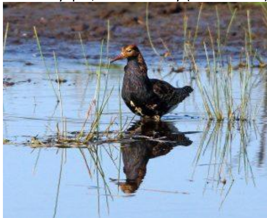
Ruff – Heylipol, Tiree 13 May.