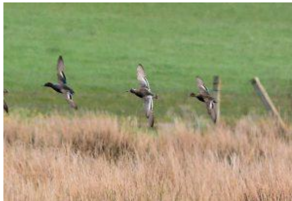
Garganey - Westport Marsh, Kintyre 03 May.

03 May: An immature Pomarine Skua was photographed flying S at MSBO this morning and the male Garganey over Westport Marsh, (nr Campbeltown), Kintyre this afternoon.