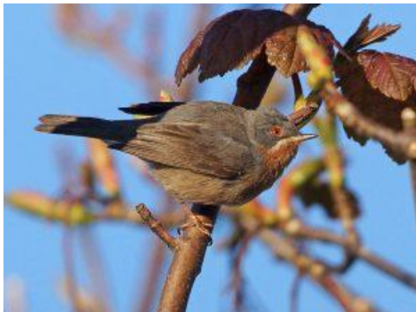
‘Western’ Subalpine Warbler - Kinnabus, Islay 16 May (Jim Dickson).

These photos of the Kinnabus, Islay ‘Western’ Subalpine Warbler were taken on the evening of 16 May by Jim Dickson: