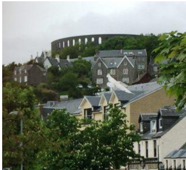
Iceland Gull - Oban, Mid-Argyll 27 May.

This Iceland Gull was caught flying around with the Herring Gulls in Oban, Mid-Argyll today.