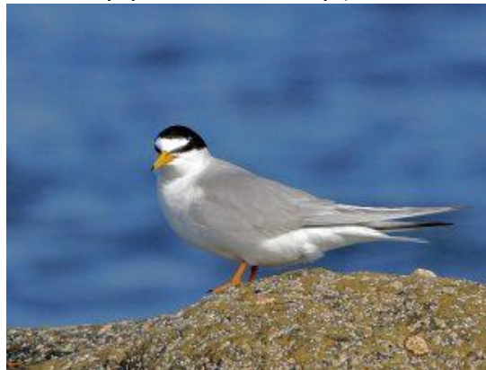
Little Tern – Tiree 13 May (Jim Dickson).