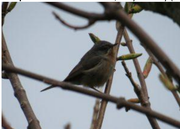
'Western' Subalpine Warbler - Kinnabus, Islay 16 May (David Wood).

On Tiree today: a juvenile Iceland Gull and a Wood Pigeon at Heylipol Church loch; a Wood Sandpiper at Loch a' Phuill (John Bowler) and a Wood Warbler at Sandaig (Trevor Wright).