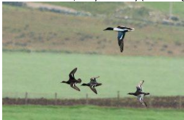
Garganey - Westport Marsh, Kintyre 03 May.