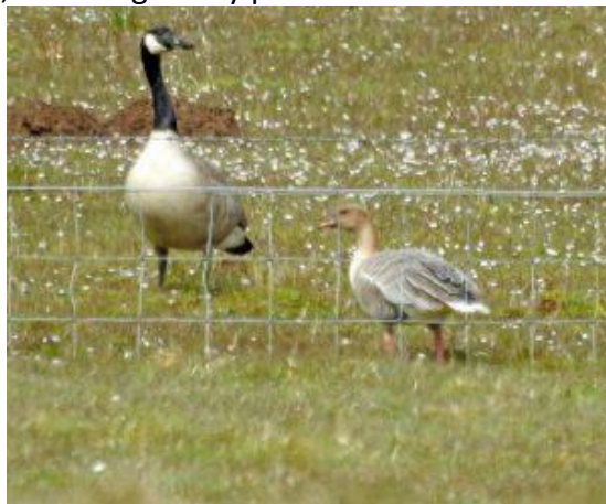
pale Pink-footed Goose – Barsloisnoch Farm, Mid-Argyll 01 May (Jim Dickson).

At Loch Gilp, Mid-Argyll this morning; a new 'batch' of Black-tailed Godwits , with 189 birds on the mud and grassy banks including 3 colour-ringed birds too distant to read. Also 4 Pale-bellied Brent Geese , 1 Dunlin , 1 Whimbrel , 1 Bar-tailed Godwit , and 4 Common Sandpipers . A total of 55 Northern Wheatears counted from Dunadd round to Drinvore/Dalvore/Barsloisnoch and the Add Estuary. Also 4 singing Whinchats , a singing Wood Warbler at Dalvore wood and 2 more singing between Bellanoch and Cairnbaan. And around Barsloisnoch Farm area, a total of 16 Whimbrels , 14 White Wagtails , and 4 Pink-footed Geese , including a very pale bird.