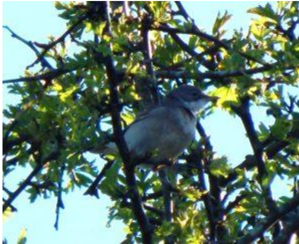
Common Whitethroat – Balephuill, Tiree 09 May.