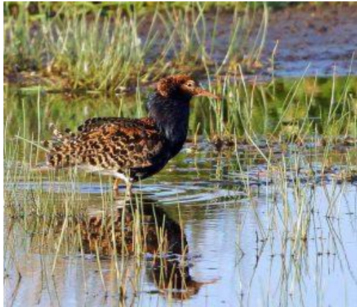
Ruff – Heylipol, Tiree 13 May.