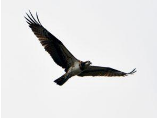
Osprey – Bellanoch Bridge, Mid-Argyll 28 May.