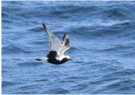
Grey Plover - MSBO, Kintyre 10 May.

A Little Ringed Plover was found at Loch Kinnabus, Islay this morning. Also, Spotted Flycatchers finally made it to the Oa peninsula, with 2 around Kinnabus this morning (David Wood). Little Ringed Plovers are still rare birds in Argyll with only four previous records; the last on Islay in 2013.