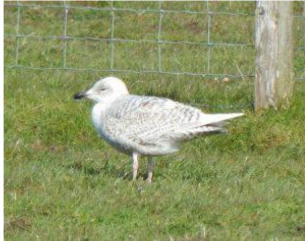
juvenile Iceland Gull - Heylipol, Tiree 03 May (John Bowler).

At Heylipol, Tiree this morning: 98 Black-tailed Godwits , a juvenile Iceland Gull and a Greenland Wheatear . Elsewhere on Tiree: female Greater Scaup still at Loch an Eilein; 4 Arctic Terns and 3 Greenland Wheatears at Sandaig; a Siskin at Balephuill in the evening (John Bowler).