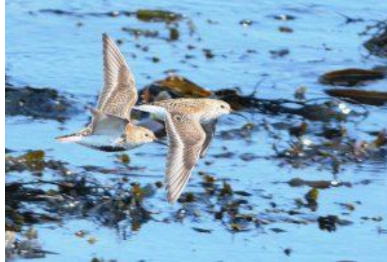
Dunlins – MSBO, Kintyre 12 May.