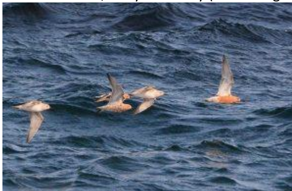
Red Knot – MSBO, Kintyre 10 May.