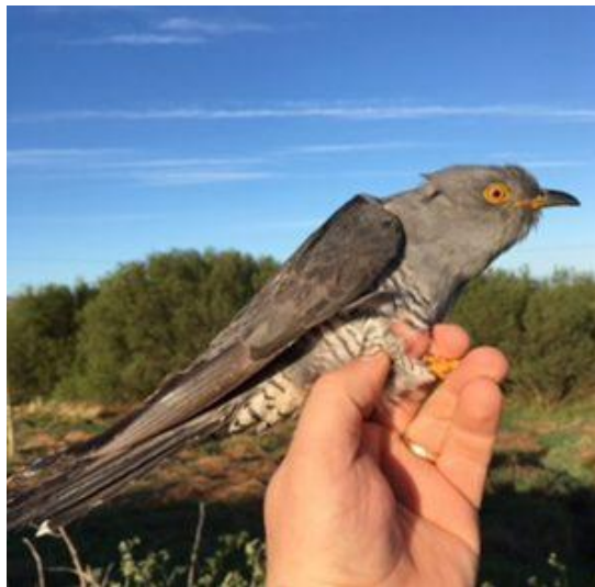
Common Cuckoo – Aros Moss, Kintyre 15 May.