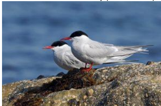
Arctic Terns – Tiree 13 May (Jim Dickson).