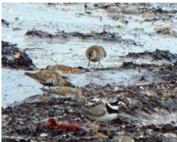
Pectoral Sandpiper - Sorobaidh Bay, Tiree 27 May (John Bowler).