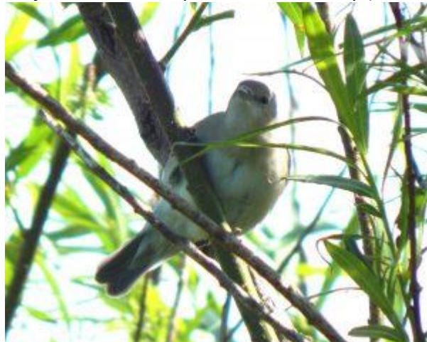
Garden Warbler – Balephuill, Tiree 28 May.