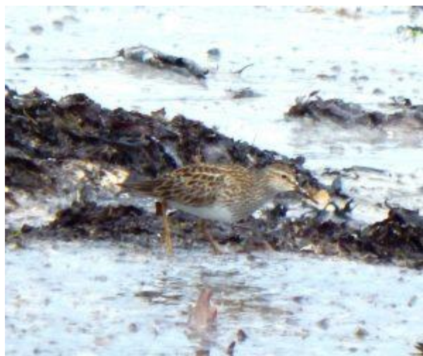
Pectoral Sandpiper - Sorobaidh Bay, Tiree 27 May.