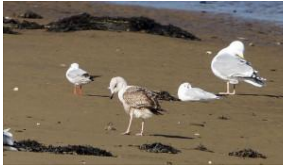
first winter Caspian Gull – Loch Gilp, Mid-Argyll 10 Mar