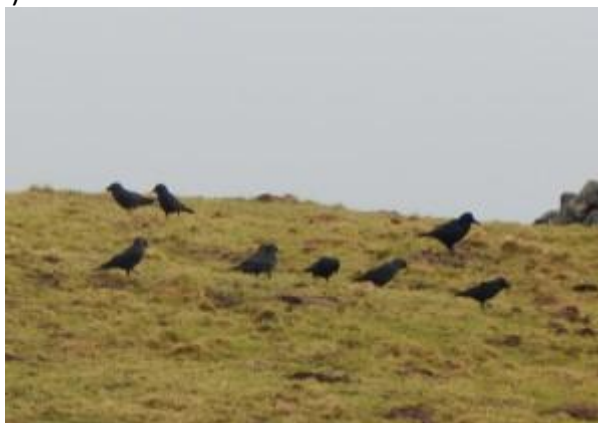
Rook and Jackdaws – Loch an Eilein, Tiree 9 Feb.