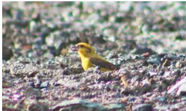
Common Crossbill – Bishops Glen, Dunoon 13 Mar.

This Common Crossbill was photographed at Bishops Glen, Dunoon today.