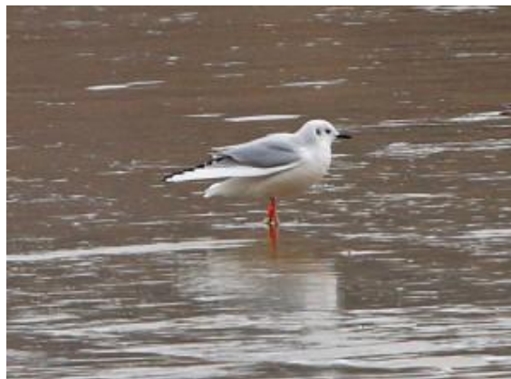
adult Bonaparte's Gull Loch Caolisport, Mid-Argyll 27 Mar (Jim Dickson).

26 March: A busy sea-watch off Aird, Tiree in NW7 winds, for 1hr at midday, produced the following (all heading W out of the Minch): 105 Fulmars , 36 Manx Shearwaters , 220 Northern Gannets , 330 Kittiwakes , 196 large auks (mostly Razorbills ) and 6 Little Auks . NB No further sign of the Bonaparte's Gull since 24 March (John Bowler).