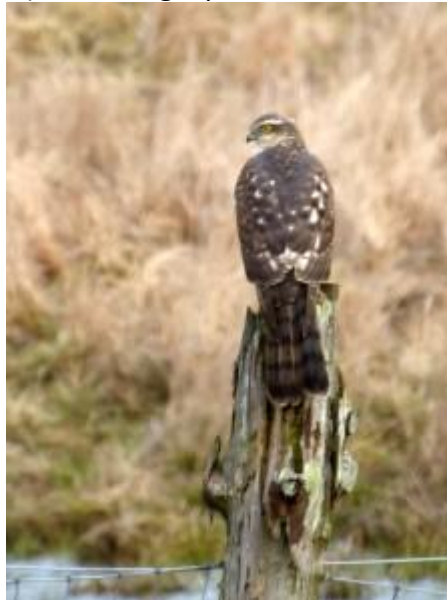
Juvenile Eurasian Sparrowhawk – Otter Ferry, Cowal 04 Feb (Tom Callan).

This juvenile Eurasian Sparrowhawk with unusual plumage was photographed in the garden at Otter Ferry, Cowal today. Also around Otter Ferry this afternoon were 43 Red-breasted Mergansers (almost all in pairs) and a single pair of Goosanders (Tom Callan).