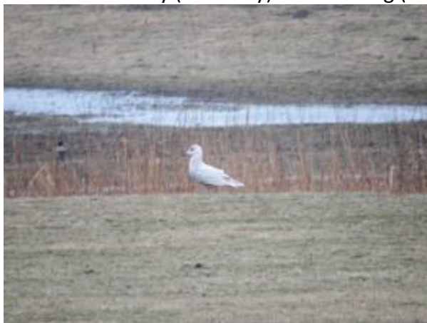
juvenile Iceland Gull Oronsay (Colonsay) 25 Feb (Morgan Vaughan).

The juvenile Iceland Gull was on Oronsay (Colonsay) this morning (Morgan Vaughan).