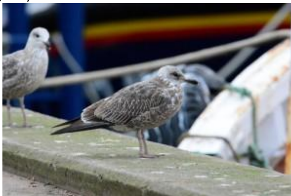
First winter Lesser Black-backed Gull Campbeltown 6 Feb (Eddie Maguire).

A 1st-winter Iceland Gull and the 1st-winter Lesser Black-backed Gull were at Campbeltown at 16:20hrs (Eddie Maguire).