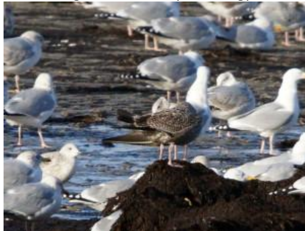
Possible American Herring Gull – Ormsary, Mid-Argyll 31 Jan.