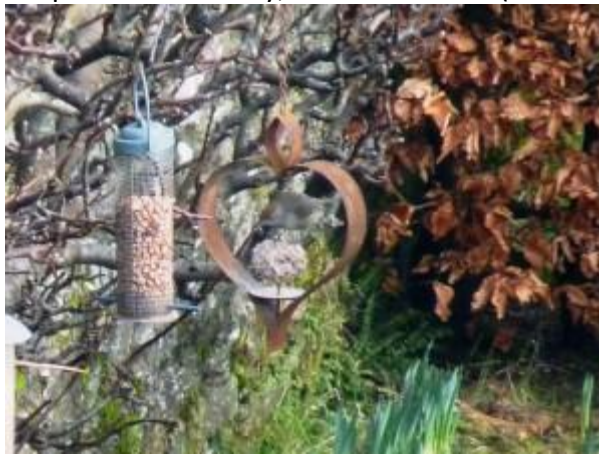
Female Blackcap – Hunters Quay, Dunoon 04 Feb (Callum Satchel).

02 February: Jim Dickson had a good look at Ormsary, Mid-Argyll late morning for the new candidate American Herring Gull but no sign unfortunately and a big drop in gull numbers there. Still present there: a juvenile /first winter Glaucous Gull , 2 juvenile Iceland Gulls and the juvenile Kumlien's Gull . And at Loch Gilp at 13:30, a second winter Mediterranean Gull and an adult Little Gull .