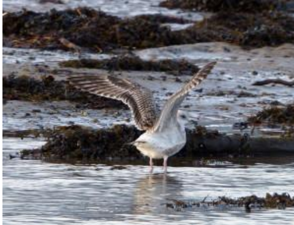
First-winter Caspian Gull Loch Gilp, Mid-Argyll 17 Jan.