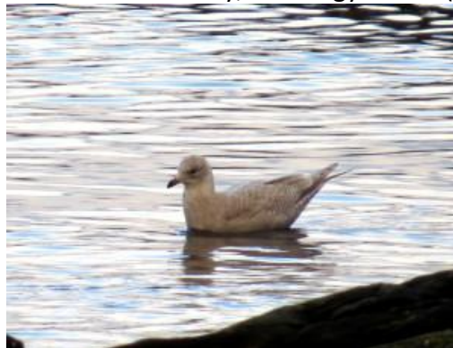
Juvenile Kumlien's Gull Ormsary, Mid-Argyll 6 Jan.