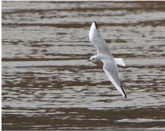
adult Bonaparte's Gull Loch Caolisport, Mid-Argyll 27 Mar.