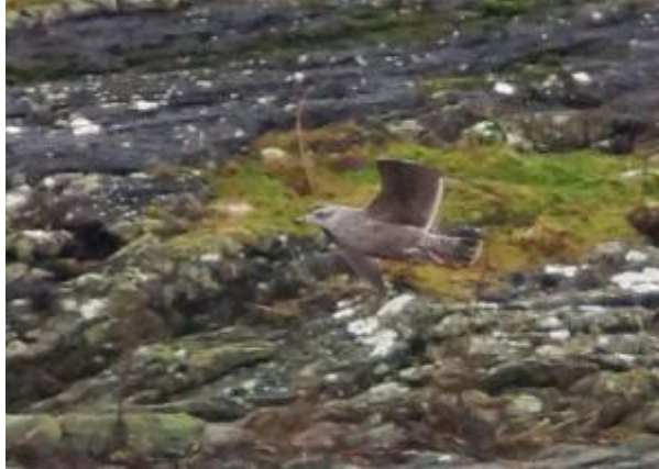
American Herring Gull Ormsary, Mid-Argyll 01 January (Jim Dickson)

The juvenile Kumlien's Gull was still there and the single Lesser Black-backed Gull. Fewer gulls at Loch Gilp this afternoon but 2, possibly 3 adult Little Gulls were present.