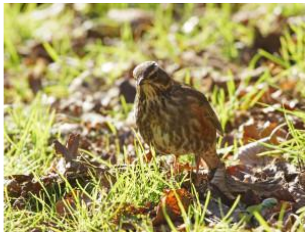
Icelandic Redwing – Loch Gilp, Mid-Argyll 10 Mar (Jim Dickson)

09 March: Lots more Lesser Black-backed Gulls in today it appears, with 27 in a field at Drimvore (Moine Mhor), Mid-Argyll (Jim Dickson).