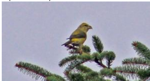
Common Crossbill – Bishops Glen, Dunoon 14 Feb (Alistair McGregor ).

The first winter (female) Caspian Gull was showing well today at the head of Loch Gilp from 11:00 until 14:00 at least (Jim Dickson).