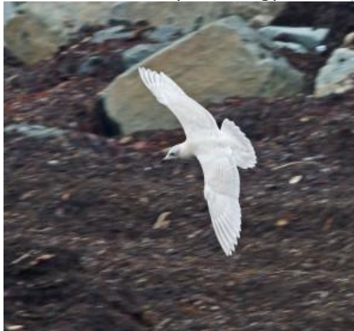
Kumlien's Gull Ormsary, Mid-Argyll 4 Jan.