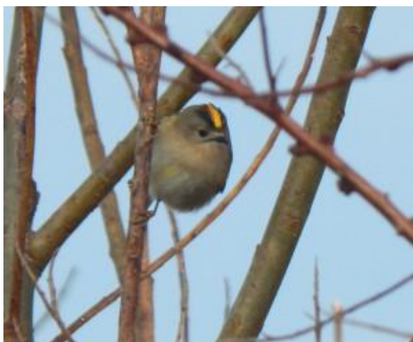
Goldcrest – Balephuill, Tiree 17 Mar.