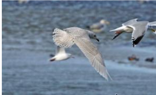
Juvenile Iceland Gull – Ormsary, Mid-Argyll 31 Jan.