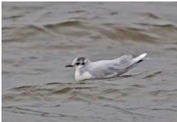
adult Little Gull – Loch Gilp, Mid-Argyll 18 Feb.