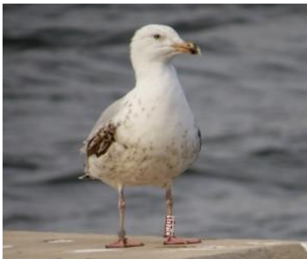
colour-ringed Herring Gull – Campbeltown Pier 25 Mar (John Nadin).

Four first winter Iceland Gulls at Campbeltown Loch today (2 pale birds & 2 biscuit coloured birds). Also 2 male Northern Wheatears at Machrihanish and a colour-ringed Herring Gull (white ring with red letters 1D7-C ) on Campbeltown pier (John Nadin and Mark Wood).