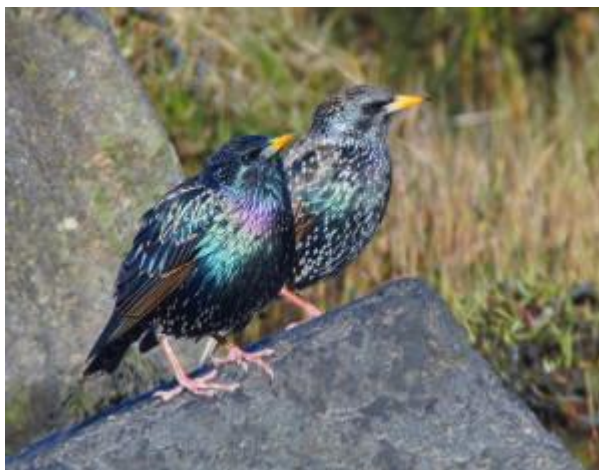
Common Starlings – Loch Gilp, Mid-Argyll 21 Mar.

This handsome pair of Common Starlings in breeding plumage were photographed at Loch Gilp, Mid-Argyll today.