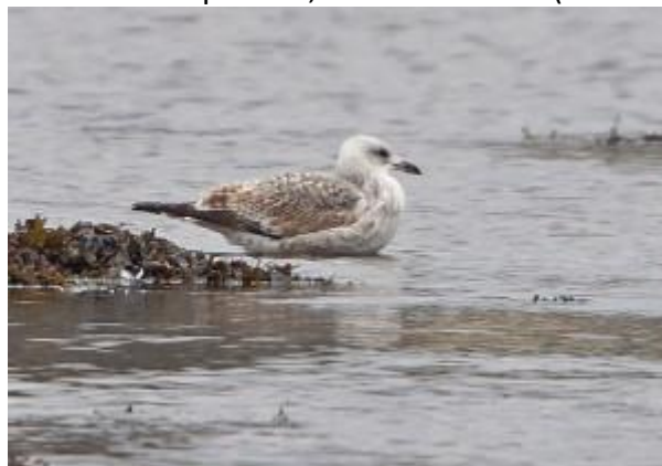
First winter Caspian Gull – Loch Gilp, Mid-Argyll 14 Feb (Jim Dickson).