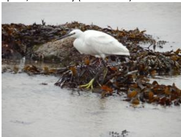
Little Egret Oronsay (Colonsay) 9 Jan.