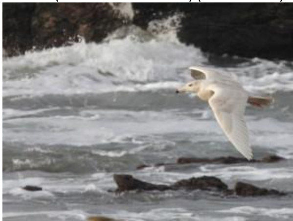
Glaucous Gull Bellochantuy, Kintyre 13 Jan (Chris Bradshaw).

The goose count for the East end of Tiree today found: the juvenile Glaucous Gull again at the Reef, an immature/female Common Scoter in Gunna Sound, 25 Fieldfares at Milton, 6 Fieldfares and 3 Goldfinches at Gott Tip. Approx. 300 Redwings were seen around the eastern half of the island alone (cold weather influx?) (John Bowler).