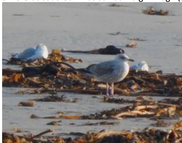
Colour-ringed first winter Herring Gull "4D2C" Sorobaidh Bay, Tiree 26 Jan(John Bowler).

26 January: A colour-ringed first winter Herring Gull "4D2C" was found at Sorobaidh Bay, Tiree today and the juvenile Glaucous Gull was still at Traigh Bhagh (John Bowler).