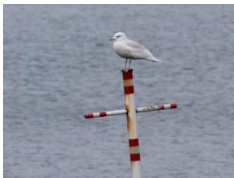
Iceland Gull – Oban Bay 22 Mar.