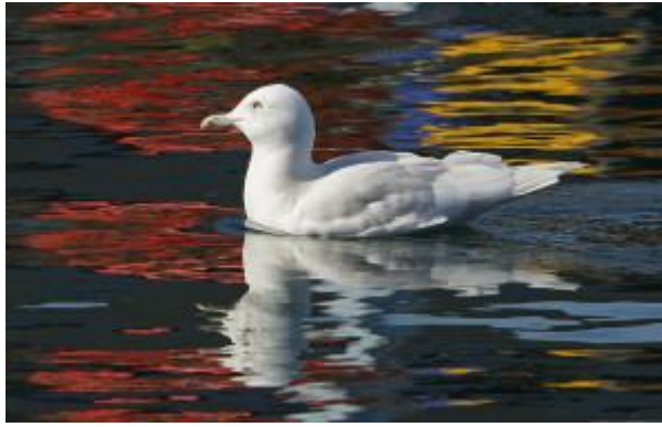
Iceland Gull – Oban Bay, Mid-Argyll 25 Mar.