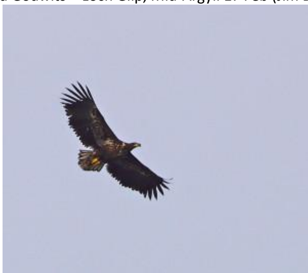
Juvenile White-tailed Eagle – Loch Gilp, Mid-Argyll 17 Feb.

16 February: Most of the mainland Argyll WeBS Counts for February 2015 are now in. Notable counts included 156 Greylag Geese at Loch Etive, 200 Greater Canada Geese at Loch Creran, 121 Eurasian Teal on Holy Loch, good numbers of Common Goldeneye everywhere including 24 at Loch Etive, 6 Goosanders at Loch Etive and 7 at Loch Tulla, 6 Great Northern Diver and a Black-throated Diver and 5 Slavonian Grebes at Kilfinan Bay, 42 Grey Herons at Loch Etive, a White-tailed Eagle at Loch Craignish, 16 Common Snipe at Loch Etive and 234 Oystercatchers, 28 Dunlin and 20 Bar-tailed Godwit at Loch Gilp.