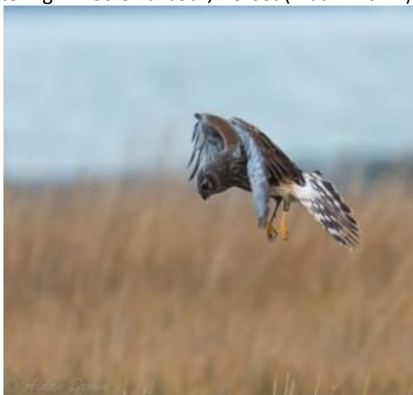
Cowal Hen Harrier at Poole harbour, Dorset 02 Jan.