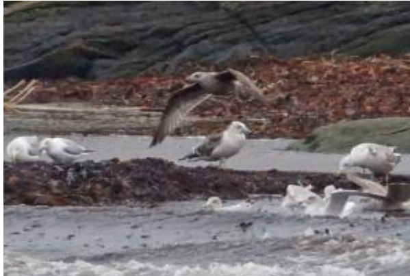
American Herring Gull Ormsary, Mid-Argyll 01 January