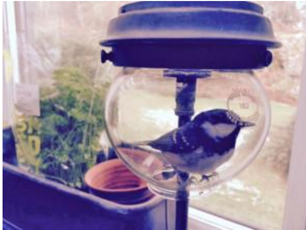
Coal Tit in lamp 5 Feb (Patricia Russell).

04 February: On Tiree, a group of 15 Great Northern Divers and 3 Red-throated Divers were in Sorobaidh Bay and an adult Black-headed Gull at Gott Bay (John Bowler).