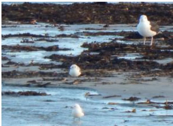
first winter Bonaparte's Gull (centre of photo) – Sorobaidh Bay, Tiree 24 Mar (John Bowler).

Coming out of the Co-op in Lochgilphead at 18:15 Jim noted 42 Whooper Swans going N overhead (Jim Dickson).