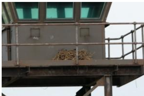
Common Raven on nest – Campbeltown Airport, Kintyre 06 Mar (Eddie Maguire).

05 March: A first winter Iceland Gull was at Campbeltown today. Also today: 108 Eurasian Wigeon , single drake Pintail (sleeping) and 2 adult Lesser Black-backed Gulls on floodwater at Strath Farm, The Laggan, Kintyre (Eddie Maguire).