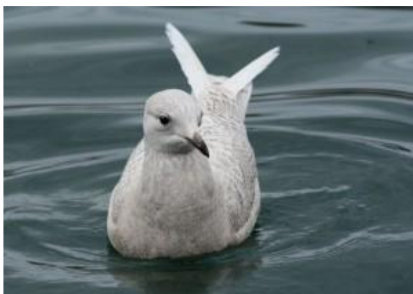
First winter Iceland Gull – Campbeltown 06 Mar (Eddie Maguire).

04 March: A pair of Common Crossbills were sitting on top of a pine tree in a conifer plantation at Colintrave, Cowal today (Graham Clarke).