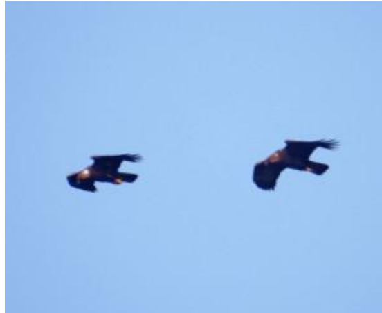
Golden Eagles Oronsay (Colonsay) 12 Jan.

A pair of Golden Eagles were circling over Oronsay this afternoon.