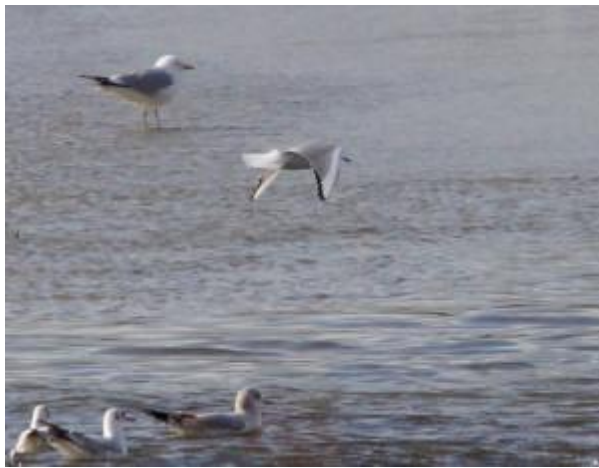
Bonaparte's Gull – Ormsary (fish farm), Mid-Argyll 26 Mar