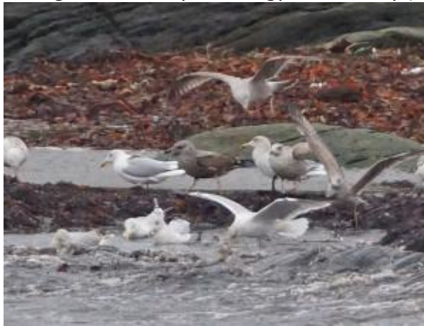
American Herring Gull Ormsary, Mid-Argyll 01 January