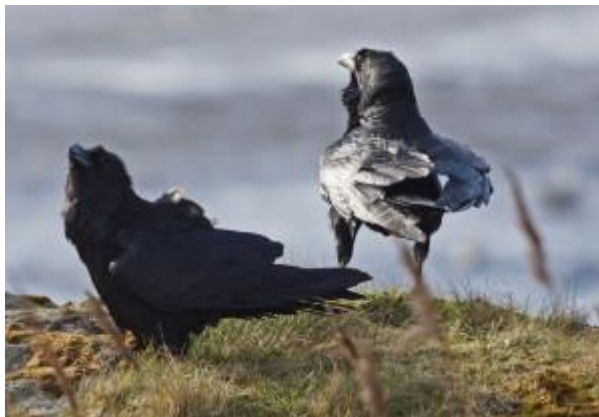
Ravens- Ormsary (fish farm), Mid-Argyll 26 Mar (Jim Dickson)

25 March: The Iceland Gull was showing well in Oban Bay. Jim still thinks this bird is not fully adult as has remnants of a bar near the bill tip and no red gonys spot and the orbital ring is not yet red....so would suggest third-summer or even fourth-summer as some individual gulls take longer to reach full adult.....anyway a nice bird. Three Greenshanks at the head of Loch Feochan, Mid-Argyll and 8 Greenland White-fronted Geese still at