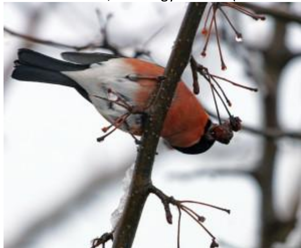
Bullfinch Cairnbaan, Mid-Argyll 13 Jan.