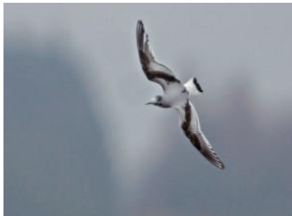
first winter Little Gull – Loch Gilp, Mid-Argyll 18 Feb.

Common Goldeneye, one Little Grebe, 29 Western Jackdaws and a Mistle Thrush.