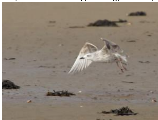
First winter Caspian Gull – Loch Gilp, Mid-Argyll 14 Feb (Jim Dickson).