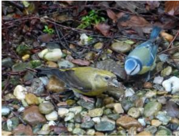
Female Common Crossbill Otter Ferry, Cowal 11 Jan (Tom Callan).

11 January: The first winter male Ring-necked Duck again at Loch a' Phuill, Tiree today and an immature Pomarine Skua heading NW of West Hynish at 14:10hrs (John Bowler). A female Common Crossbill was foraging on the gravel path at Otter Ferry, Cowal this morning. Also up to 70 or so Common Chaffinches around the feeders – the vast majority males. A solitary Dolphin first noticed during July 2014 is still resident by the red navigation buoy off Glas Eilean (Loch Fyne) by Port Ann (Otter Ferry Narrows) (Tom Callan).