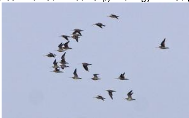
Bar-tailed Godwits – Loch Gilp, Mid-Argyll 17 Feb.