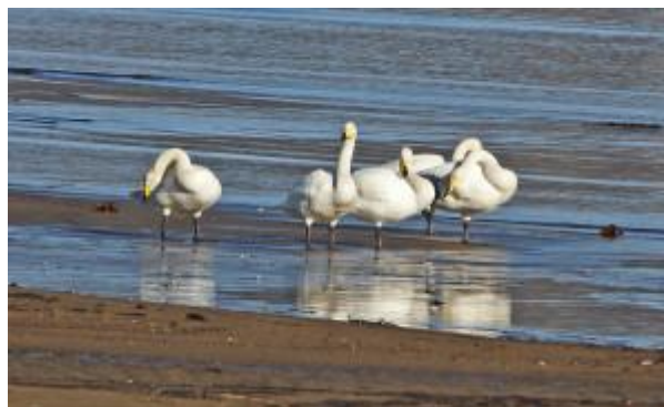
Whooper Swans – Loch Crinan, Mid-Argyll 13 Mar.

Eight Whooper Swans flew into Loch Crinan today, one of the local Mute Swans wandered up and joined them for a bit- probably curious.