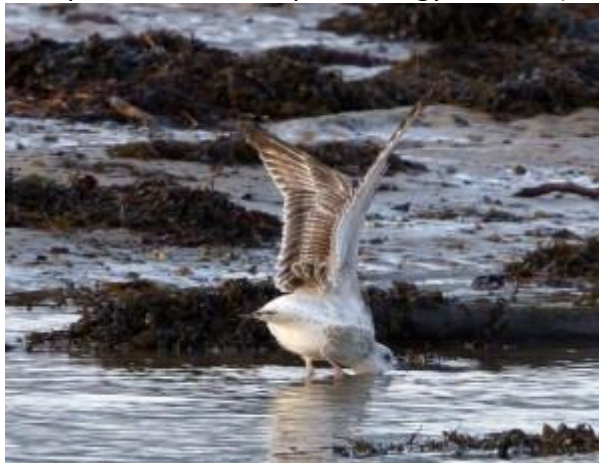
First-winter Caspian Gull Loch Gilp, Mid-Argyll 17 Jan.