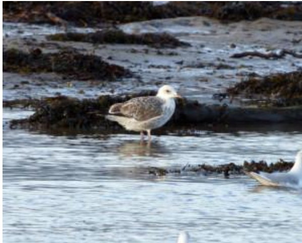
First-winter Caspian Gull Loch Gilp, Mid-Argyll 17 Jan.