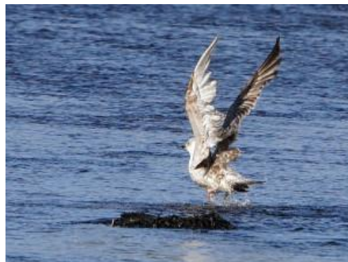
first winter Caspian Gull – Loch Gilp, Mid-Argyll 10 Mar