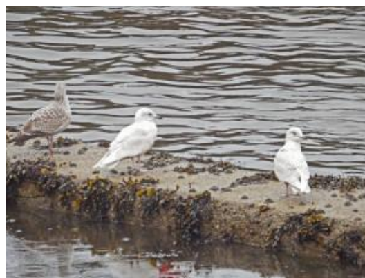
juvenile Iceland Gulls – Oban Bay, Mid-Argyll 12 Mar (Morgan Vaughan).

Two juvenile Iceland Gulls were in Oban Bay today (Morgan Vaughan).