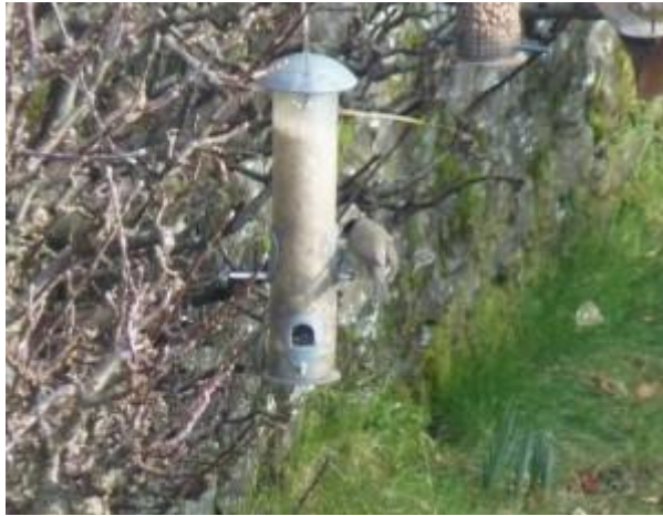
Male Blackcap – Hunters Quay, Dunoon 04 Feb (Callum Satchel).