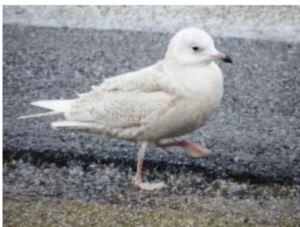
Juvenile Iceland Gull – Colonsay 3 Mar.