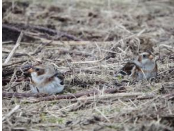
Snow Buntings – Oronsay 13 Feb (Morgan Vaughan).

A walk around Oronsay this morning revealed: 13 Greenland White-fronted Geese , 1,403 Barnacle Geese (minimum), 156 European Golden Plovers, 112 Northern Lapwings, one Greenshank, 30 Curlews, a Black Guillemot (in summer plumage, off west coast), 58 Twite and two Snow Buntings (Morgan Vaughan).