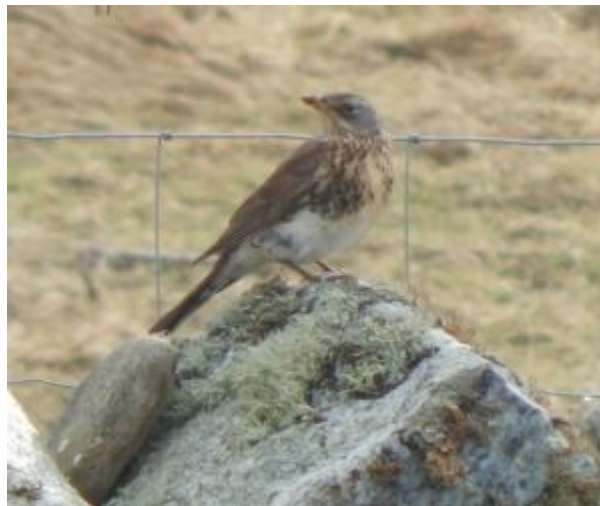
Fieldfare West Hynish, Tiree 24 Jan.

Three Snow Buntings and precisely 352 Common Starlings on Oronsay today.