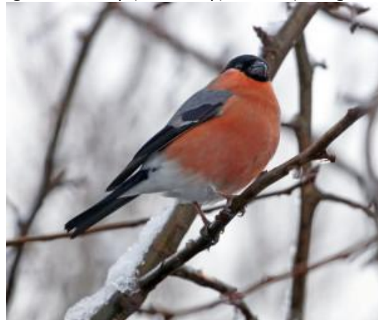
Bullfinch Cairnbaan, Mid-Argyll 13 Jan.