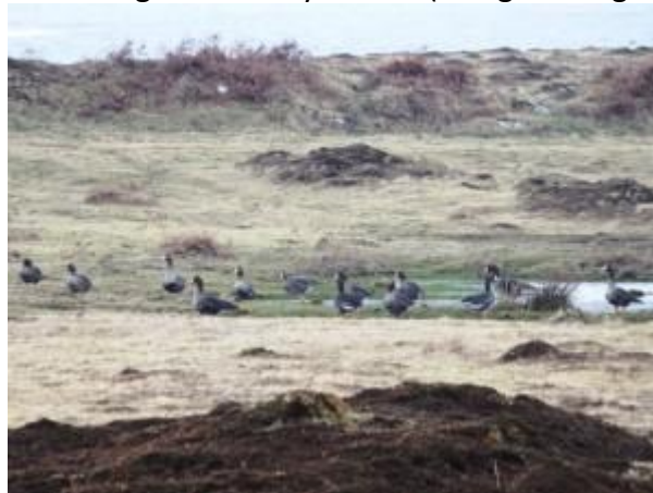
Greenland White-fronted Geese – Oronsay 13 Feb (Morgan Vaughan).

12 February: On Tiree today: 2 juvenile Glaucous Gulls at Traigh Bhagh; 10 Fieldfares and 60 Redwings at Crossapol Point (John Bowler).