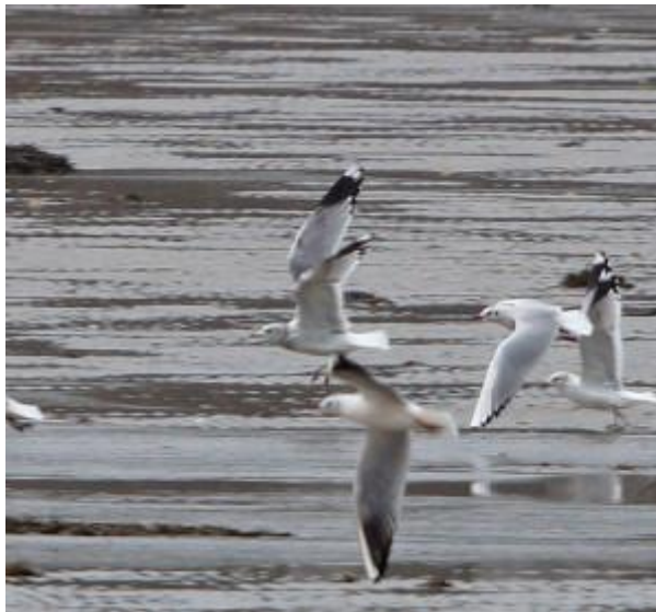
Possible Russian' Common Gull ( L. c. heinei ) – Loch Gilp 17 Feb (Jim Dickson).

17 February: No sign of the Caspian Gull at Loch Gilp today but may just have been hanging about the landfill site. Much disturbance there when a juvenile White-tailed Eagle went over: it circled a few times then headed N over Lochgilphead. Also there was a colour-ringed second winter Common Gull ( Yellow 2A32 looks like a Scottish bird). A second winter Mediterranean Gull and 21 Bar-tailed Godwits were also present, as well as male and female Sparrowhawks over the loch. A male Sparrowhawk was chasing Chaffinches in the garden at Cairnbaan (Jim Dickson).