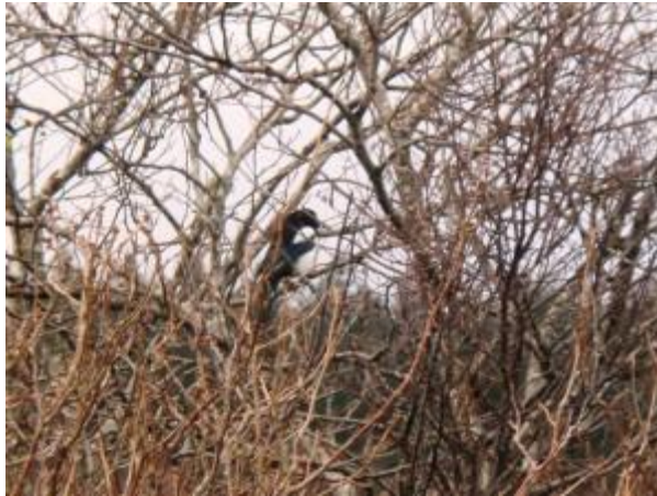
Magpie – Kilmichael Glen, Mid-Argyll 21 Feb

20 February: On Tiree today: 12 adult Black-headed Gulls and a juvenile Lesser Black-backed Gull at Sorobaidh Bay at lunchtime. Also 5 Chaffinches at Balephuill (John Bowler).