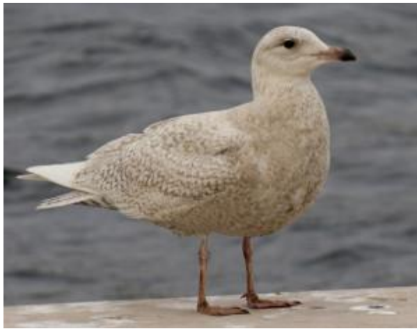
first winter Iceland Gull – Campbeltown Loch 25 Mar.

24 March: A first winter Bonaparte's Gull was found at Sorobaidh Bay, Tiree this afternoon: a juvenile Glaucous Gull was there too.