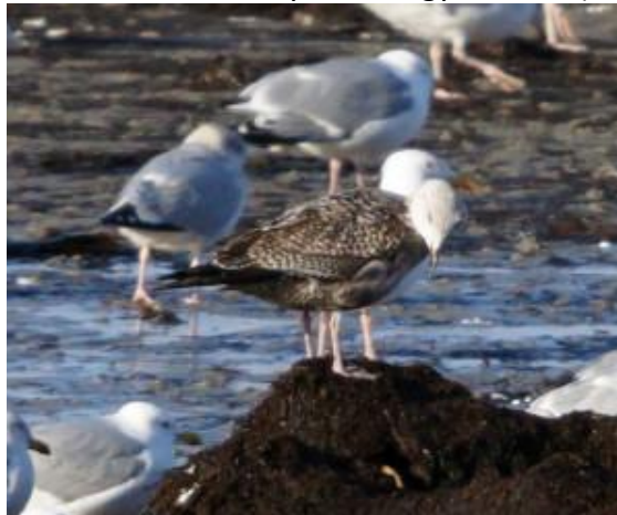
Possible American Herring Gull – Ormsary, Mid-Argyll 31 Jan.