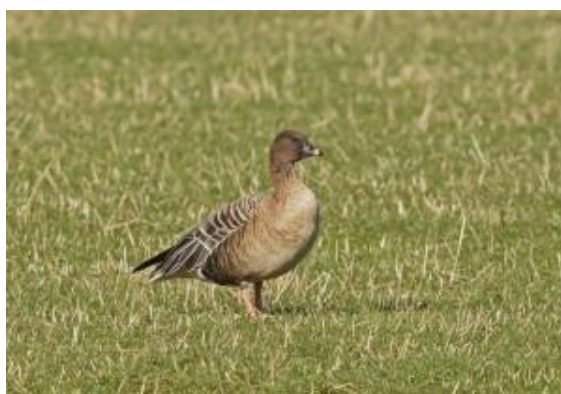
Pink-footed Goose – Barsloisnoch (Moine Mhor), Mid-Argyll 15 Mar (Jim Dickson).

A single Pink-footed Goose near Barsloisnoch (Moine Mhor), Mid-Argyll today in with at least 250+ Greylag Geese (Jim Dickson).