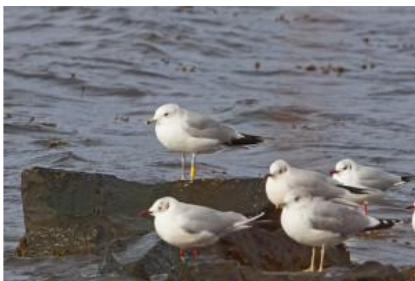
Colour-ringed Common Gull – Loch Gilp, Mid-Argyll 17 Feb.