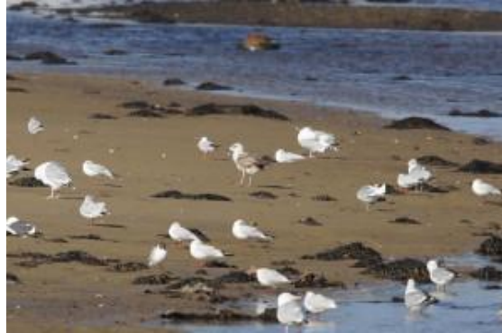
first winter Caspian Gull – Loch Gilp, Mid-Argyll 10 Mar.