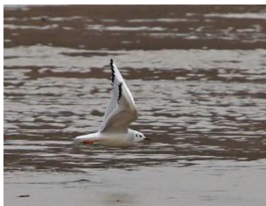
adult Bonaparte’s Gull Loch Caolisport, Mid-Argyll 27 Mar (Jim Dickson).

A large Golden Eagle was seen soaring low over Achnacarron (N Loch Awe), Mid-Argyll in the direction of the village of Kilchrenan at around 10:40 today. It had been seen the previous day (26 Mar), at around 14:30, chasing Greater Canada Geese on Loch Awe, just off Achnacarron/Ardbrecknish (Ken Williams).