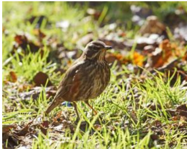
Icelandic Redwing – Loch Gilp, Mid-Argyll 10 Mar