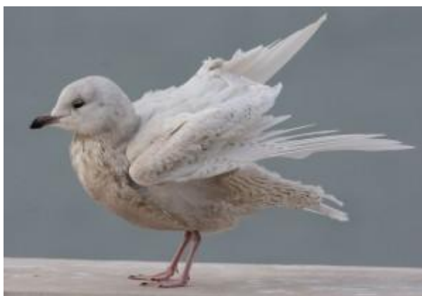
juv Iceland Gull Campbeltown Harbour 3 Mar 15 (Eddie Maguire).

02 March: An adult Iceland Gull at Ormsary fish-farm, Mid-Argyll today was a new arrival. The four juvenile Iceland Gulls , second winter Iceland Gull , juvenile Kumlien's Gull and juvenile Glaucous Gull are all still there (Stu Crutchfield).