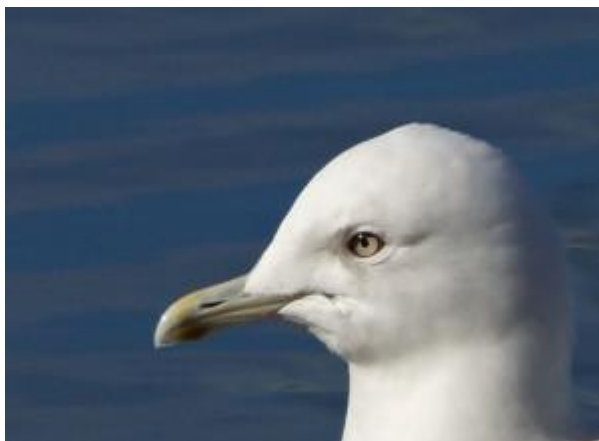
Iceland Gull – Oban Bay, Mid-Argyll 25 Mar.