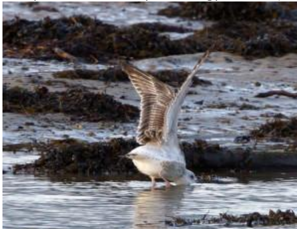
First-winter Caspian Gull Loch Gilp, Mid-Argyll 17 Jan.