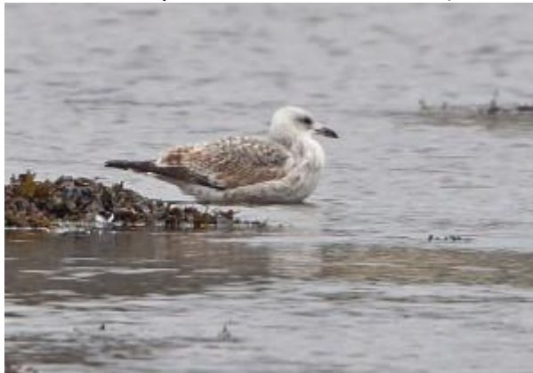
First winter Caspian Gull – Loch Gilp, Mid-Argyll 14 Feb (Jim Dickson).