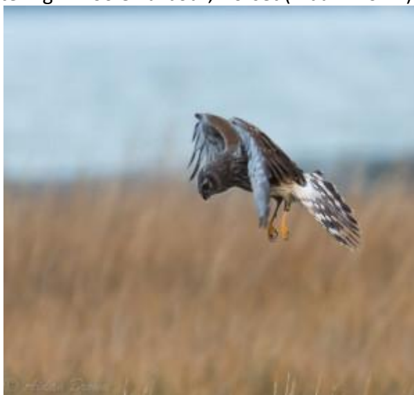
Cowal Hen Harrier at Poole harbour, Dorset 02 Jan.