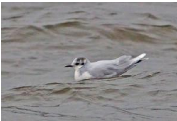
adult Little Gull – Loch Gilp, Mid-Argyll 18 Feb.