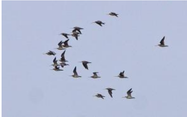
Bar-tailed Godwits – Loch Gilp, Mid-Argyll 17 Feb.