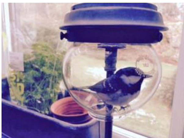
Coal Tit in lamp 5 Feb (Patricia Russell).

04 February: On Tiree, a group of 15 Great Northern Divers and 3 Red-throated Divers were in Sorobaidh Bay and an adult Black-headed Gull at Gott Bay (John Bowler).