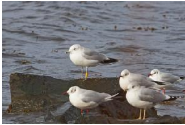
Colour-ringed Common Gull – Loch Gilp, Mid-Argyll 17 Feb.