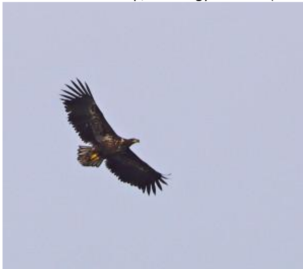
Juvenile White-tailed Eagle – Loch Gilp, Mid-Argyll 17 Feb.

16 February: Most of the mainland Argyll WeBS Counts for February 2015 are now in. Notable counts included 156 Greylag Geese at Loch Etive, 200 Greater Canada Geese at Loch Creran, 121 Eurasian Teal on Holy Loch, good numbers of Common Goldeneye everywhere including 24 at Loch Etive, 6 Goosanders at Loch Etive and 7 at Loch Tulla, 6 Great Northern Diver and a Black-throated Diver and 5 Slavonian Grebes at Kilfinan Bay, 42 Grey Herons at Loch Etive, a White-tailed Eagle at Loch Craignish, 16 Common Snipe at Loch Etive and 234 Oystercatchers, 28 Dunlin and 20 Bar-tailed Godwit at Loch Gilp.