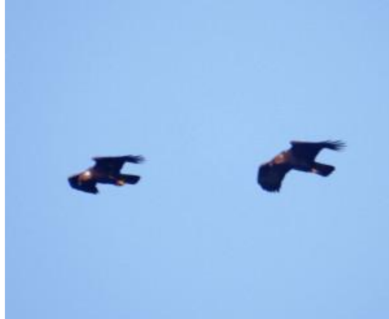
Golden Eagles Oronsay (Colonsay) 12 Jan.

A pair of Golden Eagles were circling over Oronsay this afternoon.