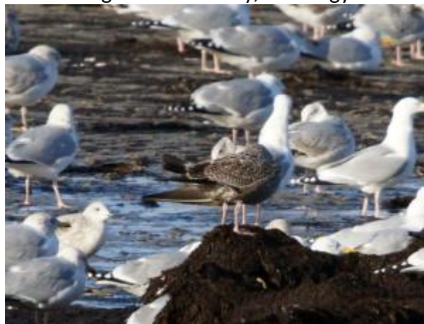
Possible American Herring Gull – Ormsary, Mid-Argyll 31 Jan.