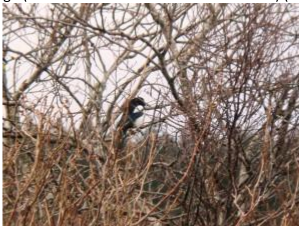
Magpie – Kilmichael Glen, Mid-Argyll 21 Feb