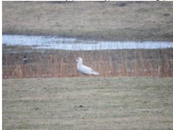
juvenile Iceland Gull Oronsay (Colonsay) 25 Feb (Morgan Vaughan).

The juvenile Iceland Gull was on Oronsay (Colonsay) this morning (Morgan Vaughan).