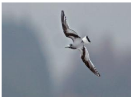
first winter Little Gull – Loch Gilp, Mid-Argyll 18 Feb.

Common Goldeneye, one Little Grebe, 29 Western Jackdaws and a Mistle Thrush.