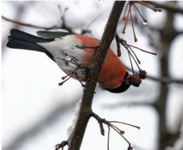
Bullfinch Cairnbaan, Mid-Argyll 13 Jan.