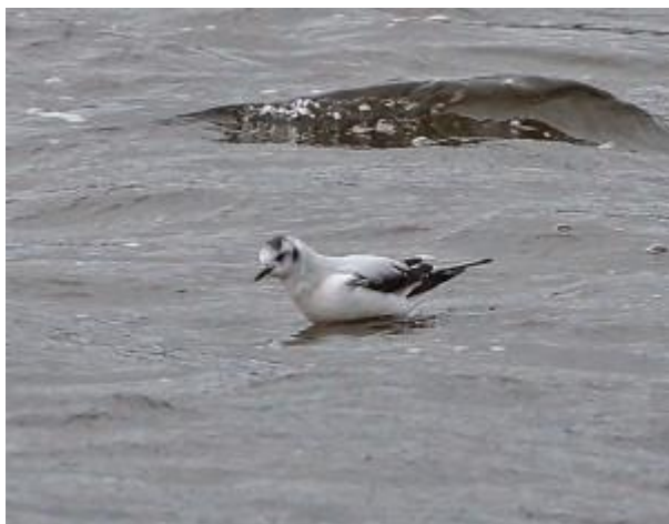
first winter Little Gull – Loch Gilp, Mid-Argyll 18 Feb.