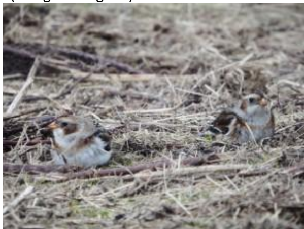
Snow Buntings – Oronsay 13 Feb (Morgan Vaughan).

A walk around Oronsay this morning revealed: 13 Greenland White-fronted Geese , 1,403 Barnacle Geese (minimum), 156 European Golden Plovers, 112 Northern Lapwings, one Greenshank, 30 Curlews, a Black Guillemot (in summer plumage, off west coast), 58 Twite and two Snow Buntings (Morgan Vaughan).