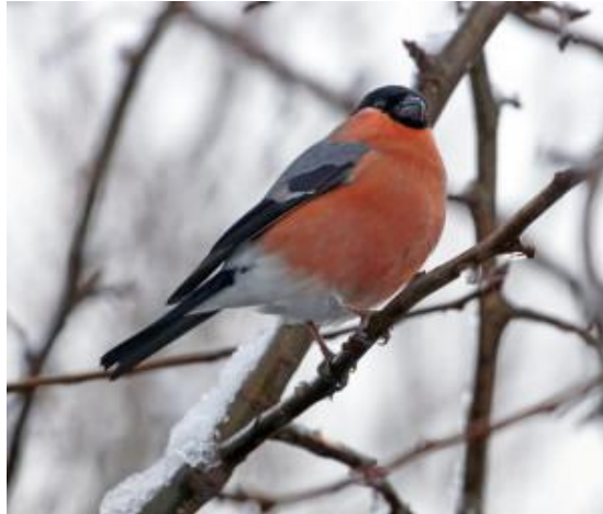
Bullfinch Cairnbaan, Mid-Argyll 13 Jan.