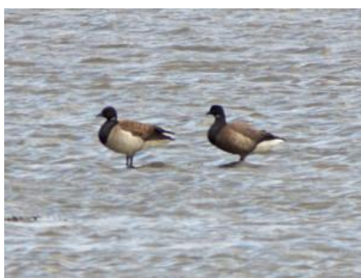
Pale-bellied Brent Goose & Dark-bellied Brent Goose – Loch Gilp, Mid-Argyll 26 Apr.