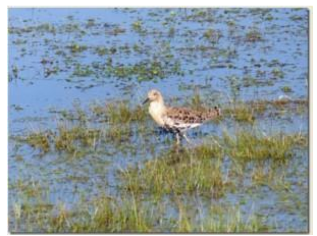
Ruff – Oronsay, Colonsay 14 May.