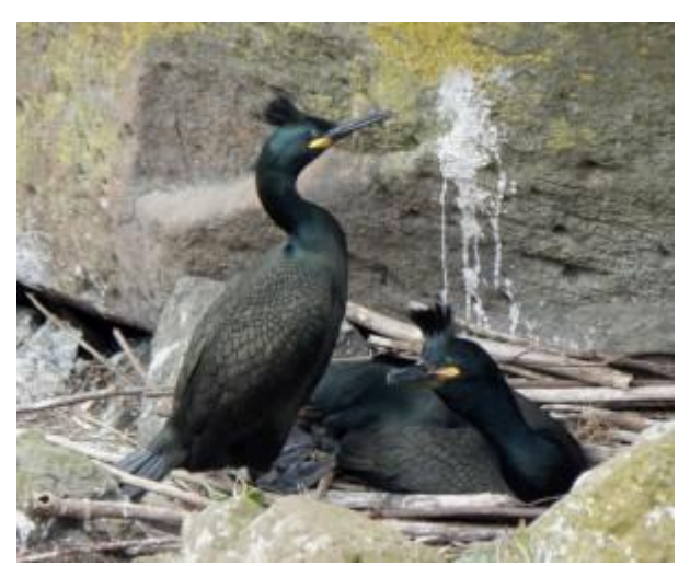
Shags – Lunga, Treshnish Isles 24 Apr.