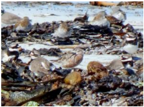
Curlew Sandpiper – Vaul Bay, Tiree 14 May.