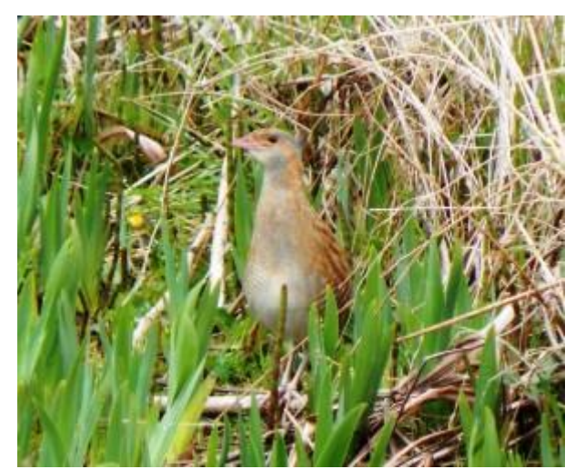
Corn Crake - Tiree 04 May (John Bowler).

03 May: On Tiree today: a Green Sandpiper on floods at Balephuil in the rain was initially in the car park! Also, a Tree Sparrow and 8 Collared Doves in the garden at Balephuil, a Curlew Sandpiper (not in breeding plumage) and a Dunlin at Loch a' Phuill, 10 Arctic Terns at Sorobaidh Bay and a female Blackca p at Meningie (John Bowler).