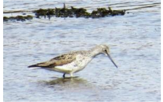
Greenshank – Add Estuary, Mid-Argyll 08 Apr.