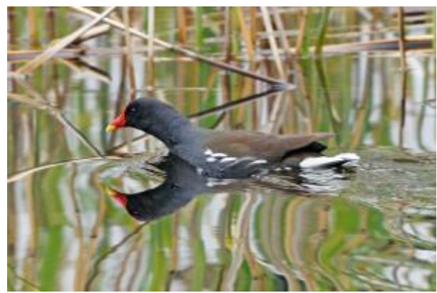
Moorhen – Bellanoch, Mid-Argyll 27 May (Jim Dickson).

Jim checked out the report of a possible singing Greenish Warbler at Bellanoch, Mid-Argyll today. It turned out to be a Willow Warbler , probably of the pale N Fenno-Scandian race acredula . The white throat, lack of yellow on the underparts and stunted song (less melodic than usual for Willow Warbler) all fit acredula . A single Moorhen was also there (Jim Dickson).