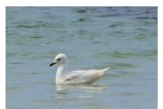
2nd calendar year Iceland Gull – Iona, Mull.