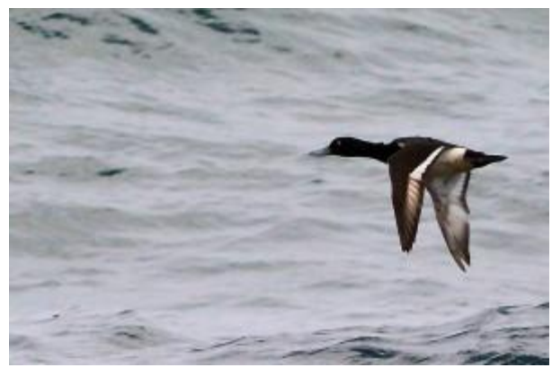
Tufted Duck – MSBO, Kintyre 02 Jun (Eddie Maguire).

Meanwhile at Machrihanish Seabird Observatory today an Arctic Skua (dark adult) was present all day, mainly targeting the Sandwich Terns (20+ present). Also a drake Tufted Duck flying south early afternoon (a very scarce passage visitor here). And in Campbeltown, roof nesting Herring Gulls were busy: three nests with incubating adults included one in Davaar Avenue and two in Albyn Avenue (Eddie Maguire).