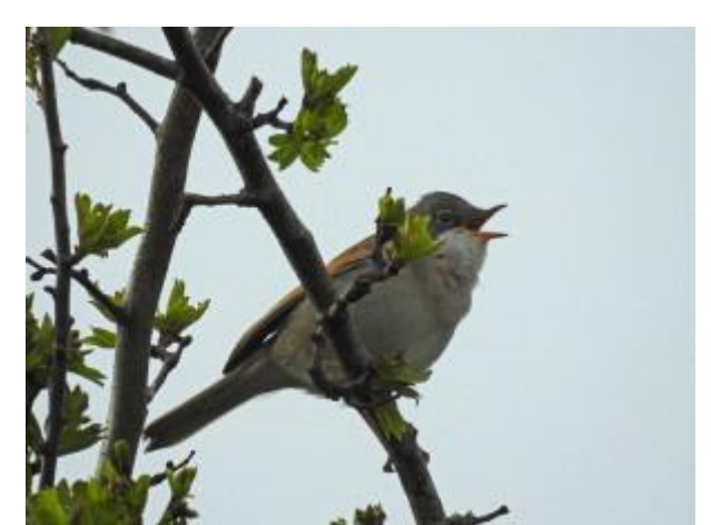
Common Whitethroat - Crinan Ferry, Mid-Argyll 13 May (Jim Dickson).

12 May: Four Long-tailed Skuas and a first-winter Glaucous Gull were flying past Keillmore (Sound of Jura), Mid-Argyll this evening (Alan Lauder).