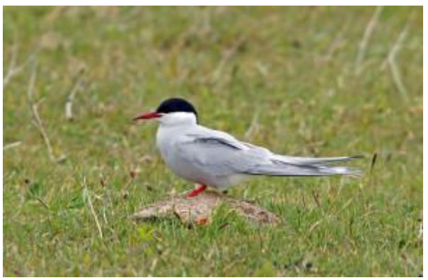
Arctic Tern – Tiree 22 May (Jim Dickson).