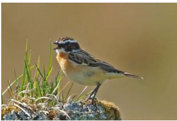
Whinchat - Dalvore (Moine Mhor), Mid-Argyll 14 May.

The last Barnacle Goose left on Oronsay was taken by a White-tailed Eagle today. The eagle departed in the direction of Islay at around 15:30. And, in the evening, a Ruff moulting into breeding plumage was on the south end pools.