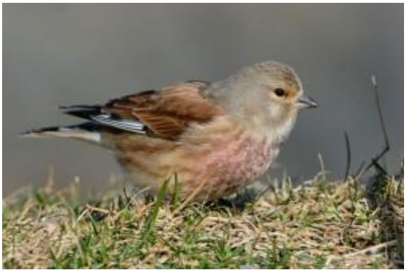
Linnet – MSBO, Kintyre 09 Apr