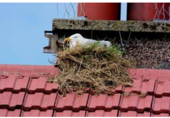
Nesting Herring Gull – Campbeltown, Kintyre 02 Jun.