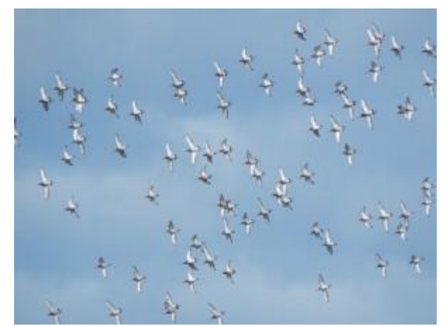
Black-tailed Godwits - West Tiree 28 Apr (John Bowler).

On Tiree today, a Stock Dove seen briefly at Balephuil this afternoon was John's first on the island in 14 years. Also a big influx of Black-tailed Godwits with some 425 birds around West Tiree including 5 colour-ringed birds, 6 pairs of Gadwall on the lochs and a scattering of White Wagtails . And at Sorobaidh Bay, a single Common Tern , 6 Arctic Terns and 6 Little Terns as well as 105 Gannets feeding offshore (John Bowler).