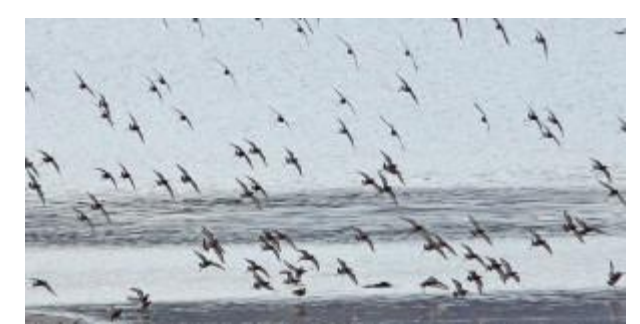
Black-tailed Godwits – Loch Gilp, Mid-Argyll 21 Apr (Jim Dickson).

20 April: A male Common Redstart was feeding in a garden at Carsaig (nr Tayvallich), Mid-Argyll at 09:00 this morning (Jon Close).