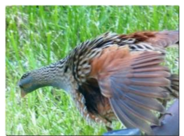
Corn Crake – Oronsay, Colonsay 05 Jun.