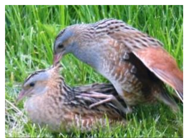
Corn Crakes – Oronsay, Colonsay 05 Jun.