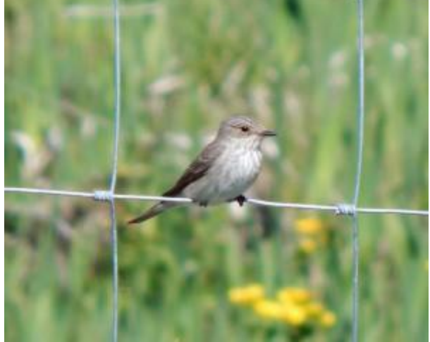
Spotted Flycatcher – Balephuil, Tiree 14 May.

Curlew Sandpiper – Vaul Bay, Tiree 14 May.