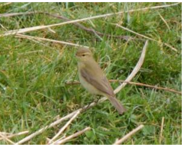
Common Chiffchaff – Balephuil, Tiree 06 Apr.

One Swallow may not make a summer – but six might possibly? Not to mention Sand Martins and lots of Chiffchaffs and Wheatears.