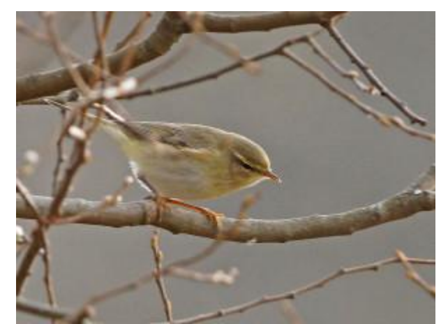
Willow Warbler - Cairnbaan, Mid-Argyll 10 Apr.