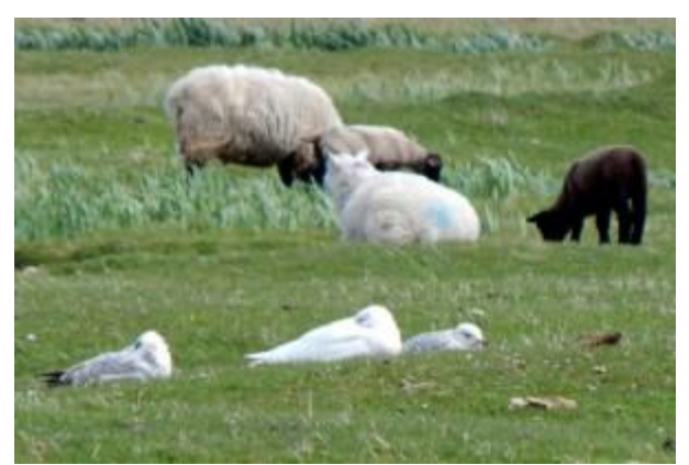
2nd calendar year Glaucous Gull – Barrapol, Tiree (John Bowler).

The best sighting at Machrihanish Seabird Observatory, Kintyre today involved 2 dark adult Arctic Skuas present in the area all day (Eddie Maguire).