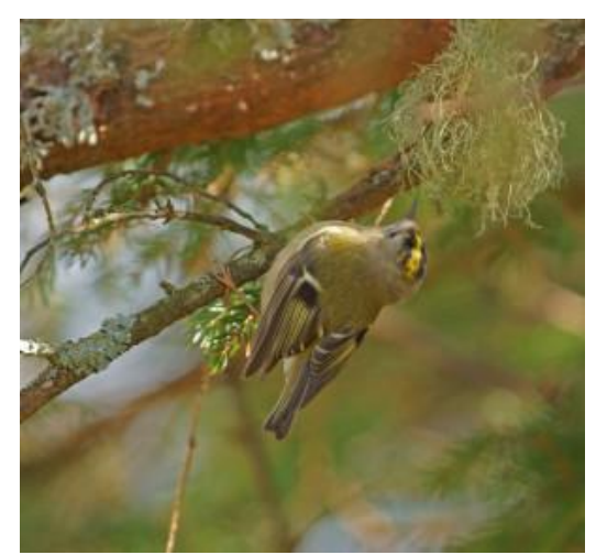
Goldcrest – Cairnbaan, Mid-Argyll 20 Apr (Jim Dickson).

19 April: A Eurasian Nuthatch was seen feeding in garden at Glen Forsa Cottage, Pennygowan, Glen Mull today (Pete Gibson).