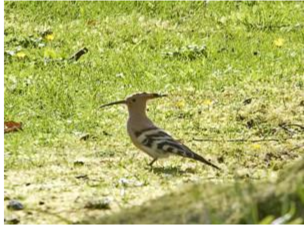
Hoopoe – Ardchattan Priory, North Argyll 21 Apr.