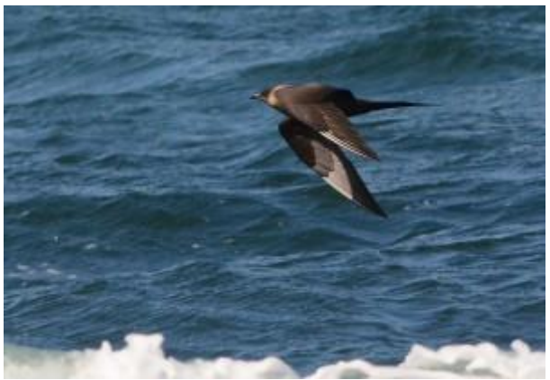
Arctic Skua – MSBO, Kintyre 16 May (Eddie Maguire).

The best sighting at Machrihanish Seabird Observatory, Kintyre today involved 2 dark adult Arctic Skuas present in the area all day (Eddie Maguire).