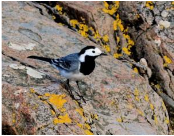
White Wagtail – MSBO, Kintyre 16 Apr.