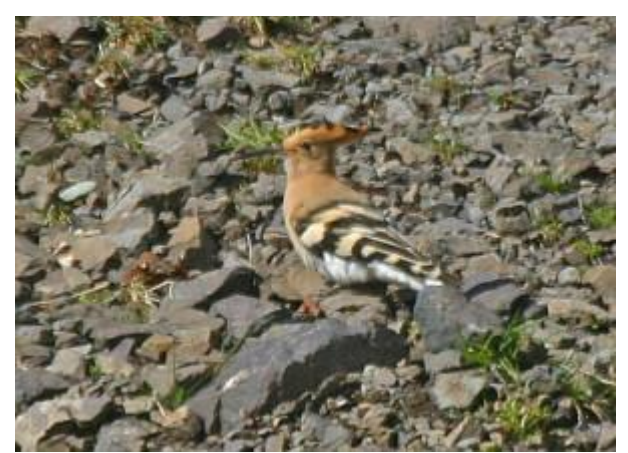
Hoopoe – Oban, Mid-Argyll 12 Apr.