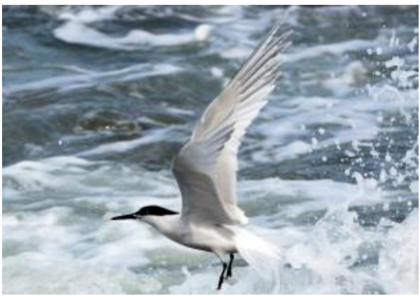
Sandwich Tern – MSBO, Kintyre 17 May.