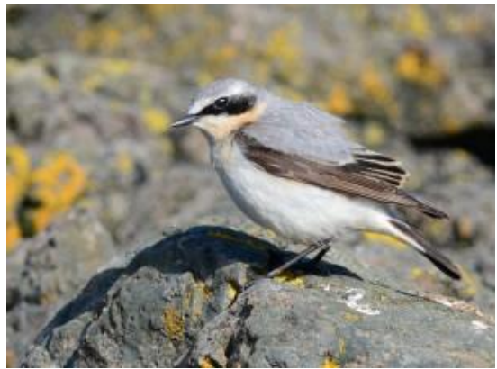
Northern Wheatear – MSBO, Kintyre 30 Apr.