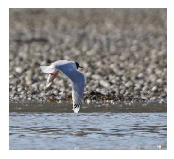
Little Gull – Loch Gilp, Mid-Argyll 25 Apr (Jim Dickson).