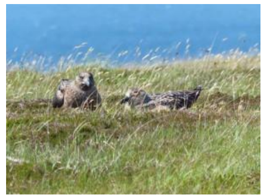
Great Skuas at nest - Oronsay, Colonsay 30 Jun (Mike Peacock).

Proud parents, picture taken today. It seems Oronsay has a small colony of Great Skuas forming, with two pairs and a single bird, all seen flying around the area. (Mike Peacock).