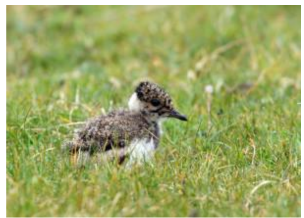
Lapwing chick – Balevullin, Tiree 20 May.