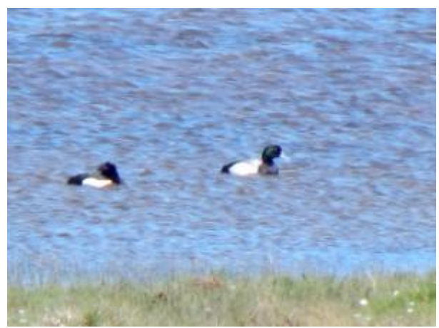
Greater Scaup – Loch a' Phuill, Tiree 05 Jun.