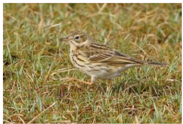
Meadow Pipit – Add Estuary, Mid-Argyll 11 Apr.

10 April: A Willow Warbler and two Common Chiffchaffs were singing in Minard Woods, Mid-Argyll at 08:00 this morning and a lone House Martin was circling over Minard village (Paul Daw).