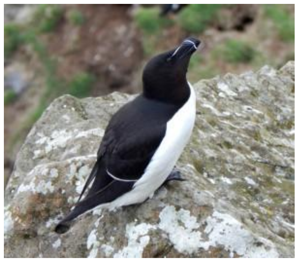
Razorbill – Lunga, Treshnish Isles 24 Apr.

The Coll Bird-watching Festival trip to Lunga, Treshnish Isles on Friday 24 April found hundreds of Puffins and auks back in and displaying. But they had all gone the next day with the change in the weather!.