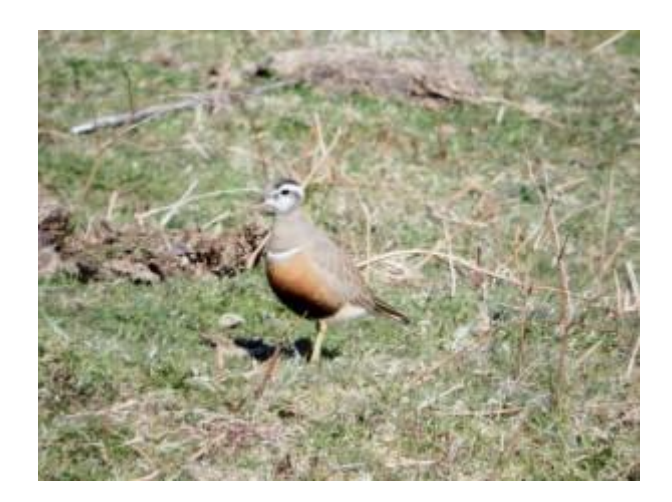
Dotterel - Oronsay, Colonsay 07 May (Morgan Vaughan).

06 May: Today on Tiree: 4 Dotterel briefly on the machair at Loch a' Phuill, a first winter Glaucous Gull at Sandaig and at Balephuil; 5 Blackcaps , a Common Whitethroat , 2 Tree Sparrows and 2 Greenfinches . Also 100s of Dunlin and Sanderling around the beaches and 40+ Whimbrel passing through (John Bowler).