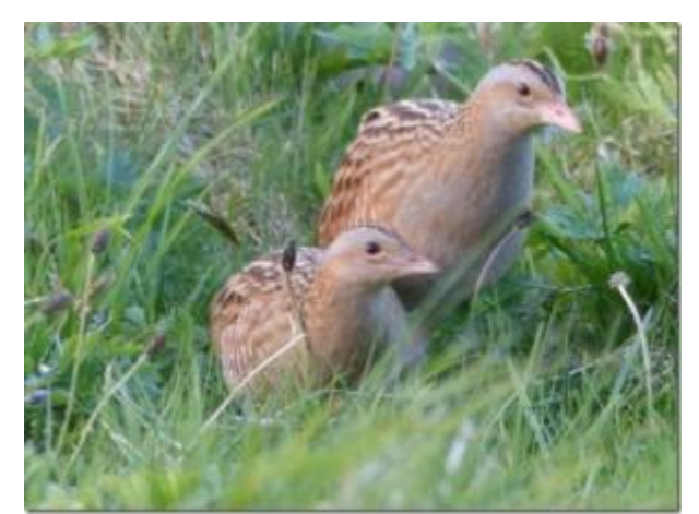
Corn Crakes – Oronsay, Colonsay 14 May.