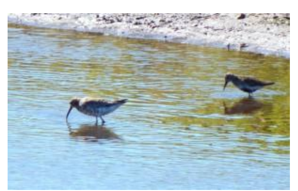
Curlew Sandpiper (left) Heylipol Church, Tiree 14 Jun.