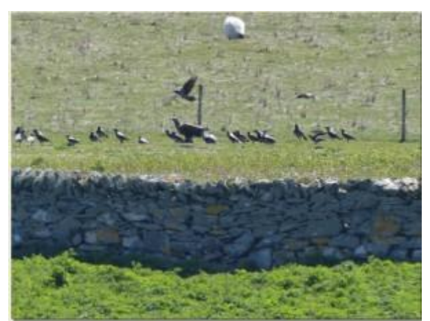
White-tailed Eagle – Oronsay, Colonsay 14 May (Mike Peacock).