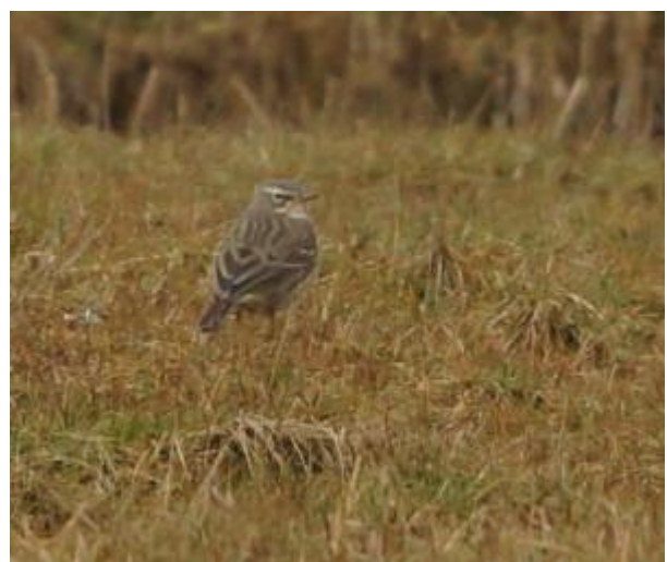
'Scandinavian' Rock Pipit – Add Estuary, Mid-Argyll 01 Apr (Jim Dickson).

A nice breeding plumage 'Scandinavian' Rock Pipit ( A. p. littoralis ) at the Add Estuary, Mid-Argyll late morning today on the salt-marsh with 20 or more Meadow Pipits. This ties in with the winter plumage littoralis looking birds that arrived here back in November 2014 (Jim Dickson).