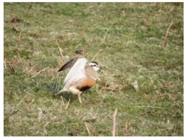
Dotterel - Oronsay, Colonsay 07 May (Morgan Vaughan).

On Oronsay, Colonsay today Mike Peacock said "Right we'd better check the Dotterel lawns" and sure enough there were 4 of them! Also today on Oronsay: a single Tufted Duck , 150+ Ringed Plovers , 350+ Dunlin , a single Black-tailed Godwit and 10 Whimbrel (Morgan Vaughan).