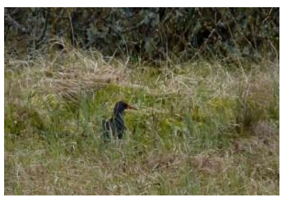
Water Rail – Lochan Iliter, Luing 02 May.