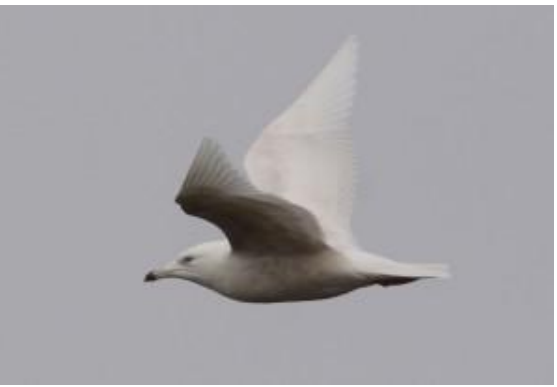
second winter Glaucous Gull – MSBO, Kintyre 23 Apr.