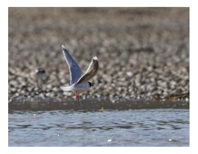
Little Gull – Loch Gilp, Mid-Argyll 25 Apr (Jim Dickson).