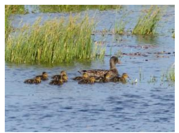
Gadwall brood – Oronsay, Colonsay 29 Jun.