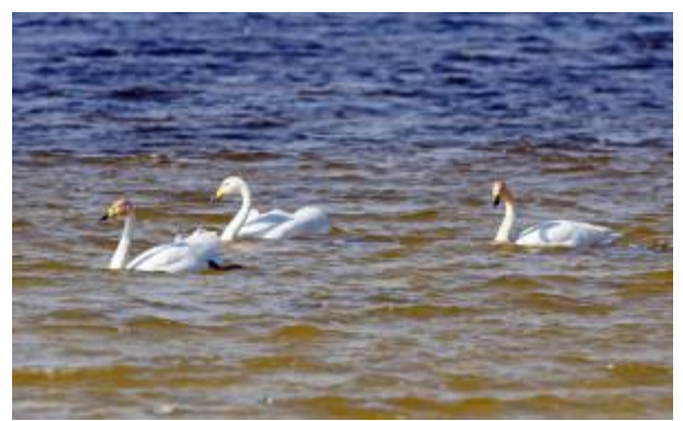
Whooper Swans - Loch Bhasapol, Tiree 18 May.