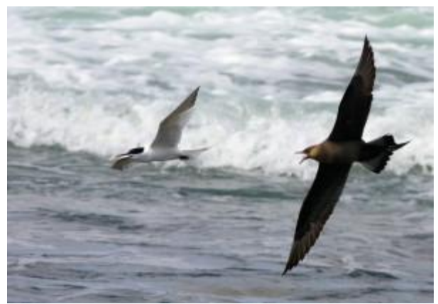
Arctic Skua pursuing Sandwich Tern – MSBO, Kintyre 02 Jun.