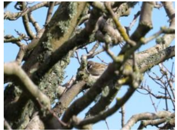
Tree Sparrow – Kinnabus, Islay 16 Apr.