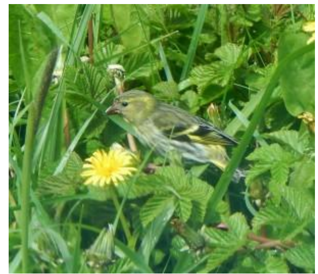
Siskin – Balephuil, Tiree 16 May.