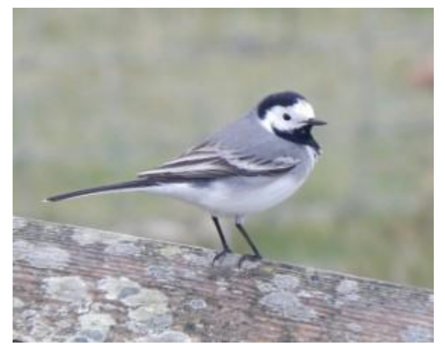
White Wagtail – Loch Bhasapol, Tiree 21 Apr (John Bowler).

A flock of 153 Black-tailed Godwits was on the low tide line at Loch Gilp, Mid-Argyll around 10:00 along with 2 Whimbrel . Sadly, all gone by 11:00: birds disturbed by a team of cockle pickers (Jim Dickson).