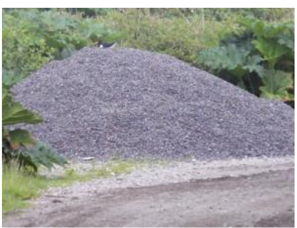
Oystercatcher nest – Crarae, Mid-Argyll 26 Jun.