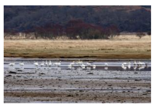
Whooper Swans – Add Estuary, Mid-Argyll 04 Apr.

Northern Wheatear – Ulva Lagoons (Loch Sween), Mid-Argyll 04 Apr.