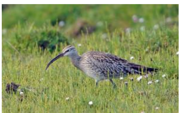
Whimbrel - Caolas, Tiree 19 May.