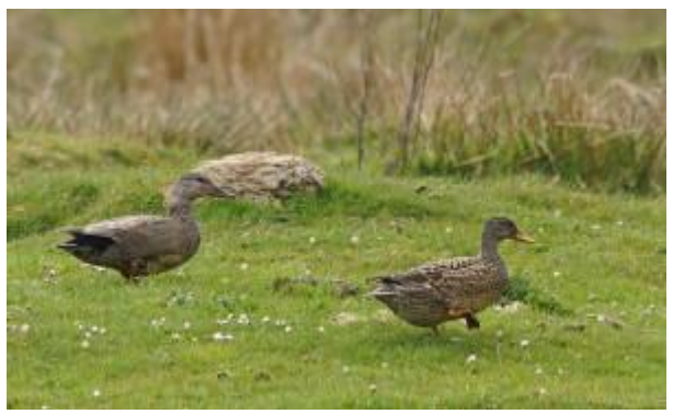
Gadwall pair – Tiree 16 May.