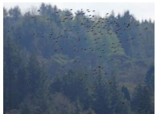
Black-tailed Godwits – Loch Gilp, Mid-Argyll 21 Apr.

At last! A Common Cuckoo calling at Tullochgorm (Minard), Mid-Argyll this morning was the first heard locally.