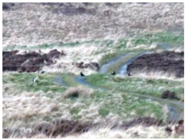
Black Grouse - above Loch Striven, Cowal 11 May (George Newall).

At least five Blackcock were at a Black Grouse lek site above Loch Striven, Cowal at dusk this evening (George Newall). George had to watch from the road to avoid disturbing them so clear photos were not possible, but the one below shows five of them.