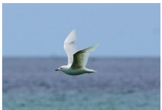
2nd calendar year Iceland Gull – Iona, Mull.