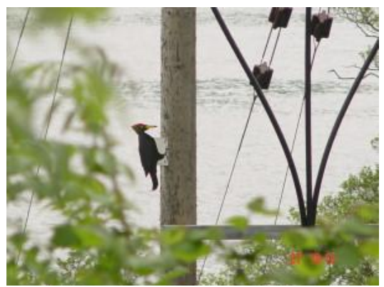
Almost a Black Woodpecker!... 27 Jun.

On Tiree today, 2 House Martins, a Goldfinch and a Common Redpoll were at Balephuil and a lone Barnacle Goose at Gott Bay.