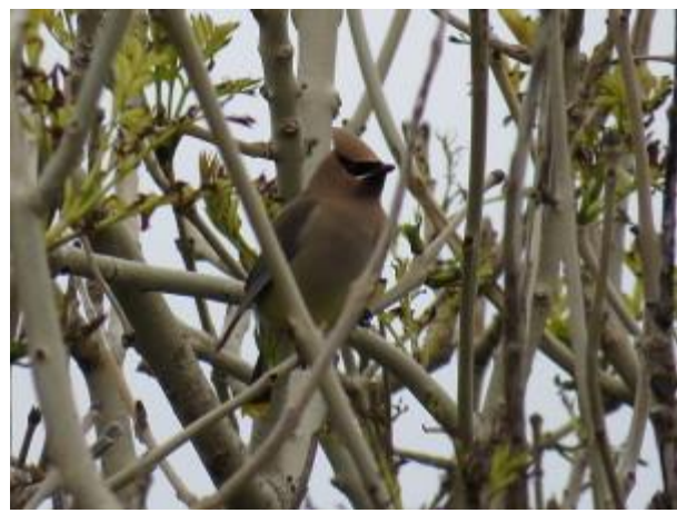
Cedar Waxwing – Scarinish, Tiree 10 Jun.