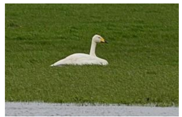
Whooper Swan - The Laggan, nr Campbeltown 10 May (Eddie Maguire).

Also today: an adult Whooper Swan on floodwater by The Strath Farm, The Laggan, nr Campbeltown and the first Common Swifts (8) at Campbeltown were over Burnside Square at 19:30 this evening (Eddie Maguire).