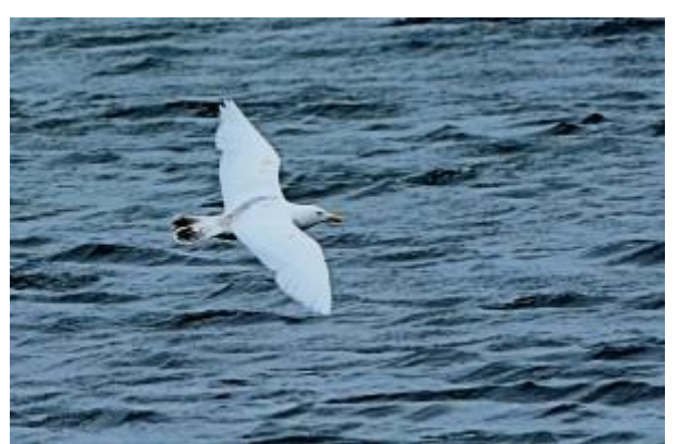
leucistic Herring Gull – MSBO, Kintyre 10 May.