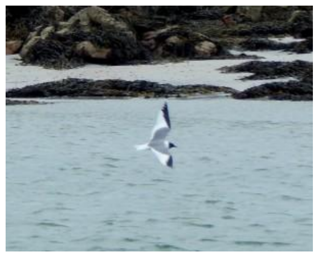
Sabine's Gull – Gott bay, Tiree 27 May.