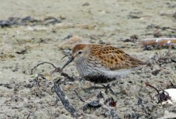
Dunlin - Gott Bay, Tiree 22 May.