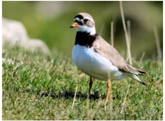
Ringed Plover – MSBO, Kintyre 30 Apr.