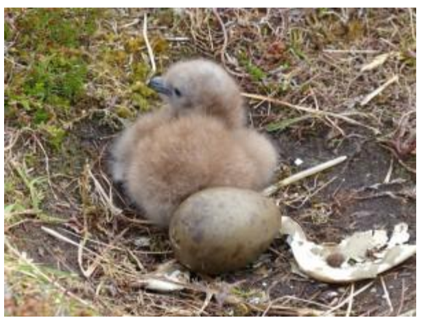
Great Skua nestling – Oronsay, Colonsay 30 Jun.

A single Eurasian Treecreeper was a surprise at Balephuil, Tiree today, feeding on the walls of an old barn – found by a visiting birder. The Common Quail is still at Balephuil and 13 Tufted Ducks were at Loch an Eilein (John Bowler). There are only three previous records of Eurasian Treecreeper on Tiree.