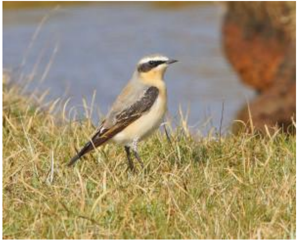
Northern Wheatear – Add Estuary, Mid-Argyll 10 Apr.