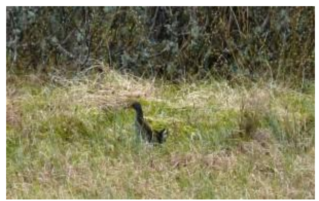
Water Rail – Lochan Iliter, Luing 02 May.

This immature Glaucous Gull was found on Oronsay, Colonsay this evening.