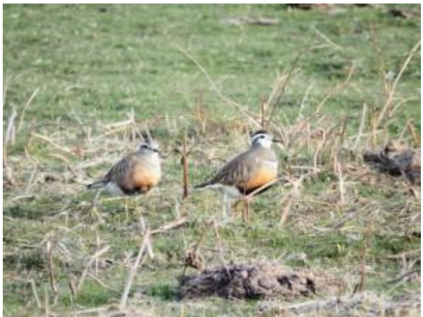
Dotterel - Oronsay, Colonsay 08 May (Morgan Vaughan).

Also on Oronsay today: 9 Whimbrel, 25 Arctic Terns , a Little Tern and one White Wagtail (Morgan Vaughan).