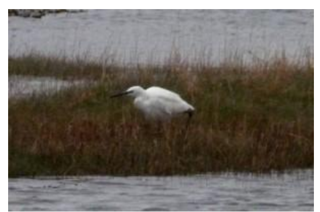
Little Egret - Balvicar, Mid-Argyll 05 May.