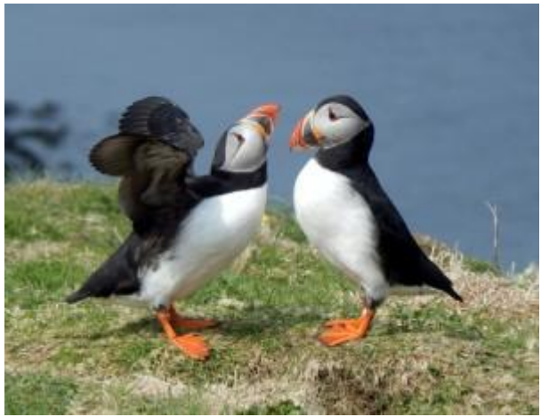
Puffins – Lunga, Treshnish Isles 24 Apr.

Common Guillemots – Lunga, Treshnish Isles 24 Apr.