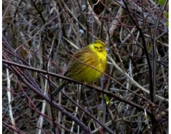
Yellowhammer - Black Mill Bay, Luing 02 May.