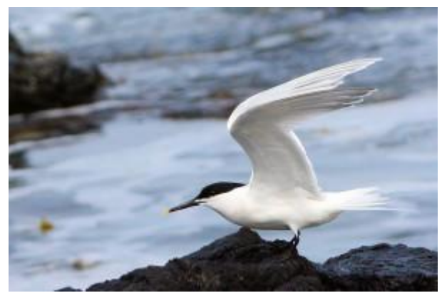
Sandwich Tern – MSBO, Kintyre 17 May (Eddie Maguire).

17 May: At Dunstaffnage Bay today: five very young Common Eider ducklings, 12 Ringed Plovers , 14 Dunlin and two Lesser Black-backed Gulls (unusual here) (Robin Harvey). Today at Machrihanish Seabird Observatory, Kintyre: at least 35 Sandwich Terns and ca 60 Gannets foraging: some very close to shore (Eddie Maguire).