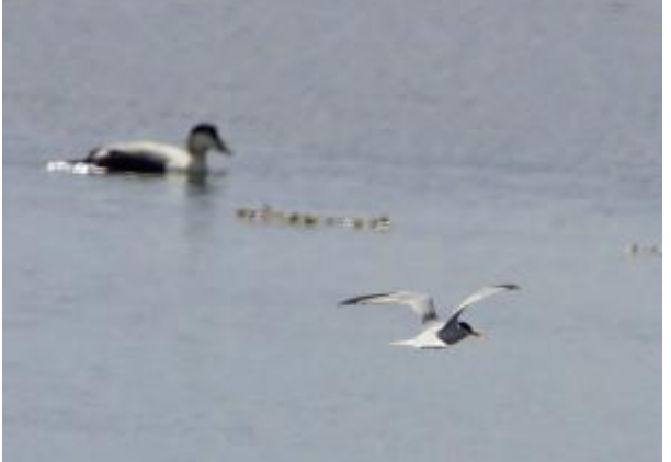
Little Tern – Loch Gilp, Mid-Argyll 29 May.

first-winter Iceland Gull – Campbeltown, Kintyre 29 May (Eddie Maguire).