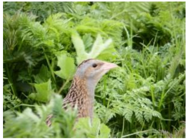
Corn Crake - Oronsay 10 May