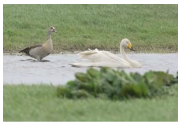
Egyptian Goose – The Laggan, Kintyre 22 May.