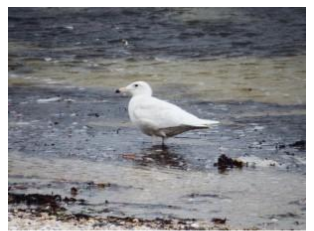
Glaucous Gull - Oronsay, Colonsay 02 May

01 May: On Tiree: a Grasshopper Warbler was reeling at Balephuil first thing with 2 Common Redpolls and a Goldfinch also there. Three Whimbrel , 25 White Wagtails , a colour-ringed Twite , and a Lapland Bunting were all at Crossapol Point during a BBS there. The hundreds of Black-tailed Godwits and thousands of Golden Plovers from yesterday had all left (John Bowler).