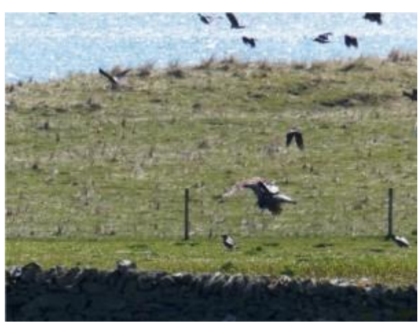
White-tailed Eagle – Oronsay, Colonsay 14 May (Mike Peacock).

13 May: Two White-tailed Eagles were feeding at Loch Crinan, Mid-Argyll today and more House Martins are around now (Jim Dickson).