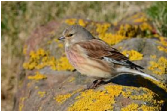
Linnet – MSBO, Kintyre 09 Apr

This nice male Linnet was photographed at the Machrihanish Seabird Observatory feeding station today.