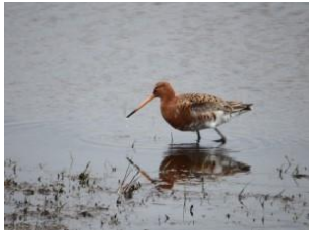
Black-tailed Godwit – Oronsay, Colonsay 28 Apr (Morgan Vaughan).

28 April: Whilst out at first light this morning, checking for lambs, the Oronsay (Colonsay) team found 2 Icelandic Black-tailed Godwits and at least 6 Whimbrel at the pools there (Morgan Vaughan).