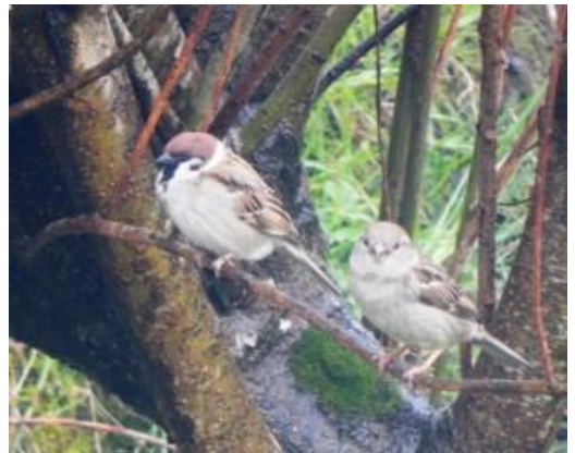
Tree Sparrow – Balephuil, Tiree 03 May (John Bowler).

03 May: On Tiree today: a Green Sandpiper on floods at Balephuil in the rain was initially in the car park! Also, a Tree Sparrow and 8 Collared Doves in the garden at Balephuil, a Curlew Sandpiper (not in breeding plumage) and a Dunlin at Loch a' Phuill, 10 Arctic Terns at Sorobaidh Bay and a female Blackca p at Meningie (John Bowler).