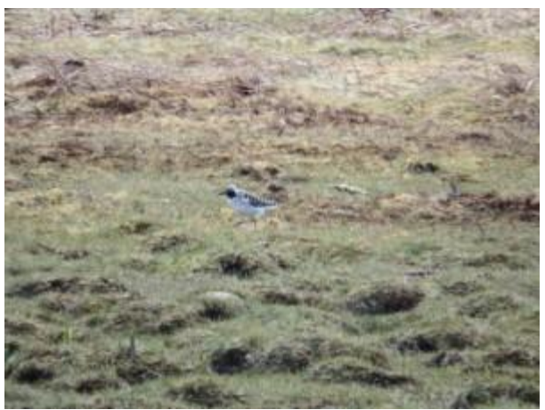
Ruff – Oronsay, Colonsay 27 Apr (Morgan Vaughan).

This Ruff on Oronsay today looks to be moulting into breeding plumage (Morgan Vaughan).