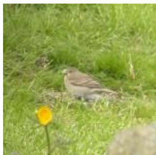
Common Rosefinch Tiree 9.6.11