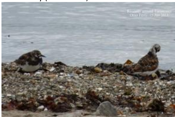
Turnstones © Tom Callan

Turnstone. Two adults, possibly moulting out of breeding plumage and one immature seen at Otter Ferry on 14 June were the first there since 25 May (Tom Callan).