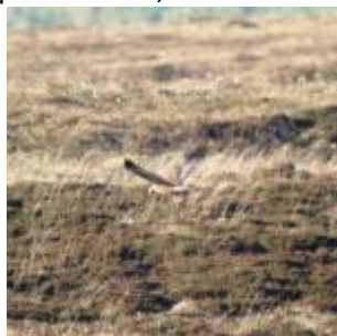
Marsh Harrier Islay 3.5.11