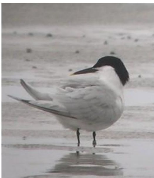
Sandwich Tern – Hynish, Tiree 17 June 2011

Arctic Tern. A total of 25 arrived at the Big Scone colony at Machrihanish on 17 May and at least 30 birds have settled at the colony (Eddie Maguire). A total of 35 were counted at Nave Island, Islay on 30 May (Michal Sur) and 150 were feeding off the mouth of Balephetrish Bay, Tiree on 14 May (John Bowler).