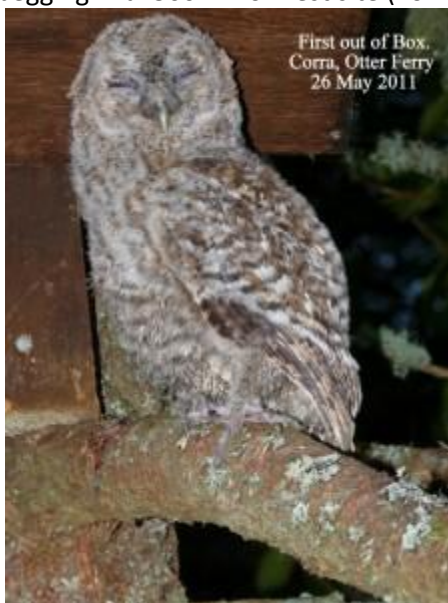
Tawny Owl chick – Otter Ferry 26 May 2011

Tawny Owl. The first chick out of the nest box in the garden at Otter Ferry (below) was noted on 26 May and by 16 June all three nestlings were begging in a 300m E of nest site (Tom Callan).