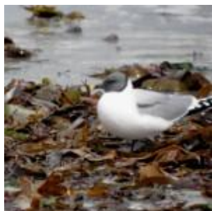
Sabine's Gull MSBO 24.5.11