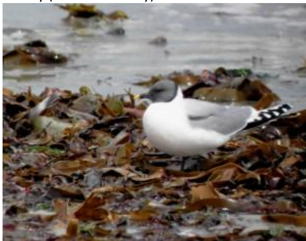
Sabine's Gull – Machrihanish Seabird Observatory 24 May 2011