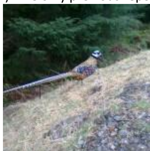
Reeves Pheasant Achnabreck 21.4.11

Reeve's Pheasant. A fine (and very aggressive!) male was seen and photographed at Achnabreac (near Lochgilphead) on 21 April (per Jim Dickson). The only previous reports have been from Cowal.