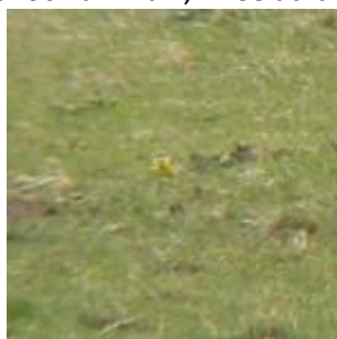
Blue-headed Wagtail Tiree 5.5.11

Blue-headed Wagtail. A male was seen at Loch a' Phuill, Tiree at lunchtime on 5 May.