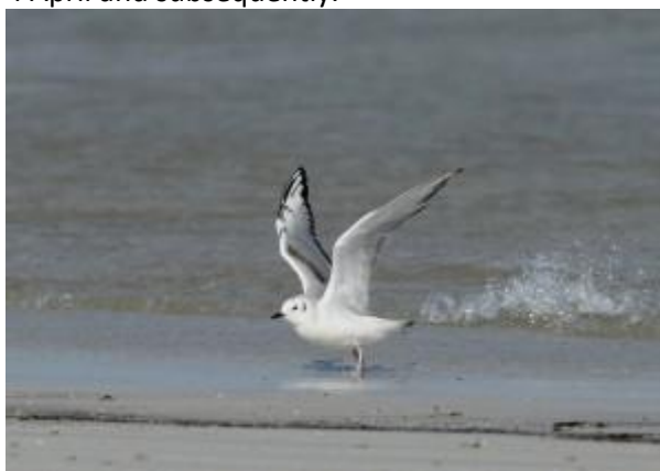
Bonaparte's Gull Tiree 7.4.11 J Dickson

Bonaparte's Gull on Tiree on 4 April and subsequently.