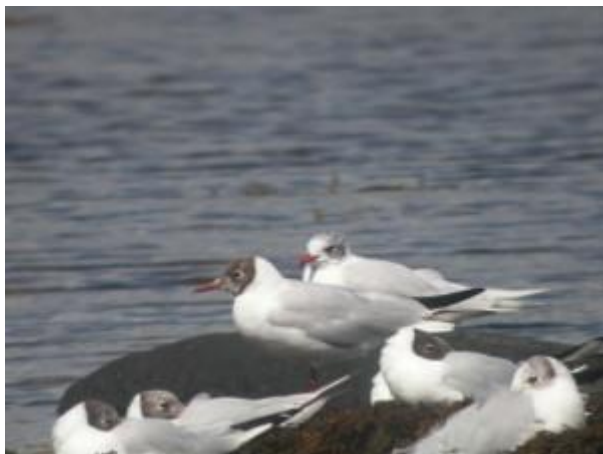
Mediterranean Gull (at back)