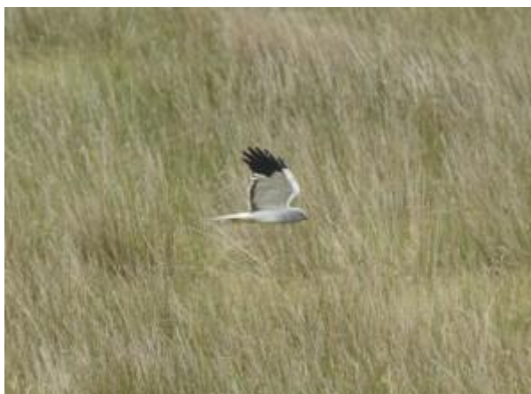
Hen Harrier- Colonsay