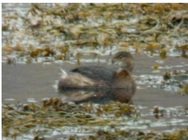
Pied-billed Grebe Salen, Mull 24.3.11

Pied-billed Grebe on Mull 22 March and subsequently.