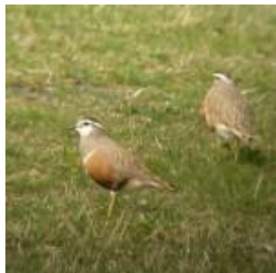
Dotterels Tiree 19.4.11