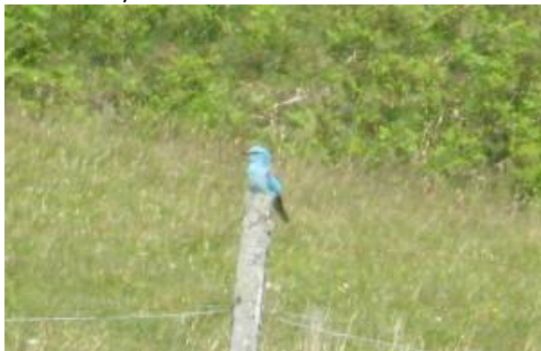
European Roller. Glen Aros, Mull 16 June 2011