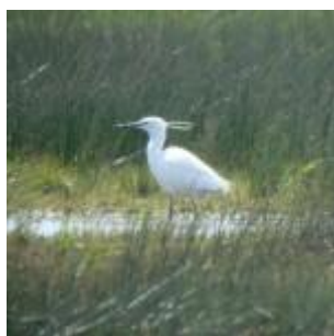
Little Egret Islay 4.5.11

Great White Egret. An adult Great White Egret in breeding plumage was showing well on the shore opposite the war memorial at Inveraray at 09:30 on the morning of 21 May. The very long neck and yellow upper legs were striking (Paul Daw). Sadly it was a short stayer and had gone by the following day, although there were reports of a heron sized white egret at Ballimore, Cowal on 23 May (Tom Callan).