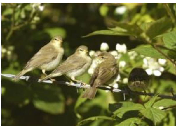
Willow Warbler family – Cairnbaan 11 July