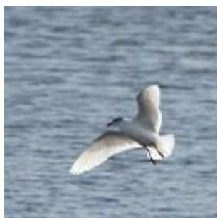
Mediterranean Gull Loch Gilp 27.2.11