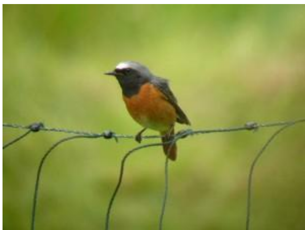
Common Redstart. Bellanoch, Mid-Argyll 12 June 2011