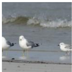
Bonaparte's Gull Tiree 7.4.11