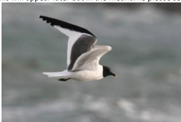
Sabine's Gull Tiree 23.5.11

SABINE'S GULLS. An unprecedented spring influx of Sabine's Gulls is ongoing. Since 17th May (on Mull) there have been records from Machrihanish Bird Observatory (25 May), Coll, Tiree and at least 4 birds on Mull (Loch na Keal 24 May). This is normally a scarce autumn migrant in Argyll and these records may well refer to storm driven birds. Full details will appear later but in the meantime please send all records to Jim Dickson.