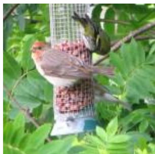
Common Rosefinch Mull 22-23.5.11