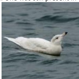
Glaucous Gull Campbeltown 1.4.11