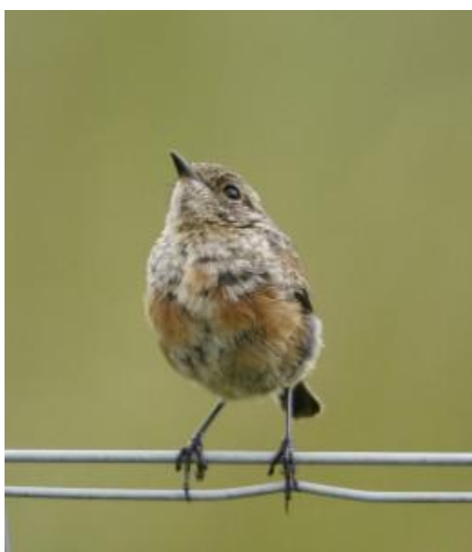
Juvenile Common Stonechat