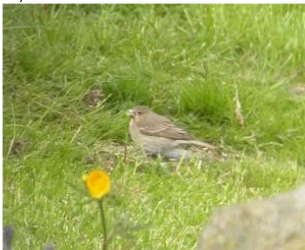
Common Rosefinch. Balephuill, Tiree 9 June 2011