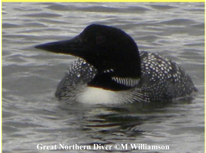
Great Northern Diver