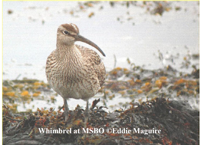
Whimbrel at MSBO

A 1 st year sub-adult Golden Eagle was watched near Otter Ferry for over 30 minutes. At least half of this time was spent playing with melon sized object which it dropped frequently and attempted to catch before it reached the ground: mainly successfully. It approached to within 200mts (Tom Callan).