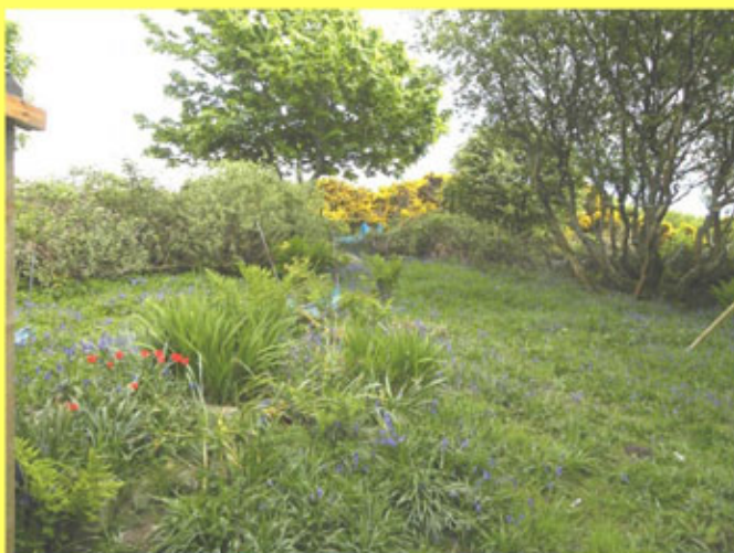
The garden today - bluebells in bloom