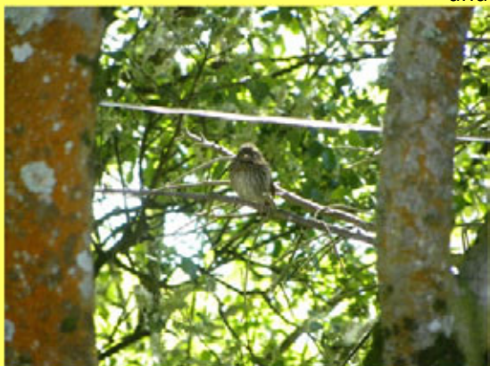
A young Dunnock—one of the successes