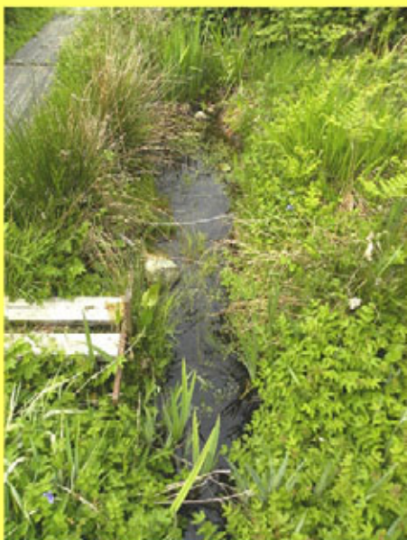
Pond formed from an open drain