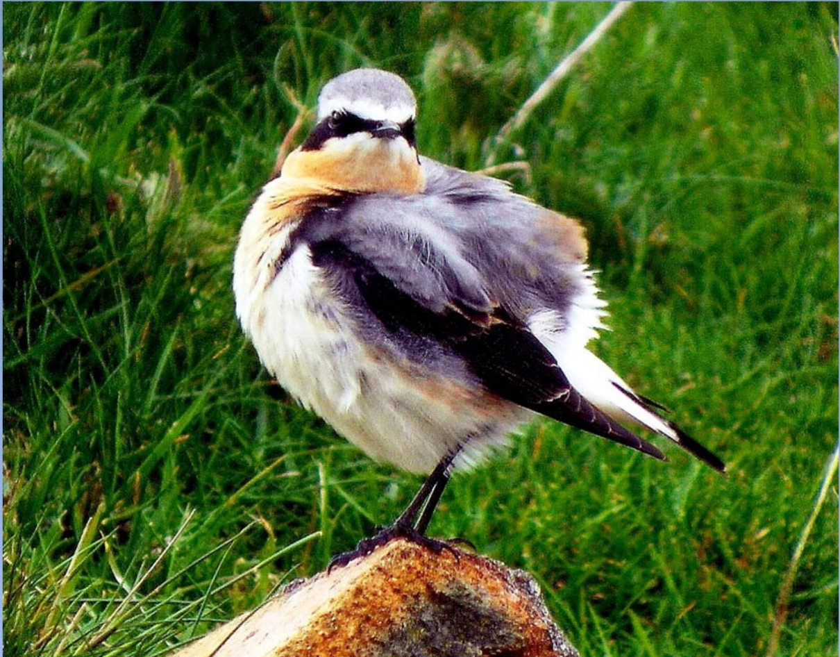
A slightly ruffled male Northern Wheatear taken in early May

Silver Jubilee Indoor Meeting and Celebrations