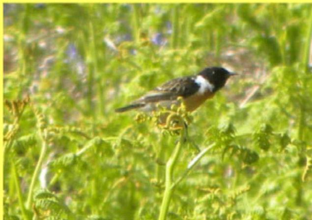
A significant find this Spring– male Stonechat at Port Ban

This report focuses on the arrival of spring migrants in the county. I have included in the species table not just the first arrivals but as many other records as possible to give the fullest possible picture of the overall pattern. This had meant that the remaining recent reports are very brief and include just the highlights. As always, thanks are due to all those who took the trouble to send in records. We have had a very good response to the request for arrival dates of spring migrants in Argyll and as a result have a good picture of the pattern this year. Many thanks to all of you. If any of you have observations that would add to this picture it is not too late to send them in.