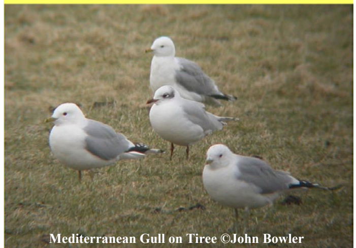
Mediterranean Gull on Tiree