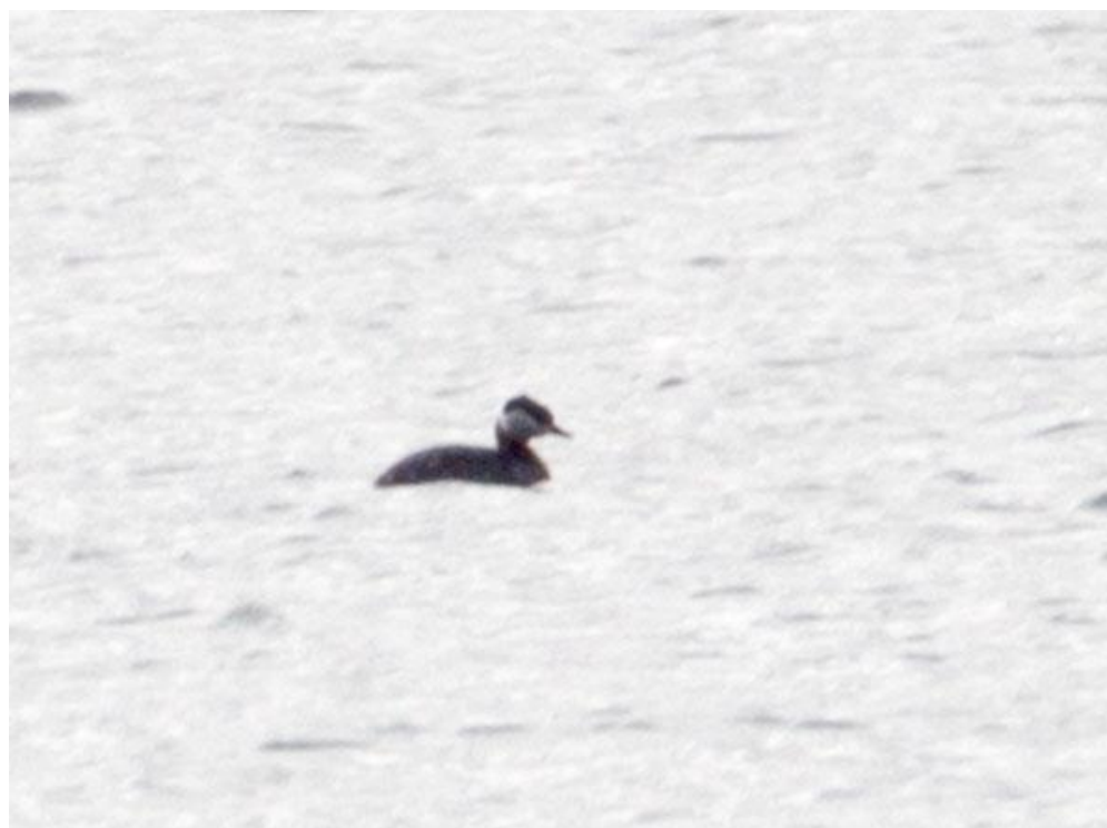
Red-necked Grebe, St Ninian's Bay, 24 February 2013