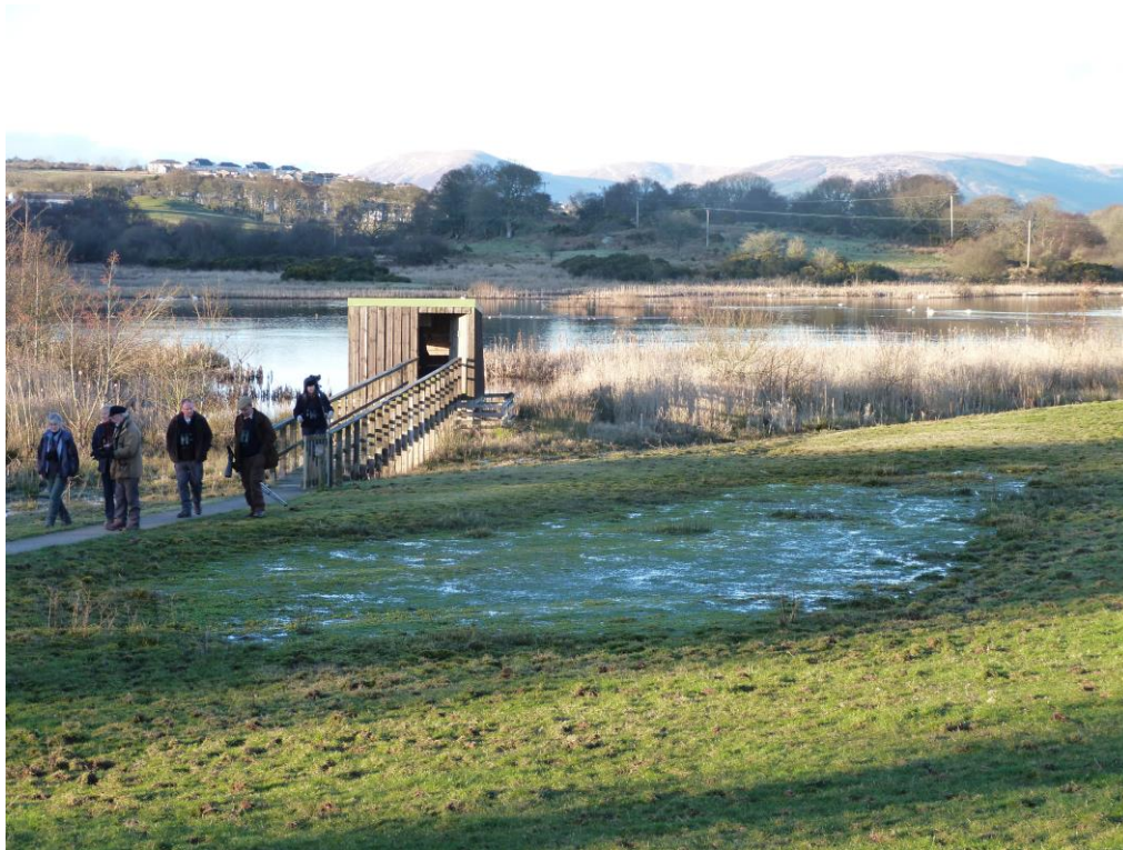
Members returning from the Kirk Dam hide