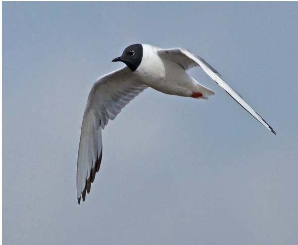
Bonaparte's Gull 2 August 2012

Kittiwake: A foraging pack of 400 or more was ranging widely over Machrihanish Bay on 15 July (many much-worn first-summer birds were present); all eventually flew off to the S (Eddie Maguire).