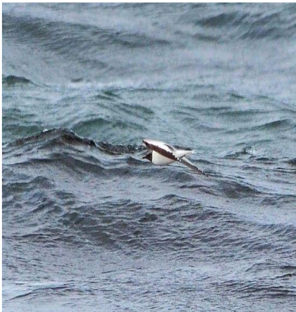
Sabine's Gull © Eddie Maguire

Sabine's Gull: a summer-plumaged adult was photographed flying S past Machrihanish Seabird Observatory on 27 July (Eddie Maguire). This date equals the earliest ever autumn record for the County. Weather – NW 4 with poor visibility at times / several heavy squalls.