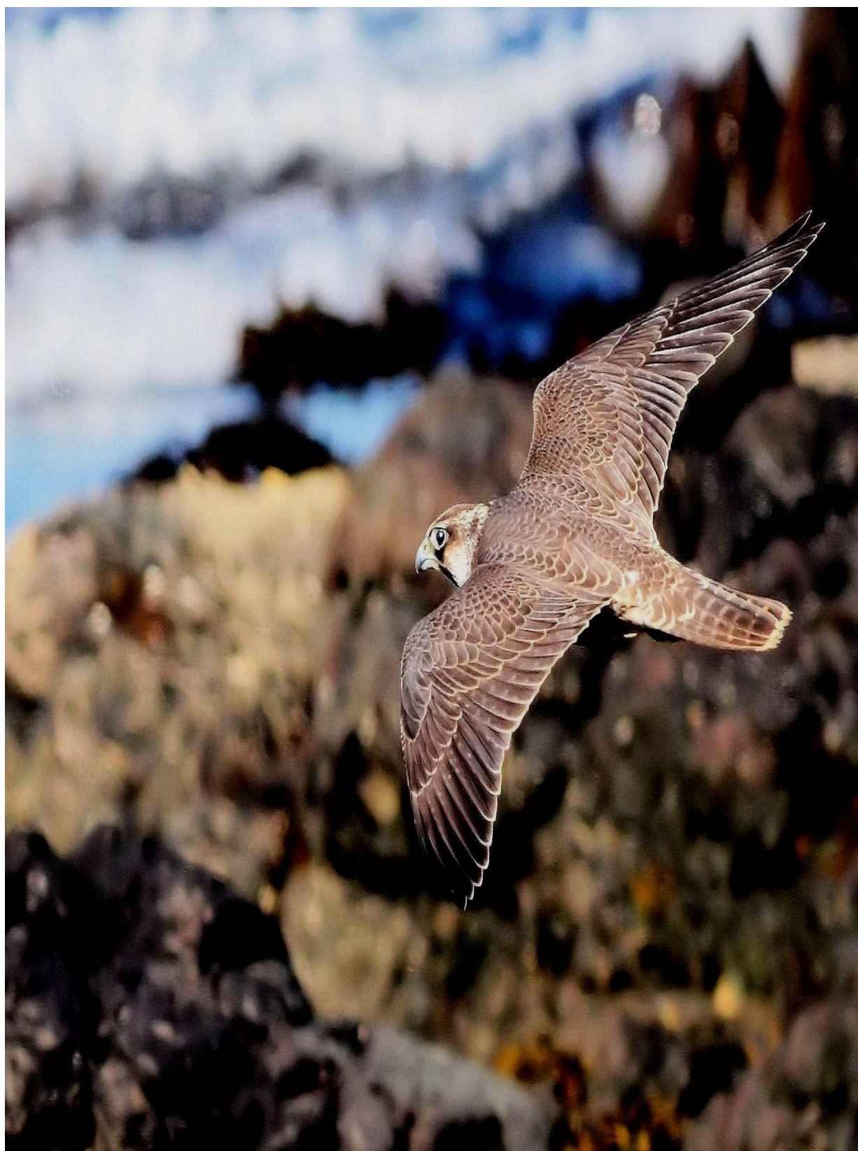
juvenile Peregrine Falcon @ MSBO