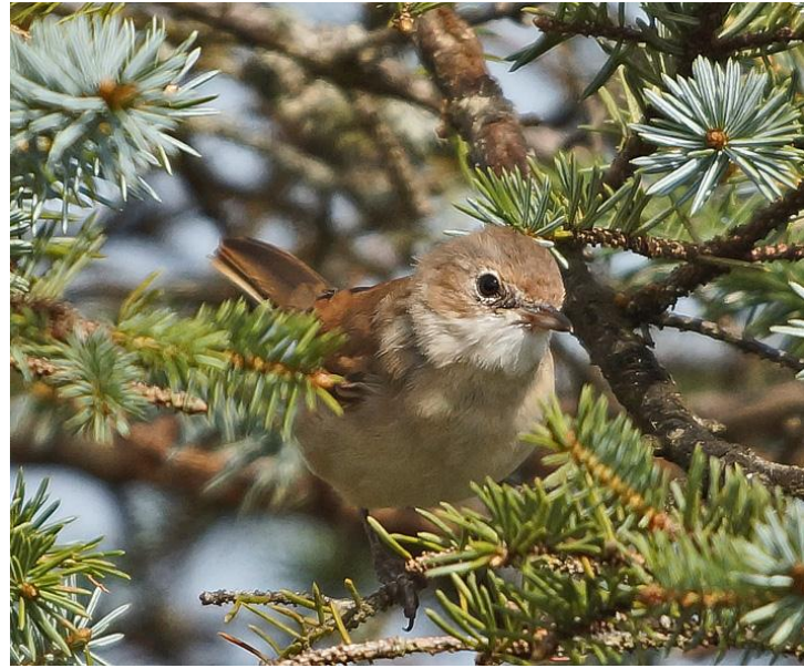
Common Whitethroat

Common Whitethroat: four singing males were heard around Ulva Lagoons (Loch Sween) on 18 June, 8 were seen along the Crinan Ferry Road (Moine Mhor) on 31 July (Jim Dickson) and 3 were at Otter Ferry Fish Farm on 3 August (Tom Callan).