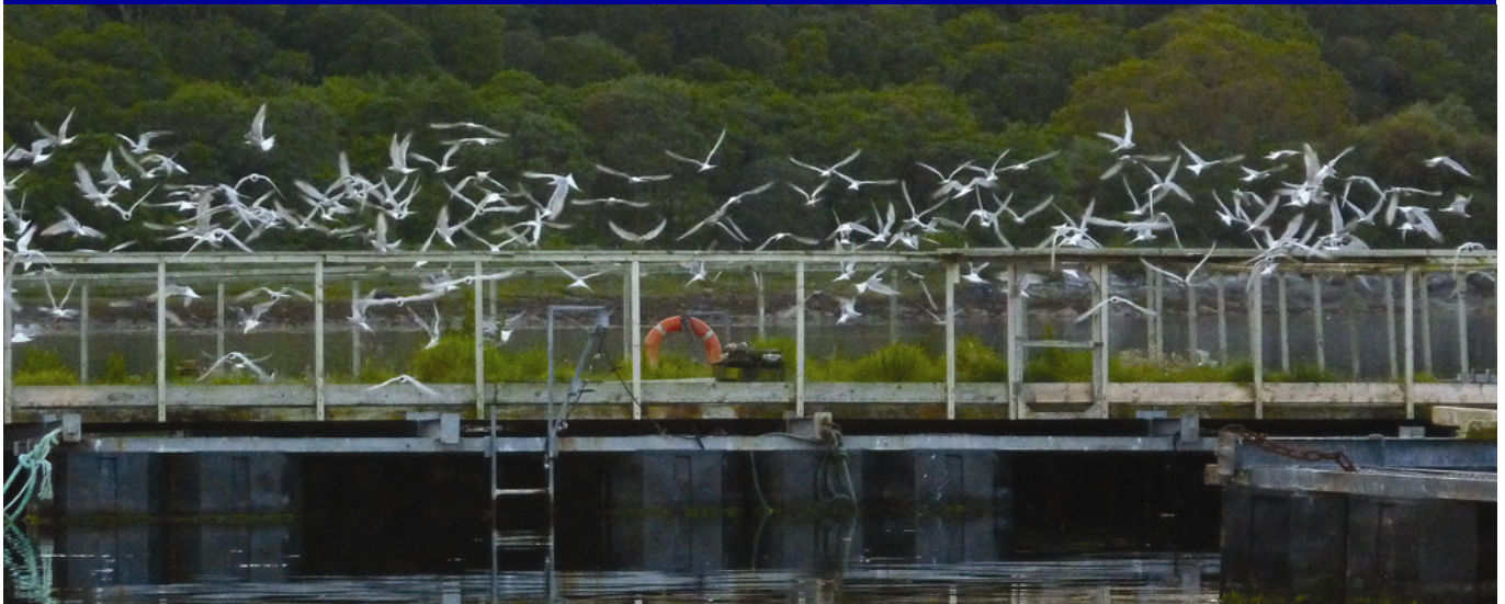
Common Terns on one of the mussel rafts, Loch Creran