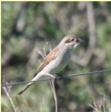
Red-backed Shrike Mull 26.5.12