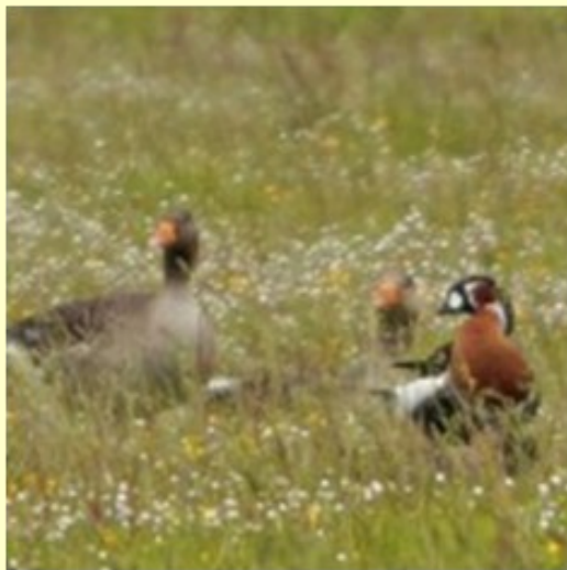
Red-breasted Goose L Riddon 5.6.12

the second ever in Argyll since the last one on Tiree in 2001 and returned the following two winters. This year has seen several of this species in the UK and the likelihood is that the bird is wild.