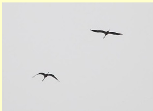
Common Cranes Loch Goil 17.5.12

Common Cranes are not really traditional spring migrants in Argyll but two birds were seen over Uig, Coll on 13 April (Peter Isaacson), followed by three reported by Ali and Kenny Little south of Skipness, Kintyre on 21 Apr - flying high and