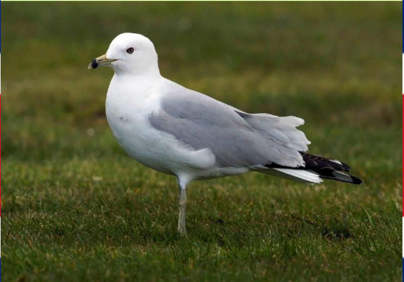
Ring Billed Gull photographed on the front green Lochgilphead

Indoor Meetings Common Tern usage of mussel rafts Goldfinch Movements MSBO Treasurer's report Membership Report Annual General Meeting 2011 ( draft ) minutes Recent Reports