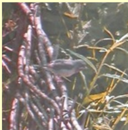
Eastern Subalpine Warbler Tiree 28.5.12 (John Bowler)

Arctic Redpoll: a description and photos have been submitted of a bird of the Greenland race 'Hornemann's Redpoll' seen at Sanaigmore Bay, Islay on 10 April (Hilary & Guy Mackenzie). There are only two previous accepted records of the species in Argyll, both of the N European race exilipes .