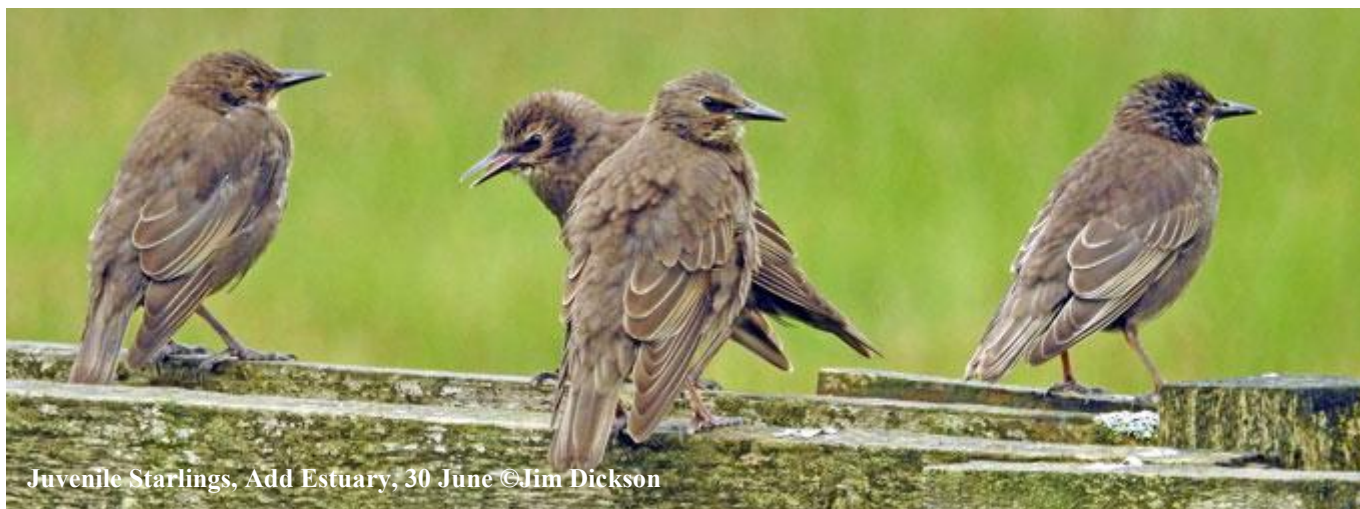
Juvenile Starlings, Add Estuary, 30 June