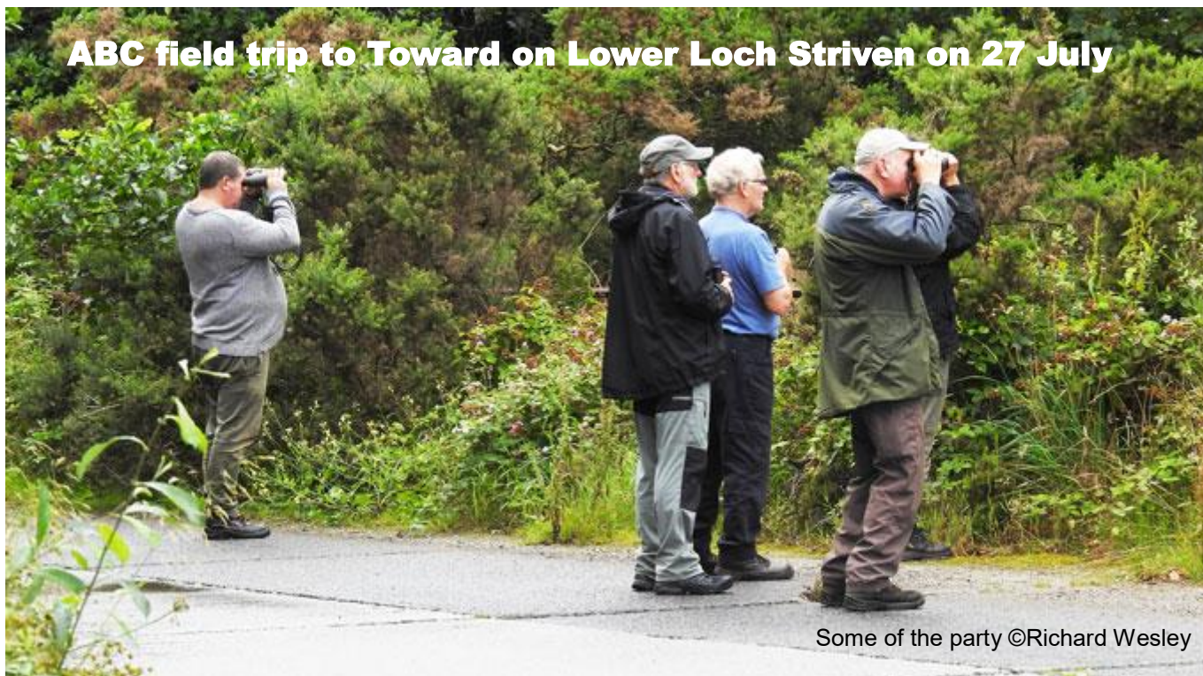
Some of the party

The weather on the morning didn't look too promising, with thick black clouds producing heavy showers. But, on arrival at the meeting place, the rain began to ease.