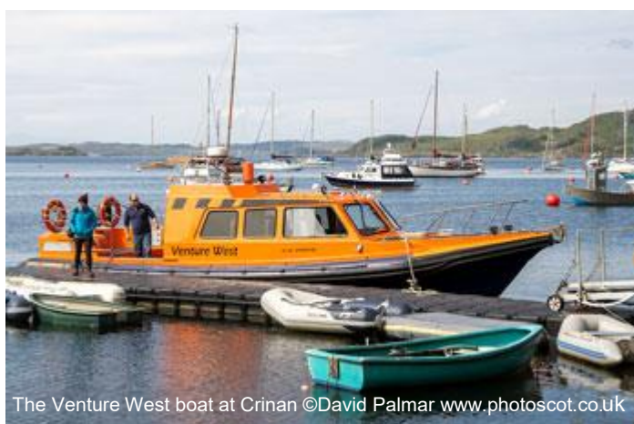
The Venture West boat at Crinan

It had rained all of the previous day so the party was thankful that it was dry as they left under leaden skies, after a safety briefing from the skipper, and headed over towards Kinuachdrachd in north-east Jura. For counting, the coastline had been split into sections and the section number was shouted out when transition was made from one section to the next. The