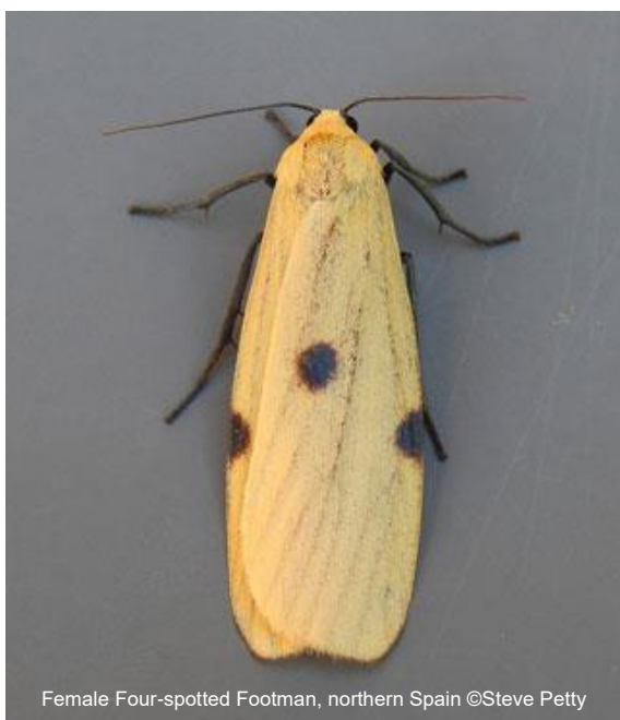
Female Four-spotted Footman, northern Spain

This is the largest of a number of footman species that occur in Europe. Its name derives from the four spots on the wings of the female (photo below). This species regularly breeds in southern England. On the continent numbers fluctuate greatly from year to year. In peak years, dispersing immigrants are recorded well