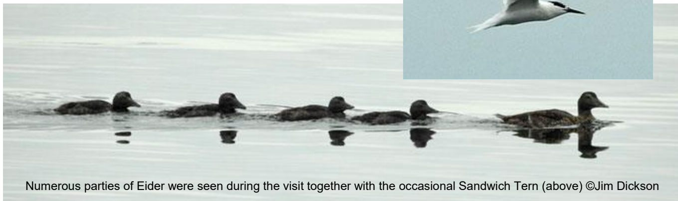
Numerous parties of Eider were seen during the visit together with the occasional Sandwich Tern (above)