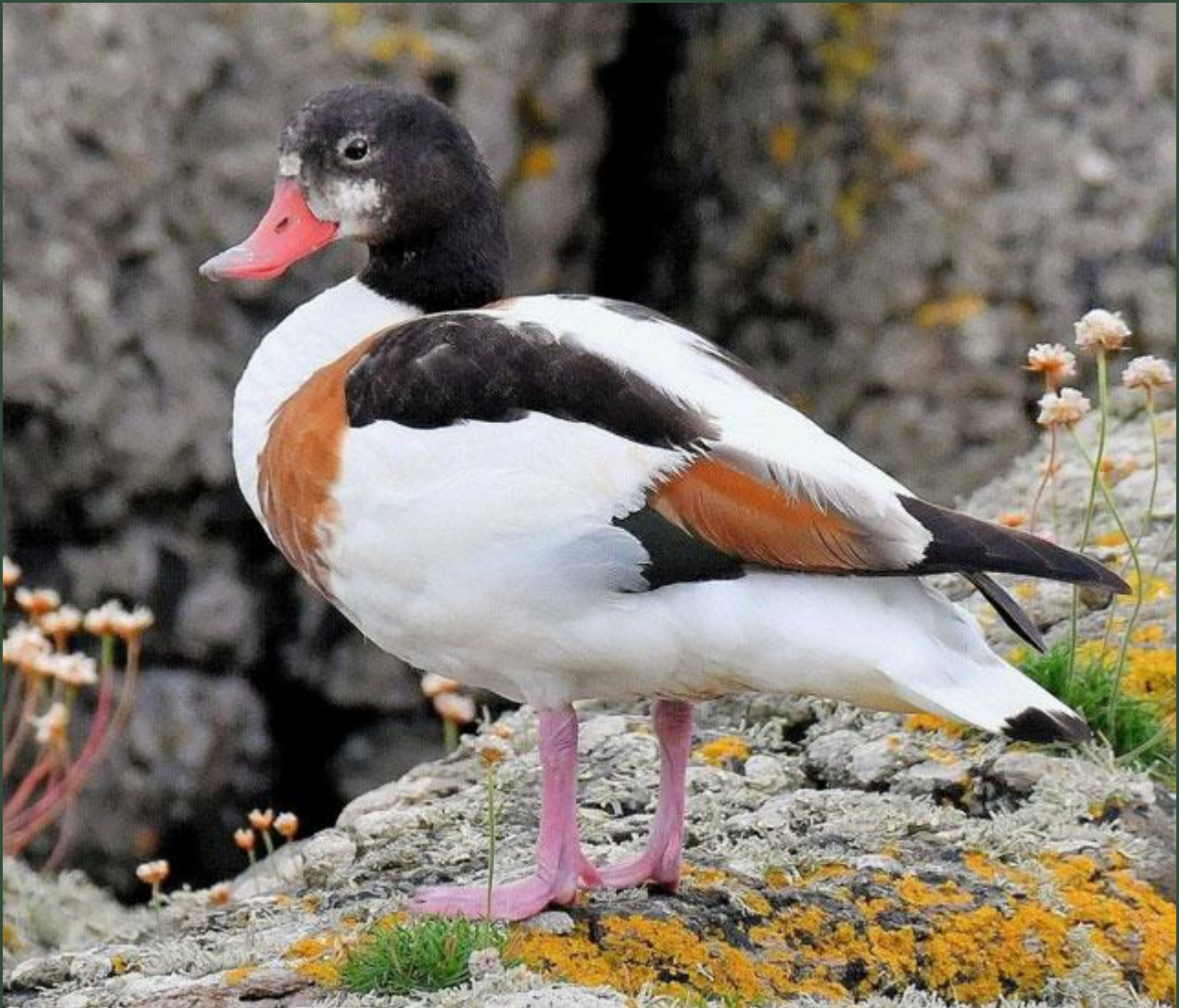
Female Shelduck, Machrihanish Seabird Observatory on 26 June

Download your copy of the latest Argyll Bird Report at: http://argyllbirdclub.org/publications/the-argyll-bird-report/