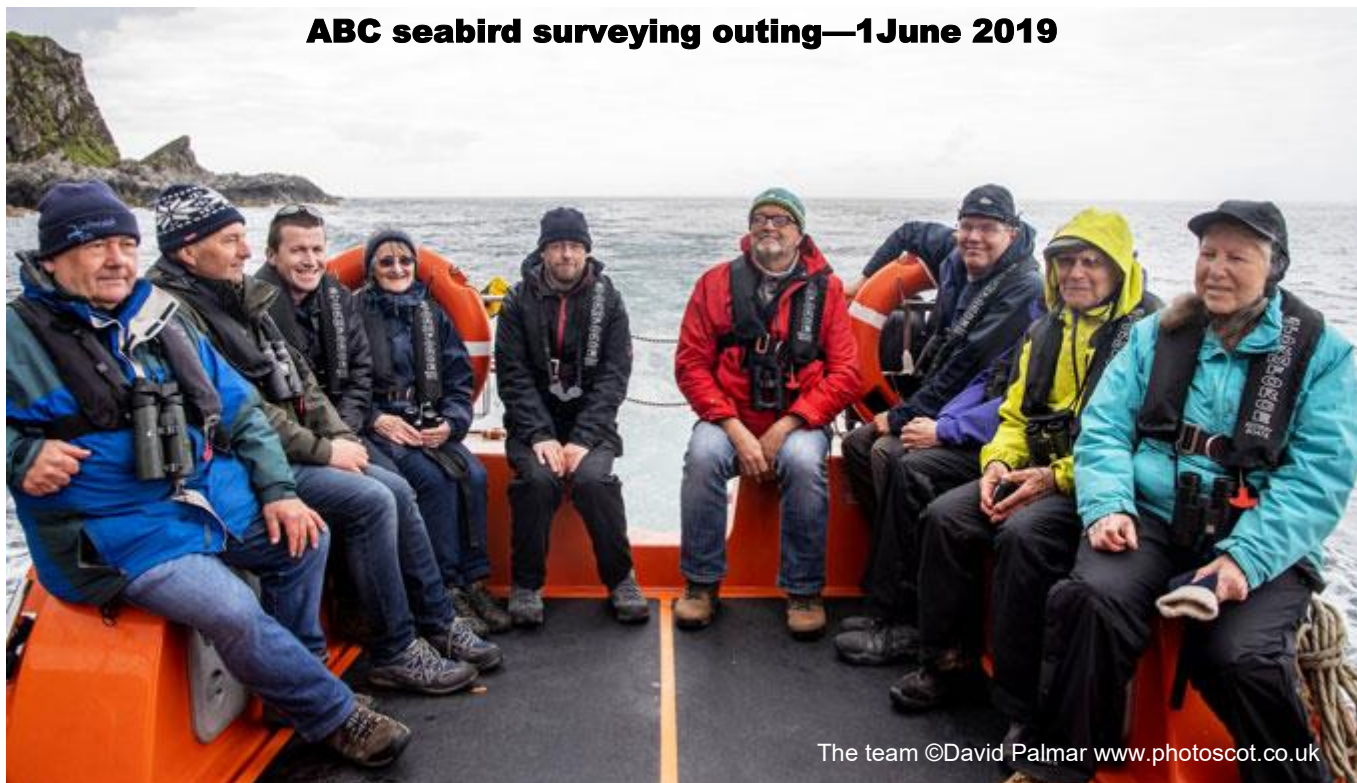
The team