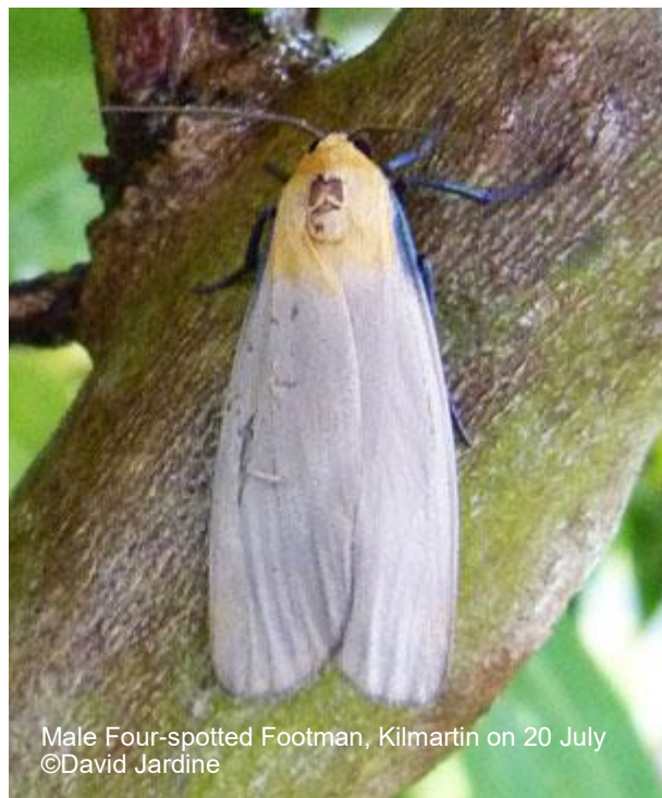
Male Four-spotted Footman, Kilmartin on 20 July