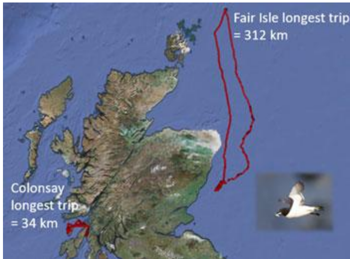
Maximum movements of breeding Razorbills from two colonies in Scotland

phisticated modelling techniques, advice can be given to developers, planning authorities and other agencies to ensure sufficient protection is given. The UK has some of Europe's largest seabird colonies and host huge proportions of the world's populations of breeding Manx Shearwaters (80%), Great Skuas (60%) and Gannets (56%). Unfortunately, many seabird species are in decline and pressures at sea include climate change causing changes in the ecosystem that affect seabird food supply, poor marine planning leading to developments in sensitive seabird areas and activities associated with some fishing practices such as over-fishing of seabird prey and seabirds being accidentally