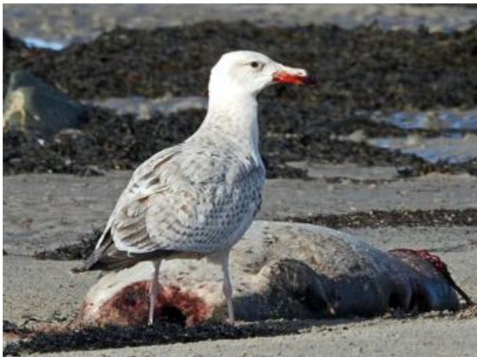
Immature Great Black-backed Gull feeding on a seal carcass (above) ©Jim Dickson.

Malcolm Chattwood (with help from Jim Dickson's notes)