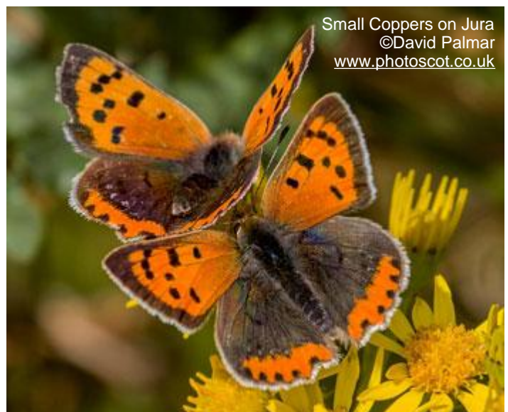
Small Coppers on Jura