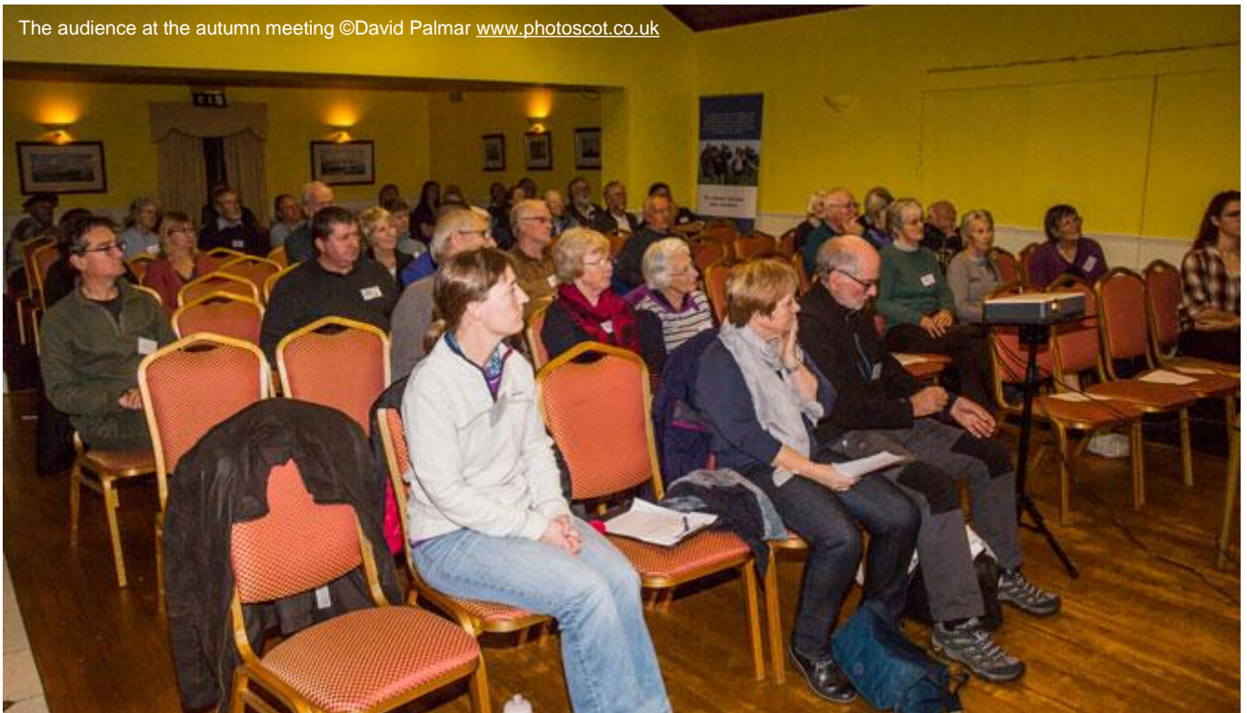
The audience at the autumn meeting