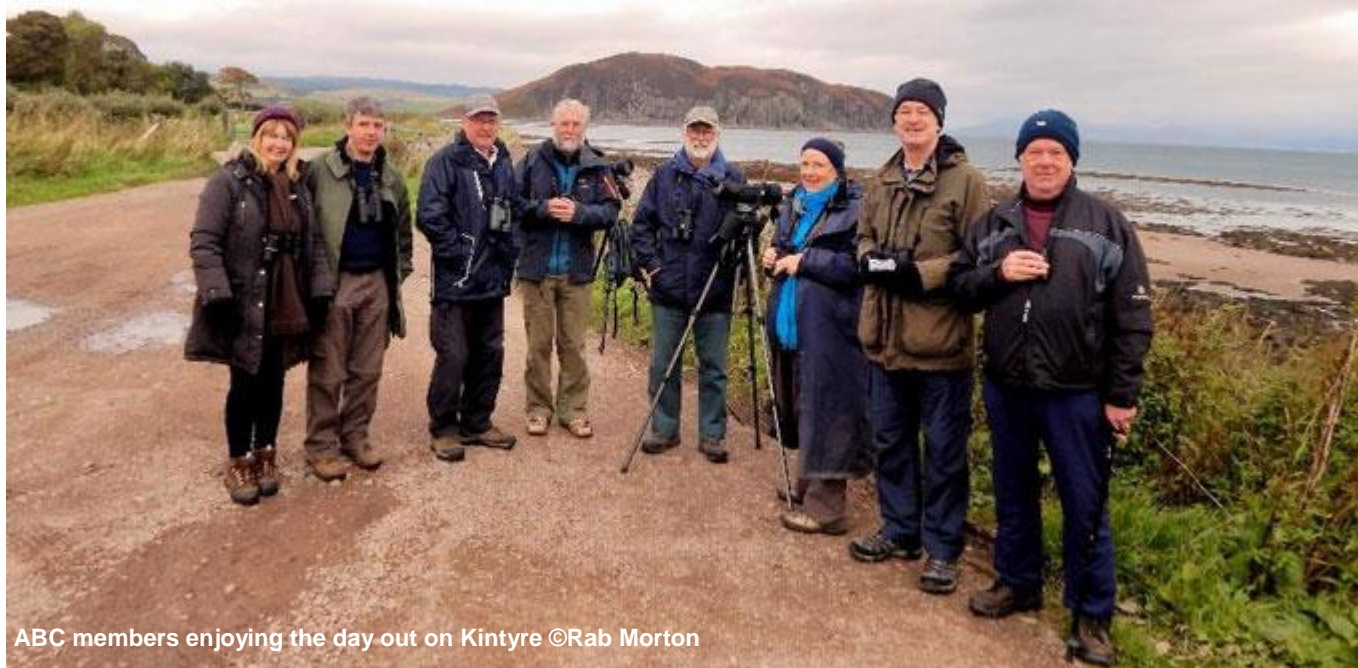
ABC members enjoying the day out on Kintyre

Eight members had headed south down the Kintyre Peninsula and assembled at the Old Pier in Campbeltown to be met by Rab Morton, who was to be our host and guide for the first part of the day. After a short stroll along the Esplanade we set up telescopes to look out over Campbeltown Loch where more species were added to the list. Good views were had of a mix of seabirds including Gannets, Herring Gulls, Shags, Guillemots and a Great Black-backed Gull. Eider and Red-breasted Merganser were noted along with a skulking Grey Heron, which was difficult to see against the background of the North Shore Pier. A scattering of Oystercatchers probed the tideline whilst a flock of a dozen Turnstones were busy giving a pleasing demonstration of how they acquired their name, and leaving few stones unturned. Whilst gazing out over the water it's always easy to forget what might be going on behind you, where Carrion Crows, Jackdaws and Starlings were busy doing what they do in any town area. As we retraced our steps towards the Old Pier, Pied Wagtails were flitting about and a Black Guillemot, almost in its white full winter plumage, was bobbing about. The species' winter plumage is so different from the breeding version and it was a great opportunity for those who perhaps weren't so familiar with the Tystie to imprint the image in their mind for future reference.