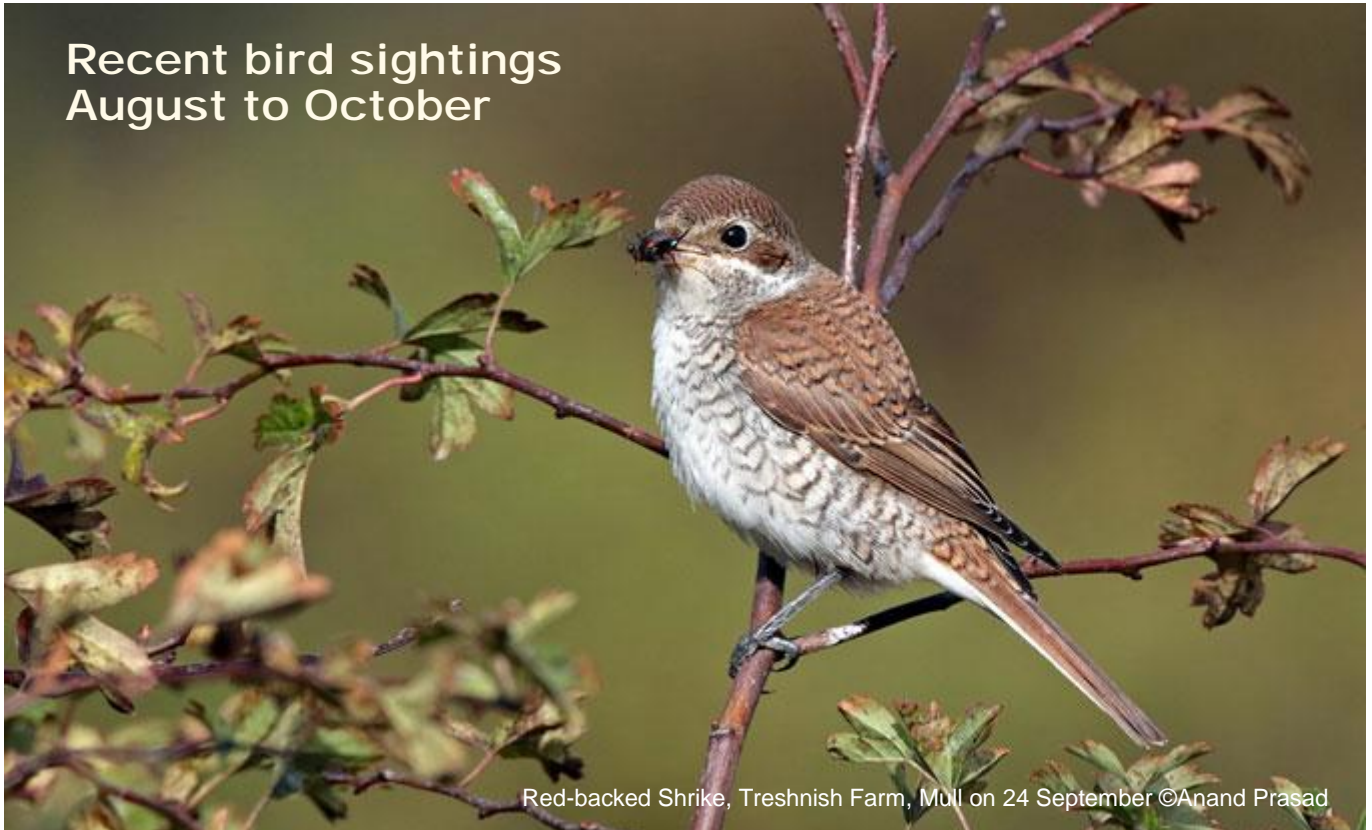
Red-backed Shrike, Treshnish Farm, Mull on 24 September

Presented is a summary of records of rare and unusual species, including high counts and movements of more common species recorded in Argyll during the period. I wish to thank everyone who sent in records and apologise for any errors or omissions. Ideally records should be submitted using the Argyll Bird Recording system or by using the BTO BirdTrack system. For information about either scheme please email: