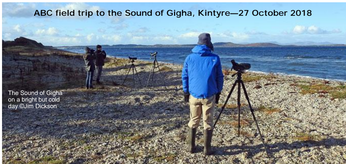
The Sound of Gigha on a bright but cold day