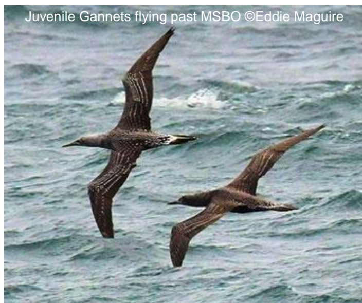
Juvenile Gannets flying past MSBO

Editor's note. I was pleasantly surprised to receive three accounts of this trip! So, I have attempted to combine all three accounts into the one above.