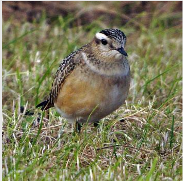
Upper photo: Cattle Egret, Calgary, Mull on 15 October