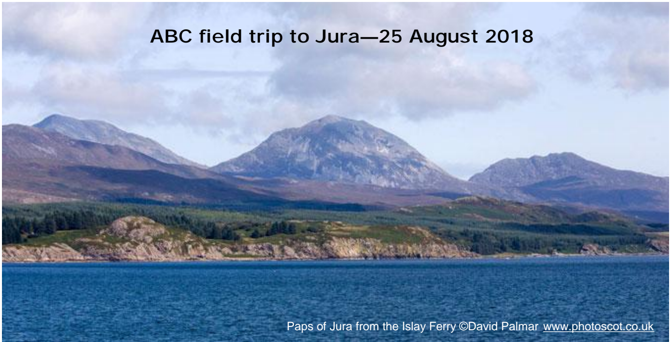
Paps of Jura from the Islay Ferry

Six club members met on a lovely late August day at Kennacraig for this exploratory field trip—the club's first outing to Jura. A few species were seen here, which were not seen later in the day. Four House Martins flew over the terminal and on the shore were a Wigeon, 12 Curlew, two Greenshank and 12 Redshank.