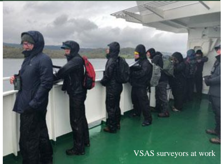
VSAS surveyors at work

Surveys are scheduled to begin in spring 2019 and we are aiming to use three routes. However, ferries for some of these routes do not have suitable outdoor