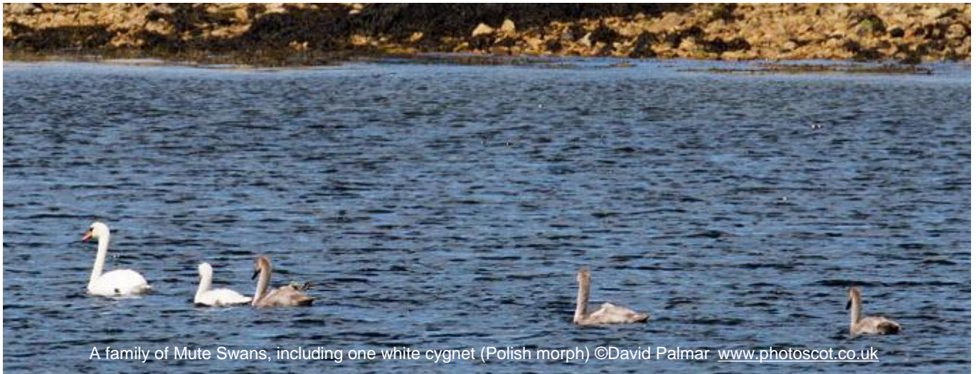
A family of Mute Swans, including one white cygnet (Polish morph)

ing a group of around 20 Siskins and 80 Redpolls feeding on birch catkins in the Inver woodland on their walk up towards Loch a' Chnuic Bhrik. Another Golden Eagle was seen soaring over towards the Paps, which was being mobbed by a Raven and a Kestrel. Six Grey Wagtails were found in one of the disused lay-down areas for Inver Estate hydro project. A scan of the loch from a distance found no birds, but four Mistle Thrushes were spied by Neil Rankine perched on a deer fence, and a Sparrowhawk was seen soaring high in the sky.