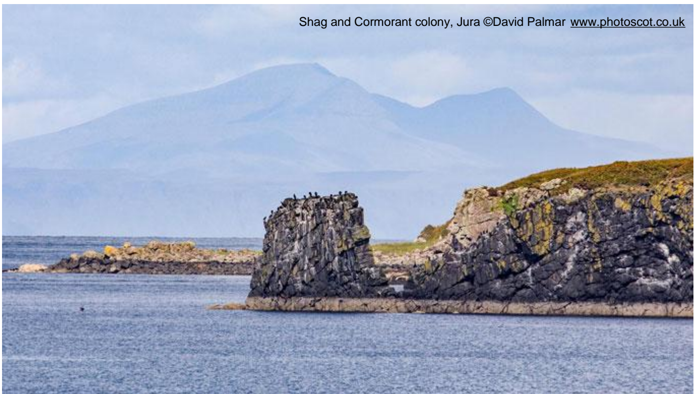
Shag and Cormorant colony, Jura