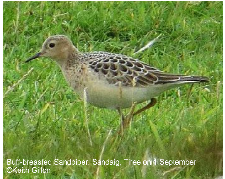
Buff-breasted Sandpiper, Sandaig, Tiree on 1 September

RUFF. Kintyre; first one at MSBO this year was on 12 Aug, then singles on 16 and 28 Aug. Islay; singles at Loch Gruinart on 5 Aug then 1-5 Sep and two there on 18 Sep. Tiree; one moulting adult male was at Loch a' Phuill on 13 Aug, one at Greenhill on 15 Aug and one juvenile at Sandaig on 29 Aug, only six or seven juveniles in Sep with a peak of two at Sandaig on 2 Sep.