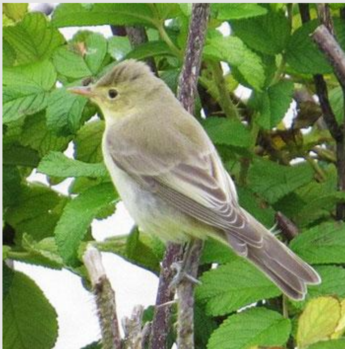
Upper photo: Mediterranean Gull, MSBO on 8 October