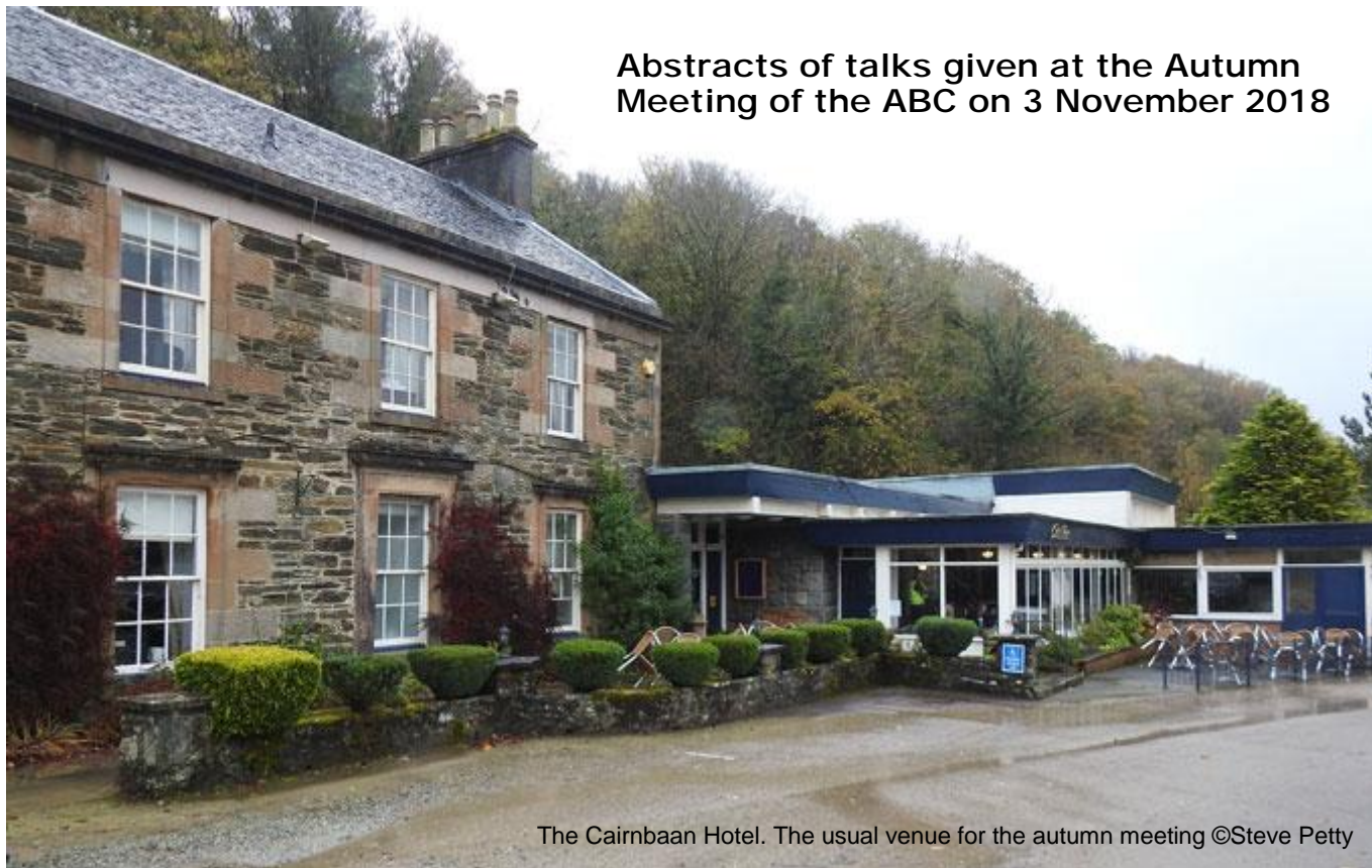
The Cairnbaan Hotel. The usual venue for the autumn meeting