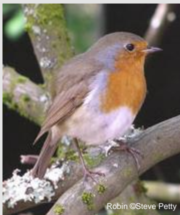
Robin