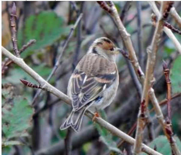
Brambling - Balephuill, Tiree 17 Nov (John Bowler).

16 November: On Tiree: an adult female Lesser Scaup at Loch a' Phuill with 1 Slavonian Grebe plus the drake American Wigeon , 5 Pale-bellied Brents and the Black Redstart again near the pumping station. 3 Sooty Shearwater , 1 ad Pomarine Skua , 1 Leach's Petrel and 2 Great Skuas west off Aird in 1hr from 0800hrs in with 1,130 Kittiwake, 960 large auk (mostly Razorbills), 172 Fulmar, 76 Gannet, 4 Red-throated Diver, 3 Great Northern Diver, 1 Black Guillemot and 2 Purple Sandpipers. The Tree Sparrow and Greenland Redpoll still at Balephuill (John Bowler).