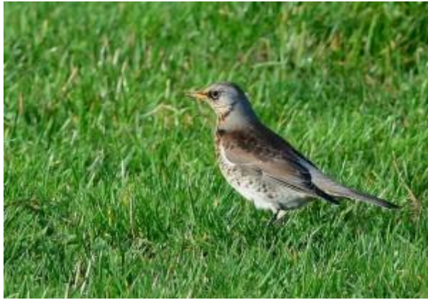
Fieldfare - Strath, Kintyre 16 Nov.