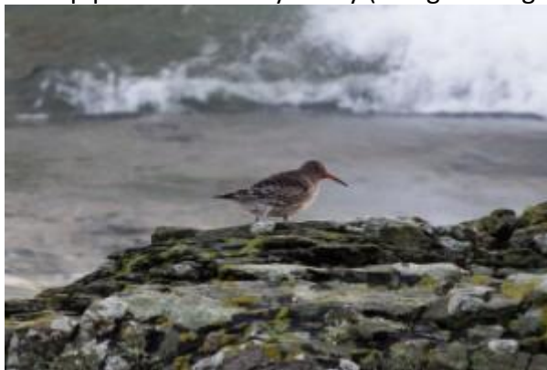
Purple Sandpiper - Oronsay 24 Nov (Morgan Vaughan).

24 November: 3 Purple Sandpipers on Oronsay today (Morgan Vaughan).