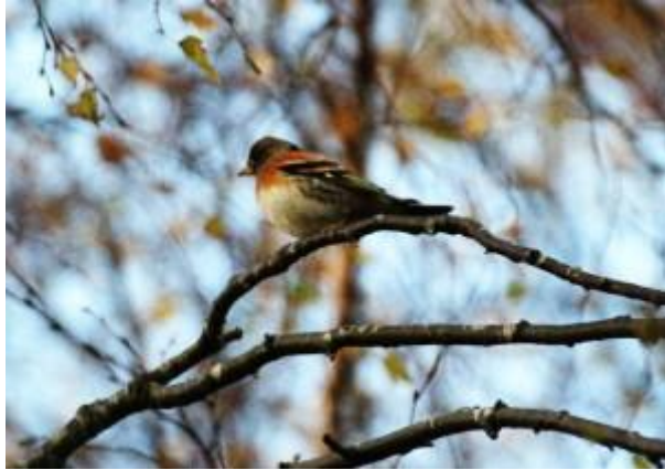
Brambling – Dunoon 02 Nov (Alistair McGregor).

01 November: A juvenile Iceland Gull was at Ormsary, Mid-Argyll today (Errol Crutchfield). On Tiree today: a Yellow-browed Warbler newly arrived at Balephuill; also a female Blackcap, 150 Redwings and 2 Siskins there. And on Loch a' Phuill: 350 Whooper Swans, the drake American Wigeon and the immature/female Greater Scaup still present (John Bowler. A Firecrest was reported at Knock, Mull today (Sue & David McDowell per Alan Spellman). There is only one previous Mull record - at Tobermory on 13 Nov 2012.