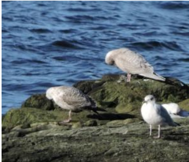
Iceland Gull - Ormsary, Mid-Argyll 1 Nov (Errol Crutchfield).

01 November: A juvenile Iceland Gull was at Ormsary, Mid-Argyll today (Errol Crutchfield). On Tiree today: a Yellow-browed Warbler newly arrived at Balephuill; also a female Blackcap, 150 Redwings and 2 Siskins there. And on Loch a' Phuill: 350 Whooper Swans, the drake American Wigeon and the immature/female Greater Scaup still present (John Bowler. A Firecrest was reported at Knock, Mull today (Sue & David McDowell per Alan Spellman). There is only one previous Mull record - at Tobermory on 13 Nov 2012.