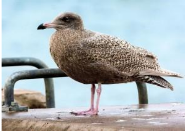
Glaucous Gull - Campbeltown, Kintyre 12 Nov (Eddie Maguire).

11 November: On Tiree today at Loch a' Phuill the drake American Wigeon again at Loch a' Phuill, Black Redstart again near the pumping station, 1 Great Northern Diver on the loch, 33 Goldeneye and 6 Gadwall but numbers of Whoopers have dropped to 204. Also 180 Redwing and 1 Kestrel at Meningie and a Greenland Redpoll with Twite at Balephuill (John Bowler).