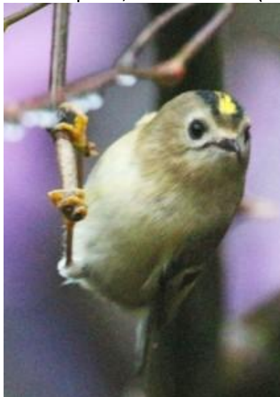
Goldcrest - Hunter's Quay, Cowal 15 Nov (Alistair Mc Gregor).