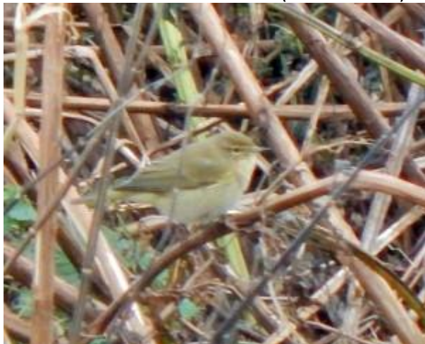
Chiffchaff - Balephuill, Tiree 14 Nov (John Bowler).