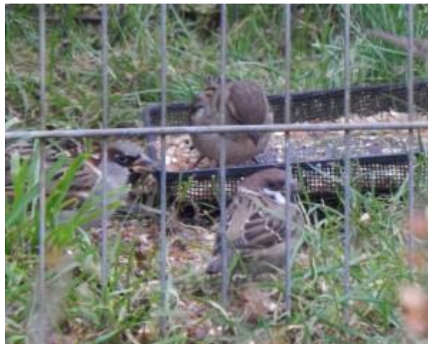
Tree Sparrow – Balephuill, Tìree 02 Nov.