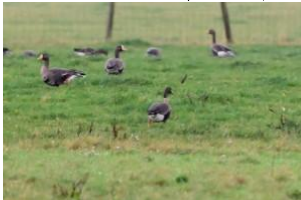
Greenland White-fronted Geese – Strath Farm (The Laggan), Kintyre 05 Nov.

A record count of 502 Whooper Swans was made around Tíree today, including site record of 431 at Loch a' Phuill. Elsewhere: the Tree Sparrow was still at Balephuill, a Short-eared Owl and a Woodcock reported at Cornaigmore, a male Hen Harrier and a Common Chiffchaff at The Glebe and 5 Long-tailed Ducks, 4 Common Scoter heading south, 8 Red-throated Divers and 7 Great Northern Divers at Hough Bay. Scattered groups of Redwings and Fieldfares were all over the island.