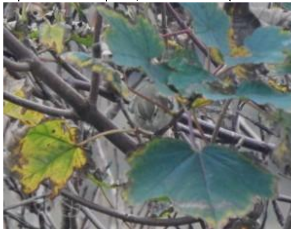
Yellow-browed Warbler – Balephuill, Tìree 02 Nov.

About a dozen Brambling were among a flock of Chaffinches and numerous Goldcrests on Halton Estate, Dunoon (close to the end of the fourteenth hole on Dunoon golf course).