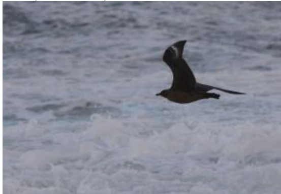
Great Skua - MSBO, Kintyre 29 Nov (Eddie Maguire).

A female Brambling at the bird feeder at Totronald, Coll and several folk are reporting seeing Moorhen in strange places – I'm guessing there might be an influx and they are popping up all over the place (Ben Jones).