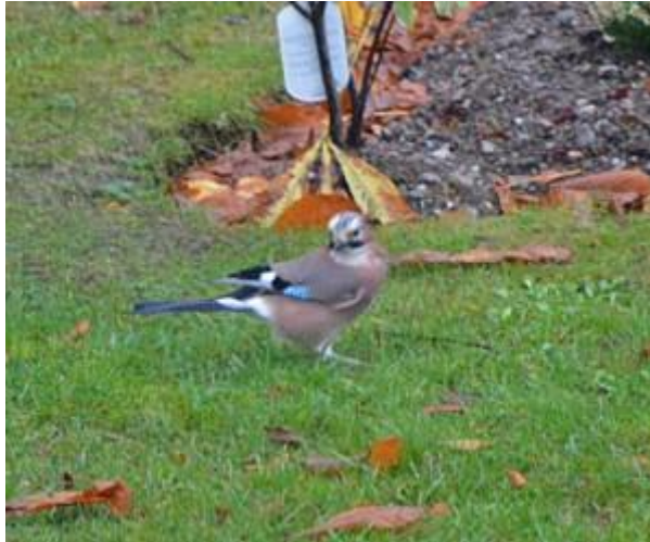
Jay - Sandbank, Cowal 10 Nov.