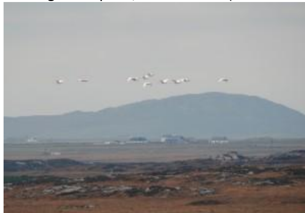
Whooper Swans over Vaul, Tiree 04 Nov.