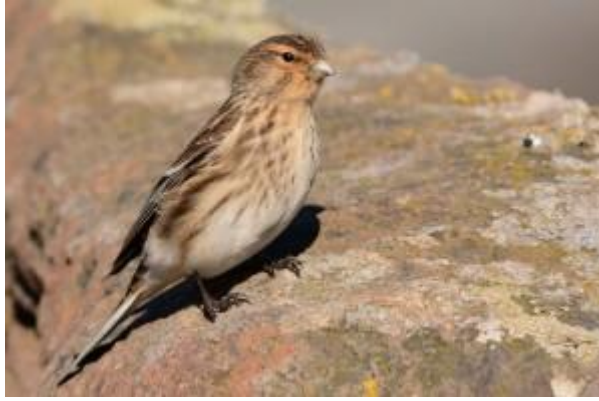
Twite - MSBO, Kintyre (Eddie Maguire).

08 November: Details have been received of the White-fronted Goose (neck collar P1J) photographed at Strath Farm, The Laggan, S Kintyre 5 November.