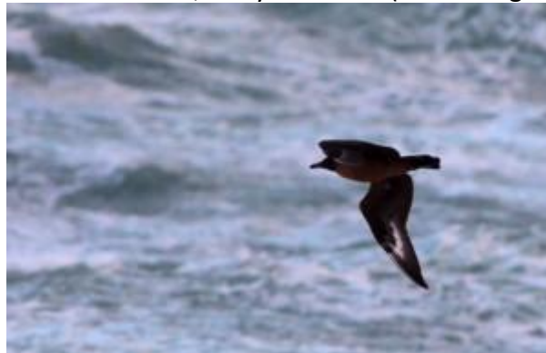
Great Skua - MSBO, Kintyre 29 Nov (Eddie Maguire).