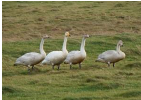
Whooper Swans - Tiree 13 Nov.