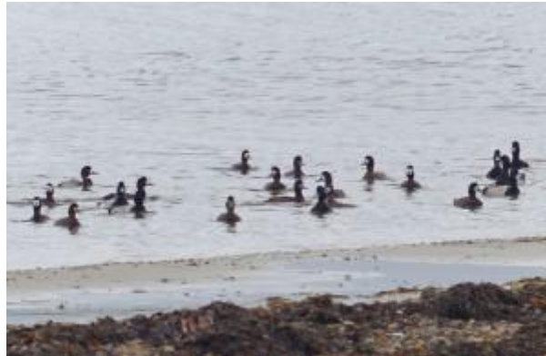
Greater Scaup – Loch Indaal, Islay 04 Nov (Mike Peacock).

04 November: At Loch Indaal, Islay (Port Charlotte across to Gartbreck) in flat calm conditions: 9 Red-throated Divers and 53 Great Northern Divers , including a flock of 37 engaged in communal fishing. And off Blackrock, 2 Pale-bellied Brent Geese , 48 Greater Scaup , 32 Common Eiders , a female Long-tailed Duck , 22 Common Scoters , 3 Common Goldeneyes , 5 Red-breasted Mergansers and a further 5 Great Northern Divers (Mike Peacock).