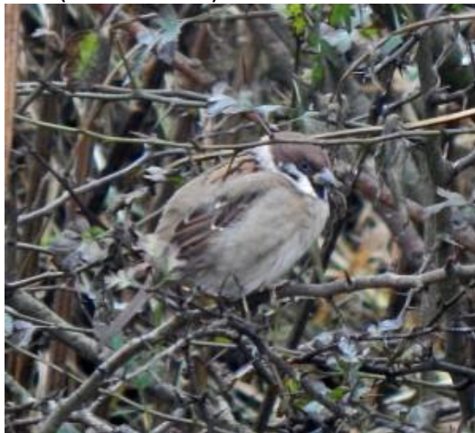
Tree Sparrow - Balephuill, Tiree 15 Nov (John Bowler).

On Tiree: 6 Fieldfare and 1 Tree Sparrow at Balephuill 250 Redwing at West Hynish and 5 Black-headed Gull south there (John Bowler).