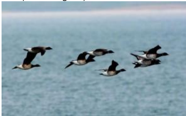
Pale-bellied Brent Geese – MSBO, Kintyre 05 Nov (Eddie Maguire).

05 November: During a 5hr sea-watch at Machrihanish Seabird Observatory, Kintyre today there were: 24 Brent Geese and ca 100 Mallards . Birds flying S included a Black-throated Diver , 5 Great Northern Divers , 12 Ringed Plovers and 4 Curlew Sandpipers . And at Strath Farm west pool (The Laggan): geese included 440 White-fronts (including neck collar PIJ) , 9 Barnacles , and 11 Pink-feet (Eddie Maguire).