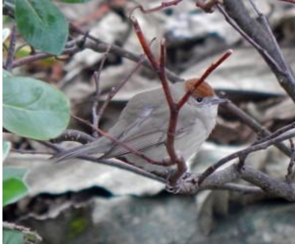
Blackcap - Balephuill, Tiree 17 Nov (John Bowler).