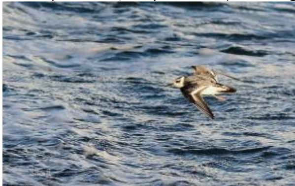
Grey Phalarope - MSBO, Kintyre 19 Nov (Eddie Maguire).

18 November: A juvenile Iceland Gull was at Calgary, Mull (Anand Prasad).