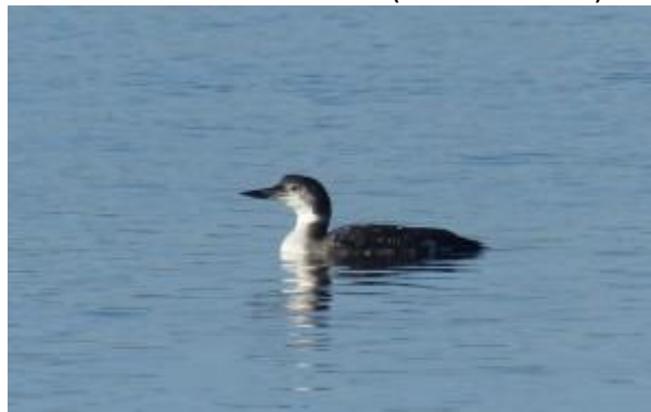
G N Diver - Loch Gruinart, Islay 22 Nov (Mike Peacock).

At Loch Indaal, Port Charlotte across to Gartbrek – Laggan Point: 31 Great Northern Diver, 9 Red-throated Diver, 53 & 9 Common Scoter flocks (Mike Peacock).