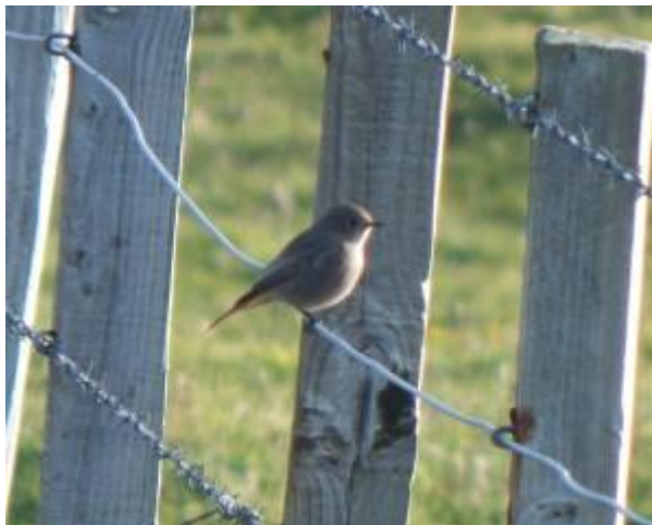
Black Redstart – Loch a' Phuill, Tiree 07 Nov (John Bowler).

On Tiree today: 398 Whooper Swans , the drake American Wigeon and 6 Gadwall at Loch a' Phuill. An immature Black Redstart was near the Pumping Station at Loch a' Phuill as well as 45 Meadow Pipits and 2 Linnets and a Tree Sparrow still at Balephuill with an abietinus -type ('Scandinavian') Common Chiffchaff and 3 Northwestern (Greenland) Redpolls (John Bowler).