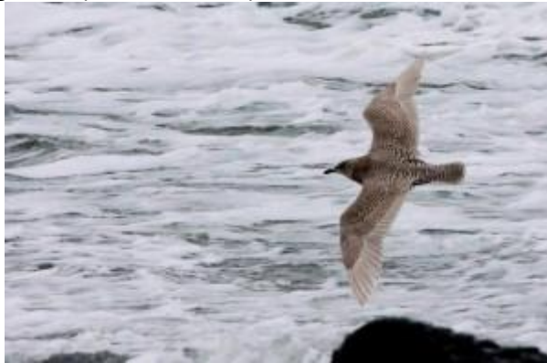
Iceland Gull - MSBO, Kintyre 28 Nov.