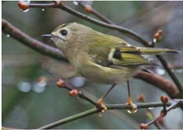
Goldcrest - Hunter's Quay, Cowal 15 Nov.