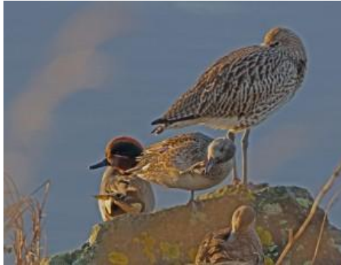
Teal and Curlew - Loch Gilp, Mid-Argyll 30 Nov (Jim Dickson).

At Loch Gilp, Mid-Argyll: 37 Bar-tailed Godwits, 9 Grey Herons and 2 Little Grebes (Jim Dickson).