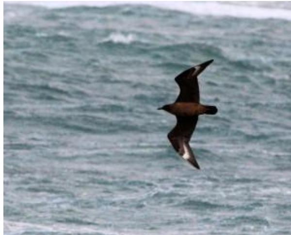
Great Skua - MSBO, Kintyre 13 Nov (Eddie Maguire).

12 November: The juvenile Glaucous Gull still at Campbeltown harbour, Kintyre (Eddie Maguire).